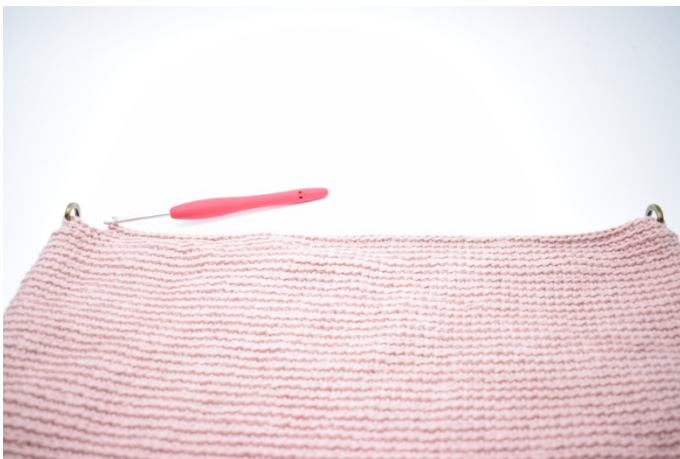
7. Work sc in the BL of each st to the end of the rnd.