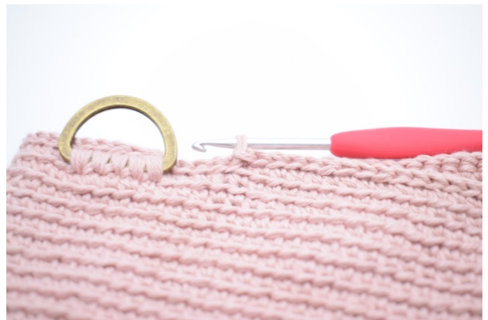
8. Like this.