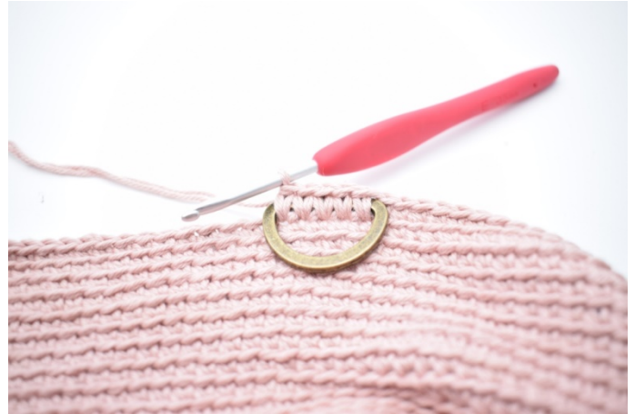
6. Like this.