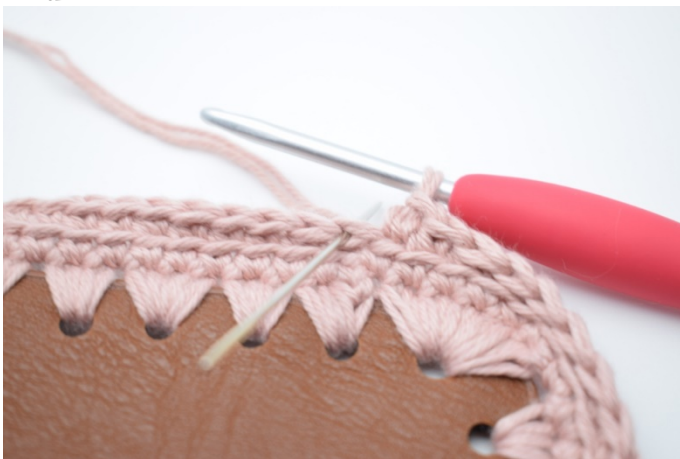
1. Repeat the previous rnd. Work sc in the BL of each st to the end of the rnd.