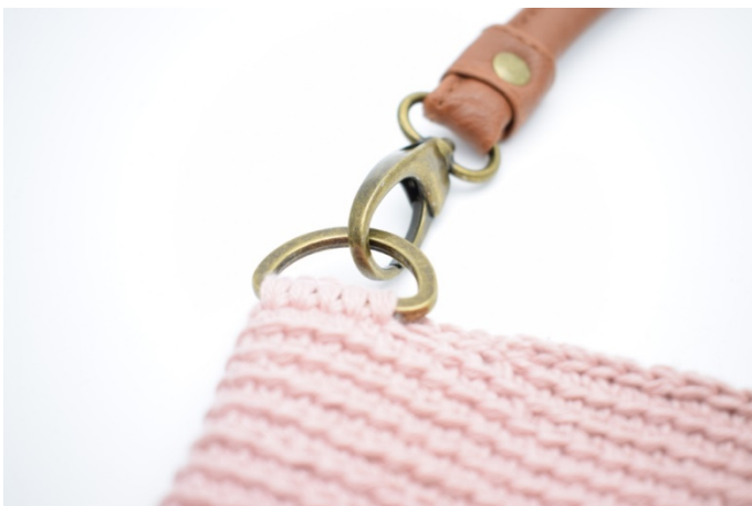
9. Clip the handle to the D-Rings.