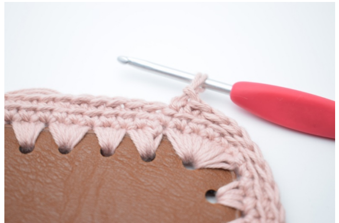
6. Repeat to the end of the rnd.