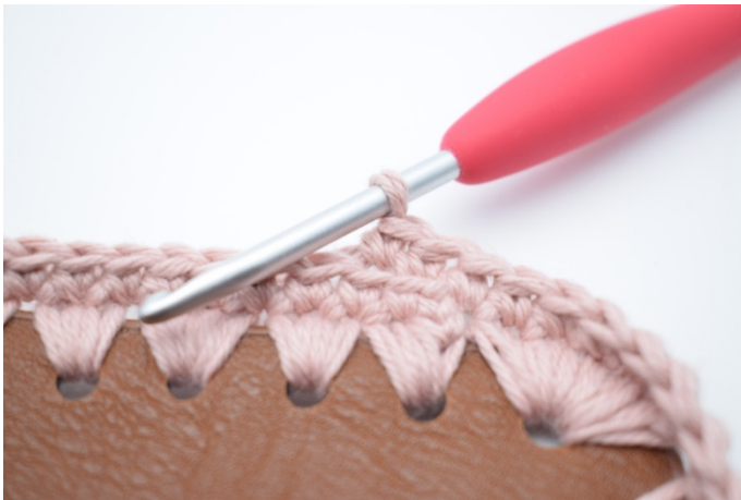
5. Like this.