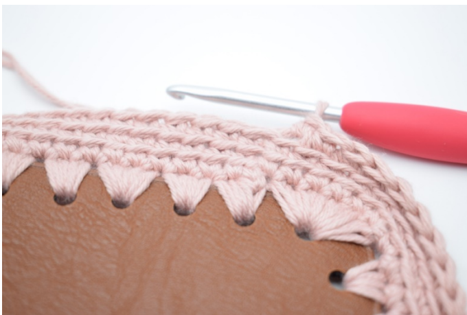
3. Continue to the end of th rnd.