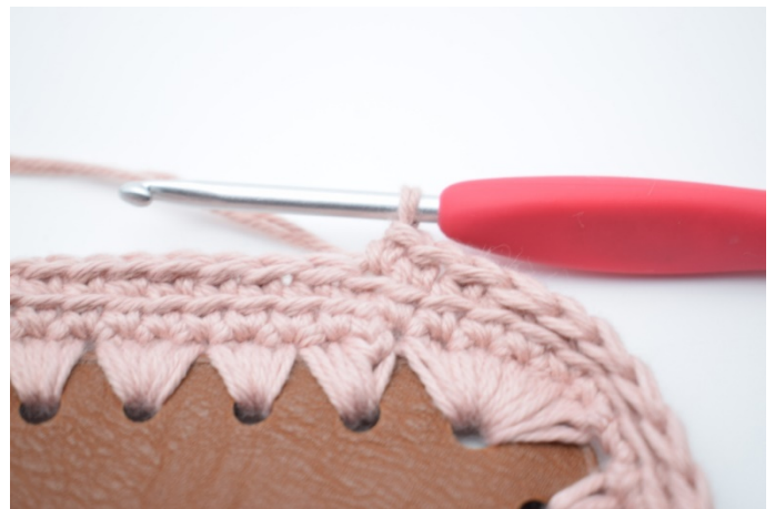
2. Like this.