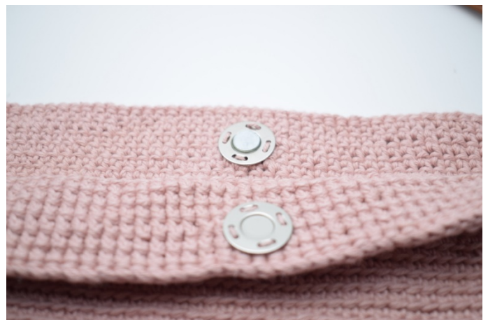
10. Sew the magnetic closure in place on the inside edge of the bag in the middle.