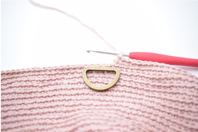
5. Crochet over the D-Ring to secure it with 5 sc.