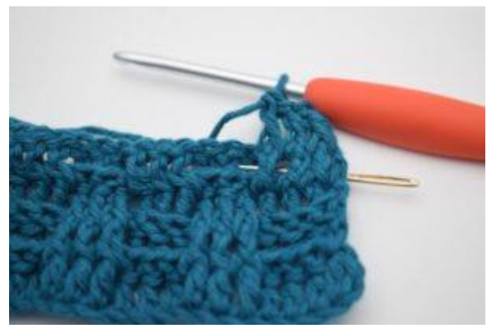
5. Work 1 bpdc around the next st.