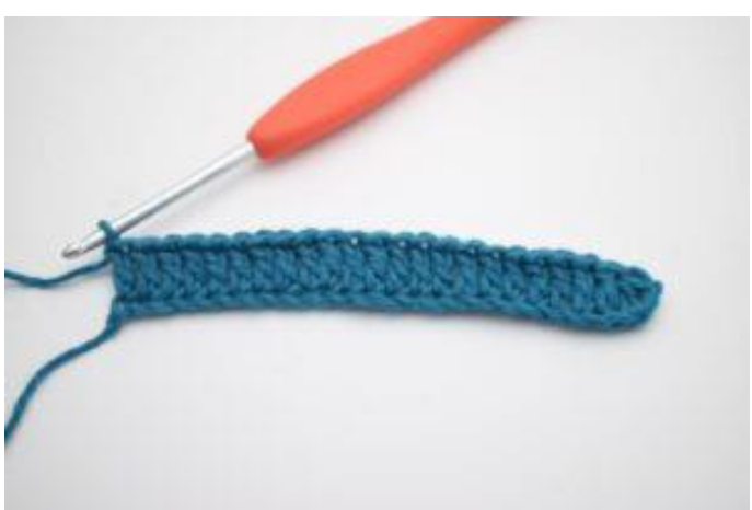
4. Work dc to the end of the row.