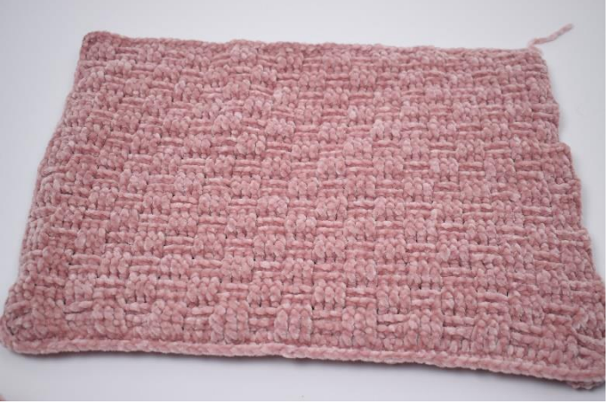
5. Work sc around 3 sides.