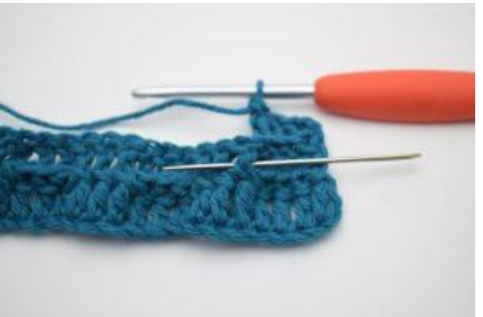
5. Work 1 fpdc around the next st.