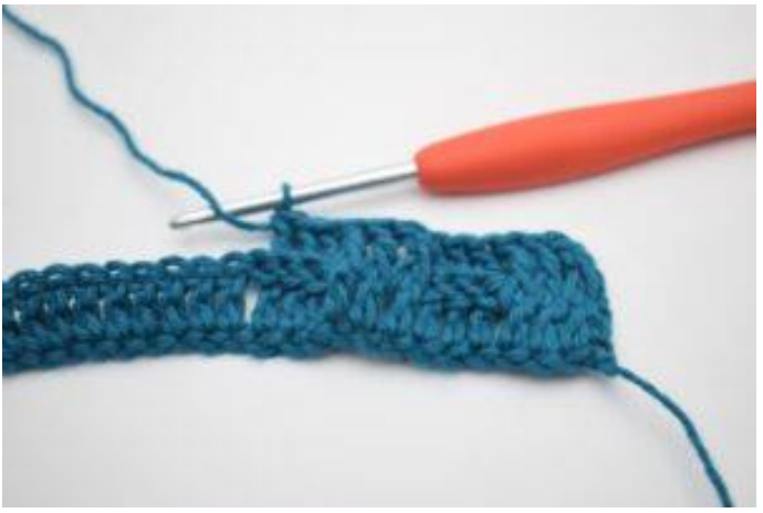
9. Work 1 bpdc around the next 3 sts.