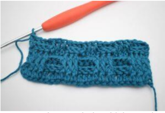
8. Continue alternating bpdc and fpdc around sets of 3 sts. The row ends with 3 bpdc. In the last st, work 1 regular dc.