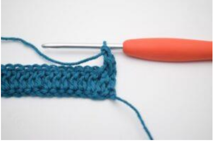
3. Like this. Now you have 1 fpdc.