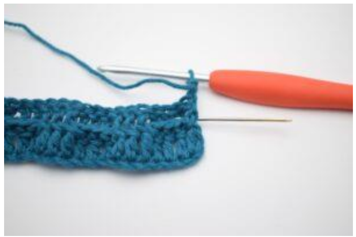
2. Work 1 bpdc around the first st.