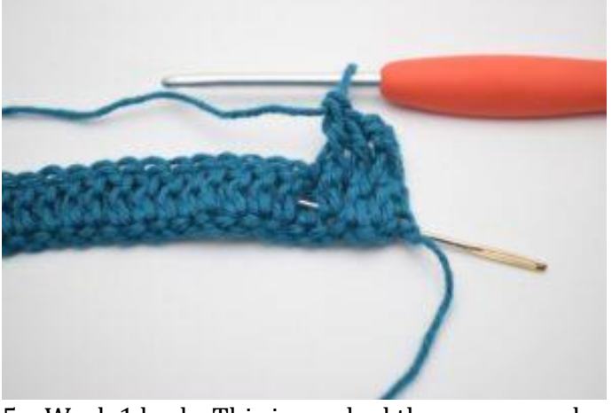
5. Work 1 bpdc. This is worked the same as a dc but from the back and around the post of the dc from the previous row. The needle indicates where to insert the hook.