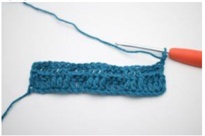
1. Ch 2 and turn.