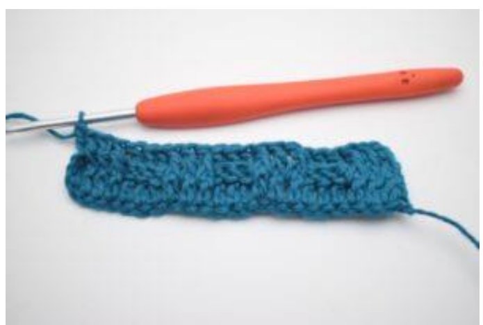
12. Like this.