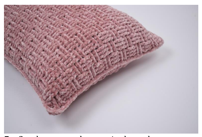
7. Cut the yarn and weave in the ends.