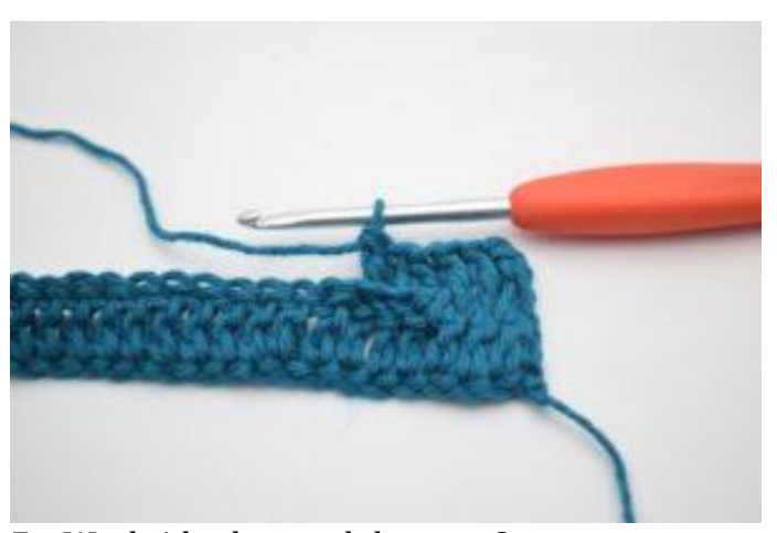
7. Work 1 bpdc aroud the next 2 sts.