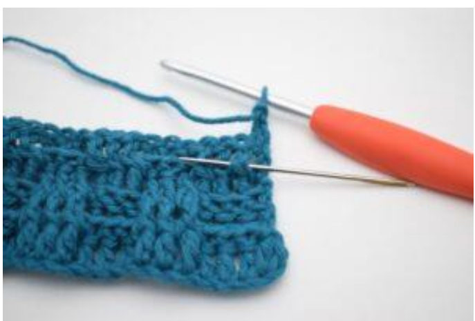
2. Work 1 fpdc around the first st.