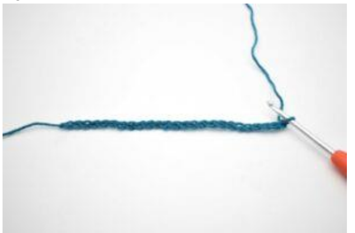
1. Begin with a ch.