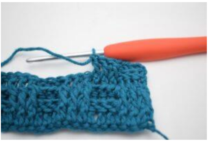
7. Work 1 fpdc around the next 2 sts.