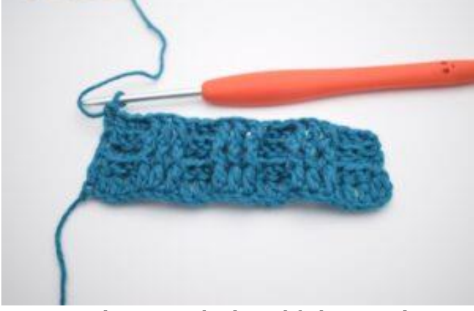
Continue alternating bpdc and fpdc around sets of 3 sts. The row ends with 3 bpdc. In the last st, work 1 regular dc.