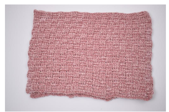
1. Lay the pieces together.