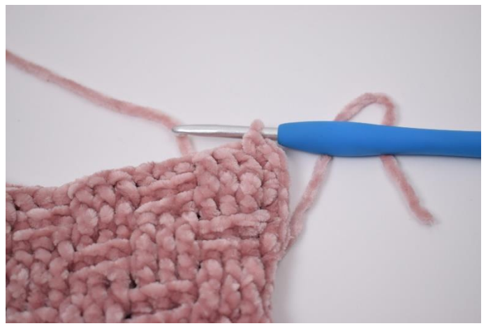
Work sc through both pieces to the corner. In 4. Continue with sc through both layers. the corner work 3 sc.