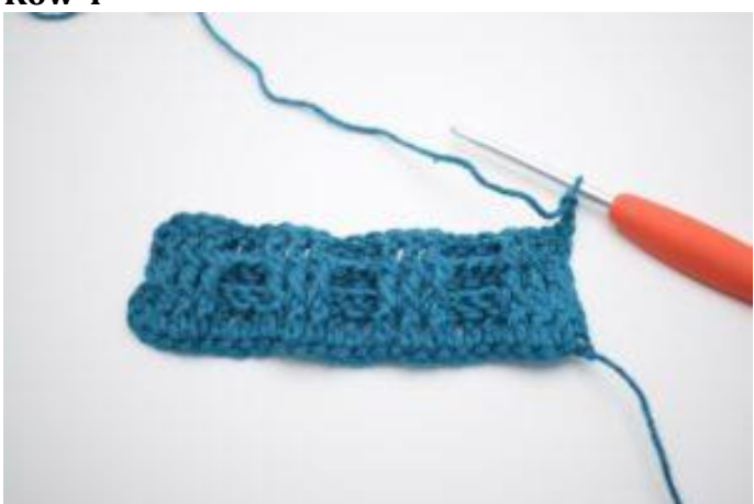
1. Ch 2 and turn.