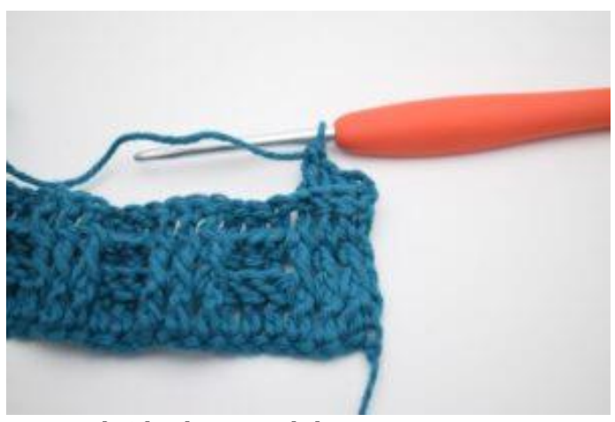
4. Work 1 bpdc around the next 2 sts.