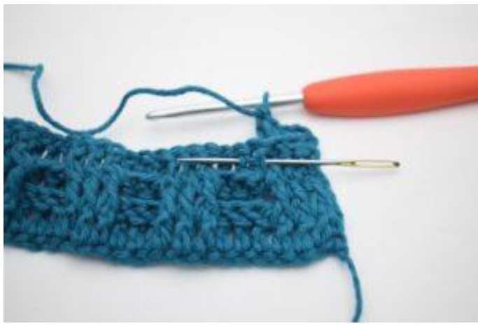
5. Work 1 fpdc around the next st.