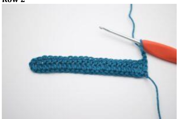
1. Ch 2 and turn.