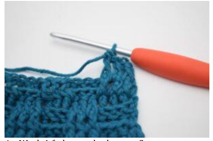
4. Work 1 fpdc aroudn the next 2 sts.