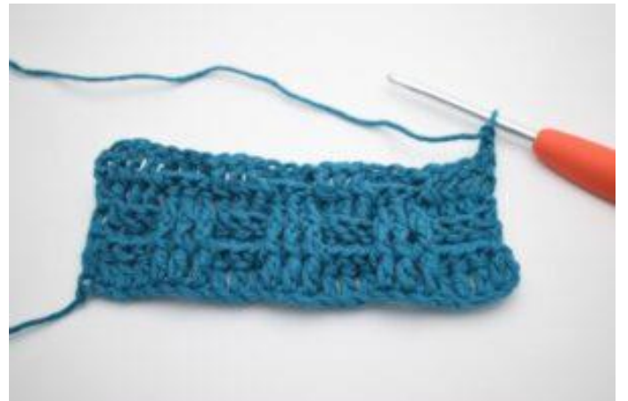
1. Ch 2 and turn.