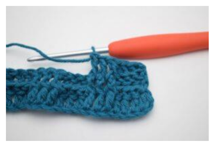
7. Work 1 fpdc around the next 2 sts.