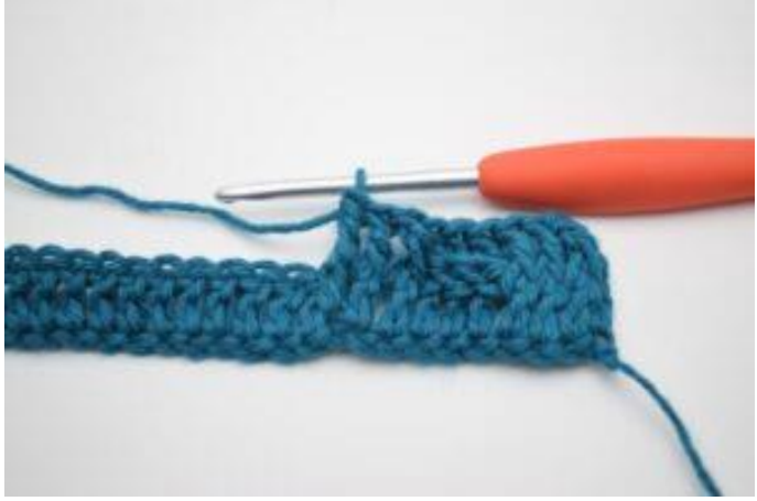
8. Work 1 fpdc around the next 3 sts.