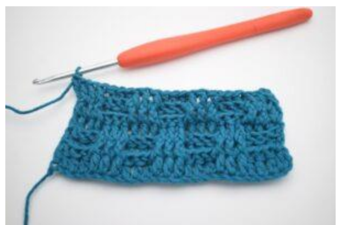
8. Continue alternating fpdc and bpdc around sets of 3 sts. The row ends with 3 fpdc. In the last st, work 1 regular dc. Repeat Rows 2-5 as instructed in the written pattern.