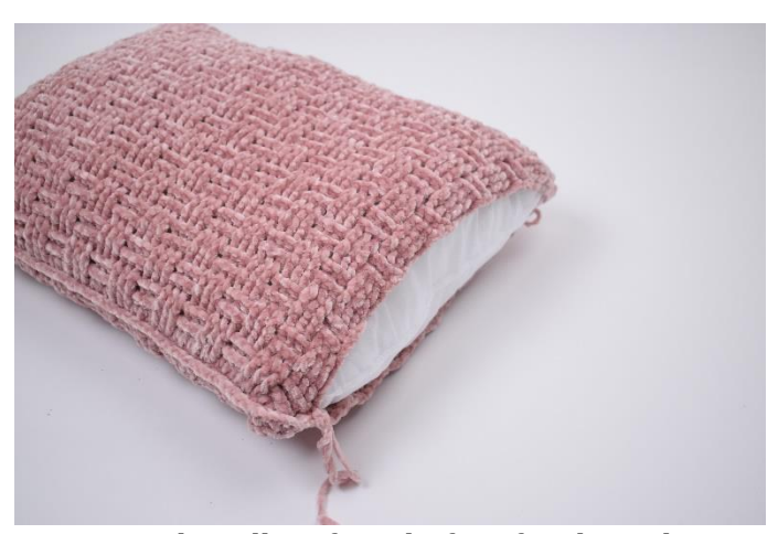
6. Insert the pillow form before finishing the last side with sc.