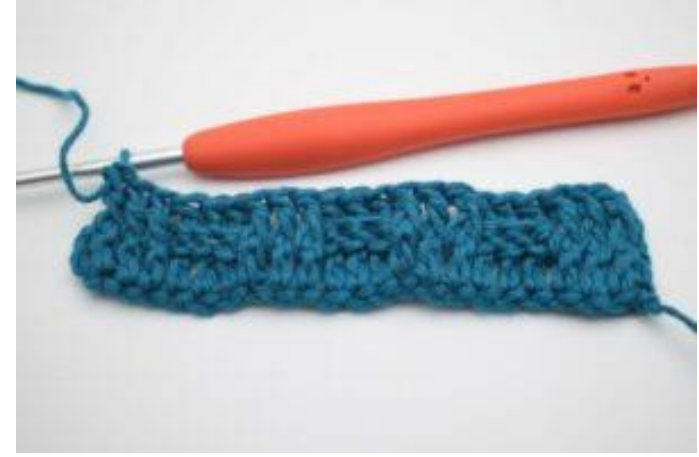
10. Continue alternating fpdc and bpdc around sets of 3 sts. The row ends with 3 fpdc.