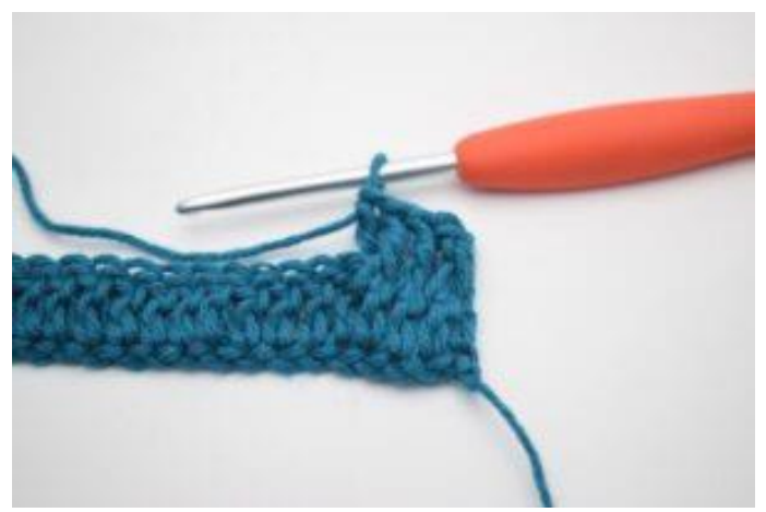
6. Like this. Now you have 1 bpdc.