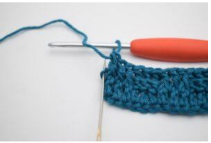
11. In the last st, work 1 regular dc.