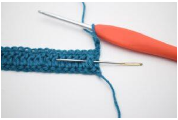
2. Work 1 fpdc. This is worked the same as a dc, just worked around he post of the dc from the previous row. The needle indicates where to insert the hook.