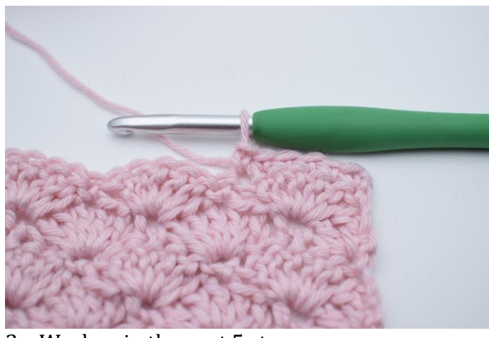
2. Work sc in the next 5 sts.