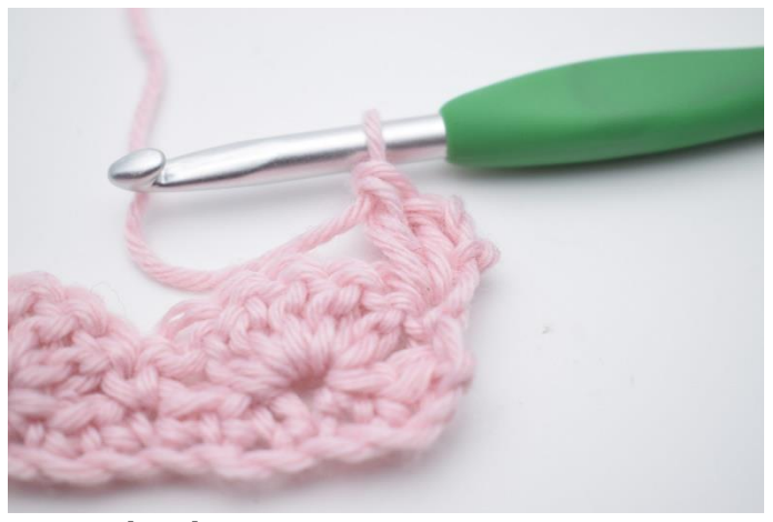
3. Work 2 dc.