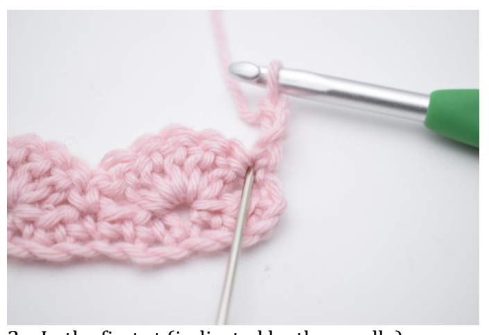
2. In the first st (indicated by the needle),