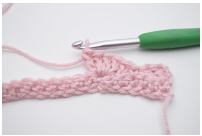
7. work 5 dc in the next st.