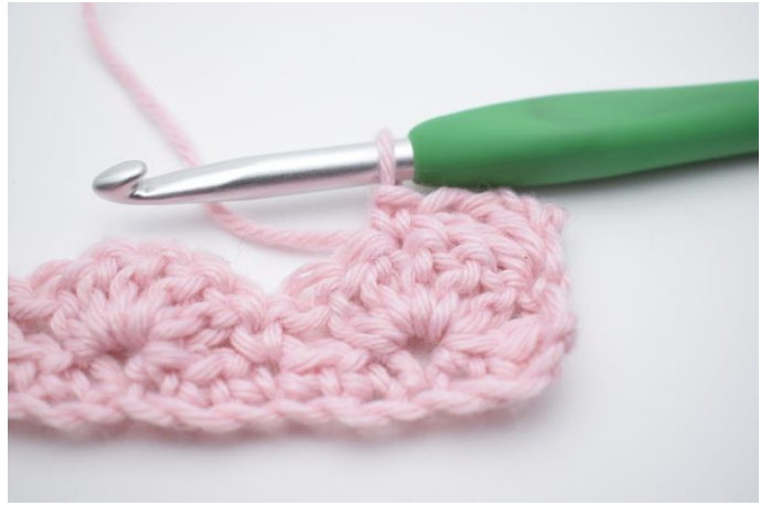
5. work 1 sc in the next st.