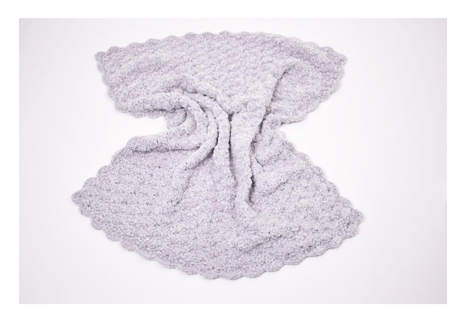
Enjoy! © Best Wishes, Hobbii