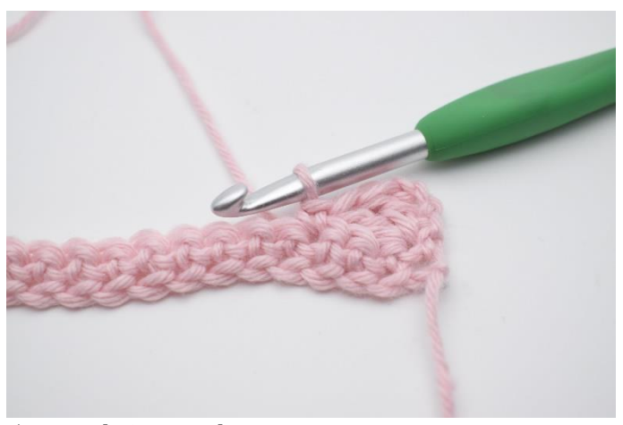
5. Work 1 sc in the next st.