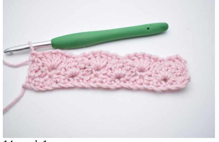
14. work 1 sc. Repeat Row 4 as instructed in the written pattern.