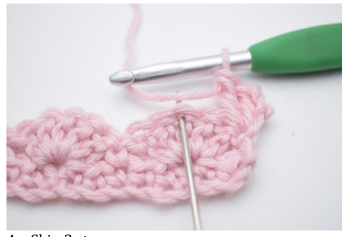
4. Skip 2 sts,