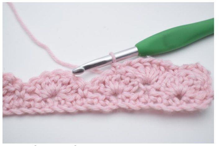
9. work 1 sc in the next st.