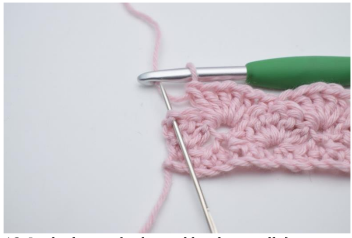
13. In the last st (indicated by the needle),