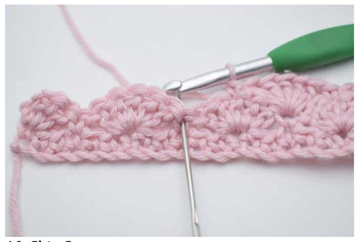
10. Skip 2 sts,