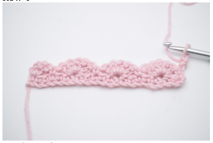
1. Ch 3 and turn.