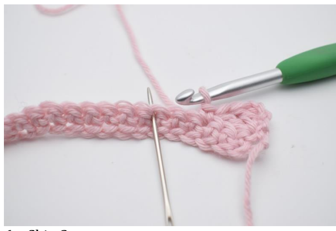
6. Skip 2 sts,