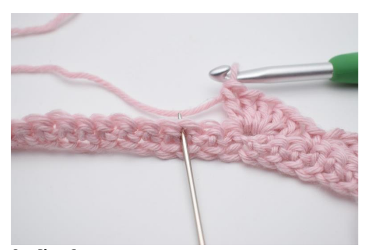
8. Skip 2 sts,