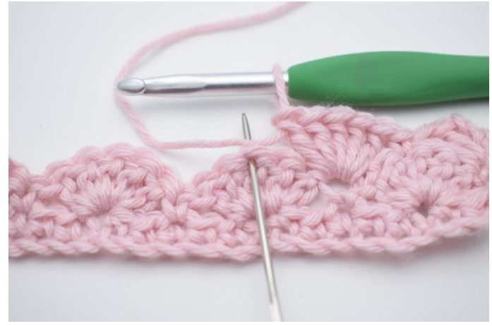
8. Skip 2 sts,