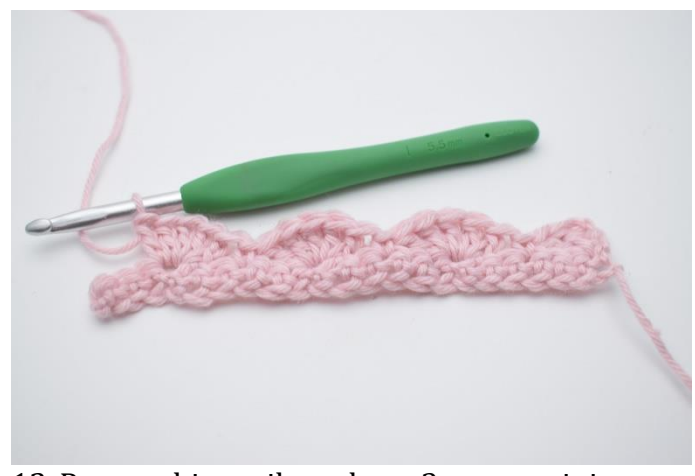
12. Repeat this until you have 3 sts remaining.