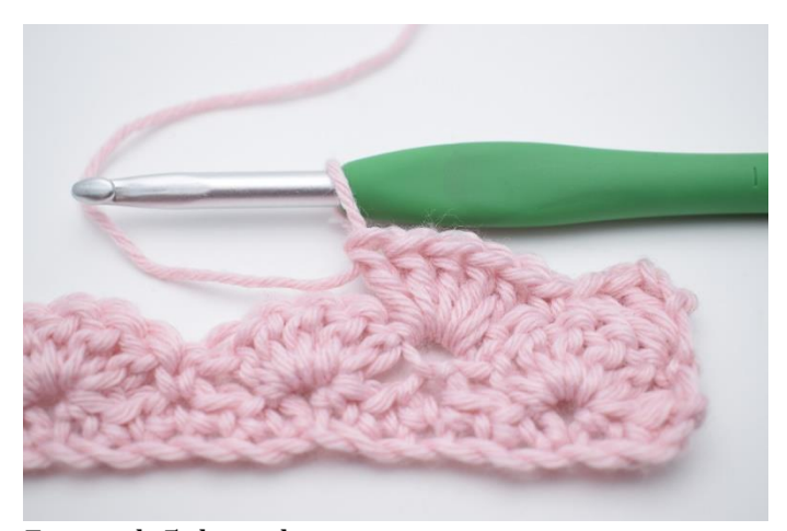
7. work 5 dc in the next st.