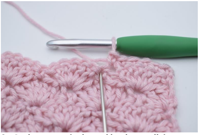
3. In the next st (indicated by the needle),