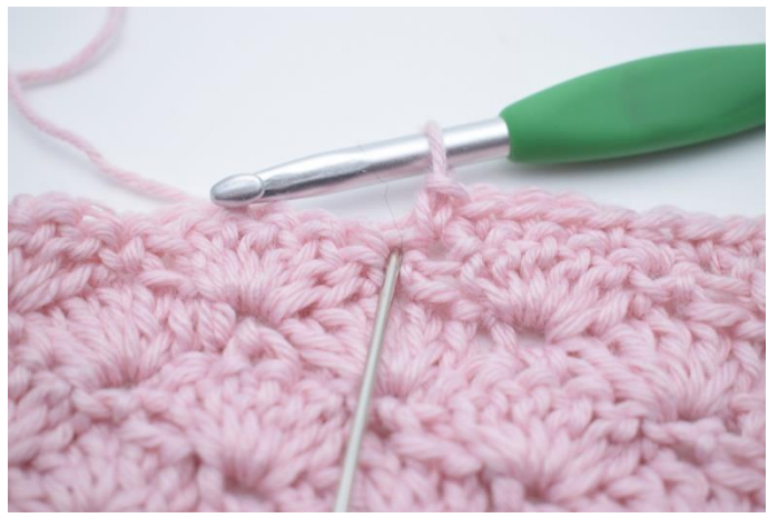
6. In the next st (indicated by the needle),