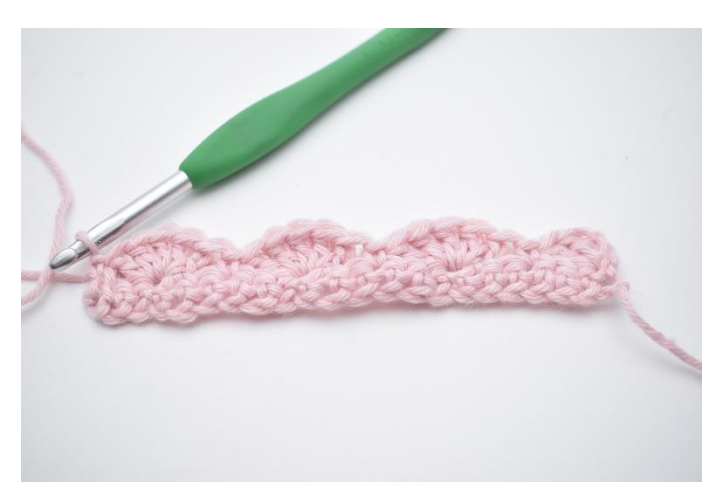
14. work 1 sc.