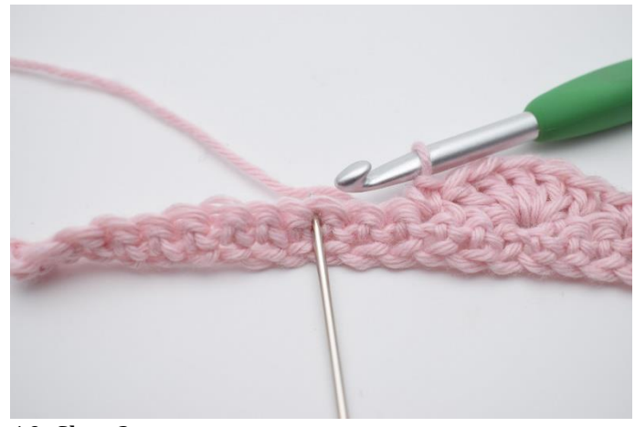
10. Skip 2 sts,