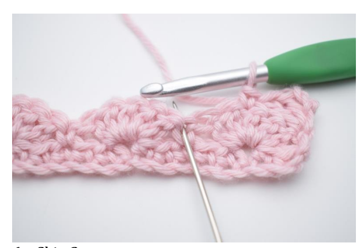
6. Skip 2 sts,