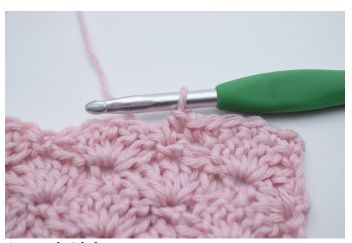
4. work 1 hdc.