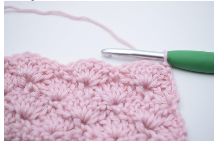
1. Ch 1 and turn.