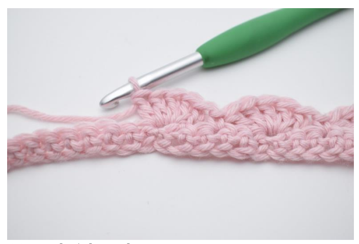
11. work 5 dc in the next st.