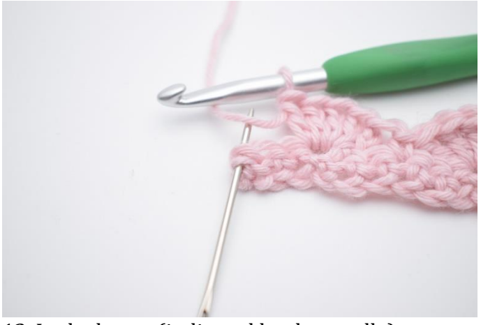
13. In the last st (indicated by the needle),