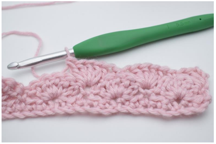
11. work 5 dc in the next st.