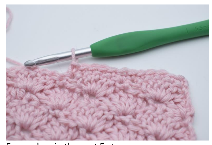
5. work sc in the next 5 sts.