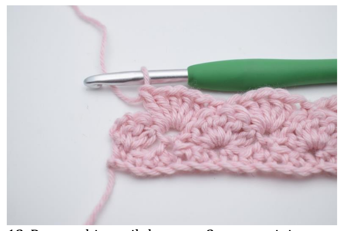
12. Repeat this until there are 3 sts remaining,