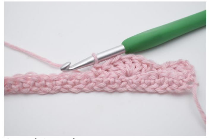
9. work 1 sc in the next st.