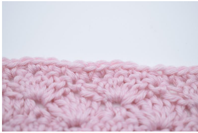
8. Repeat to the end of the row. Cut the yarn and weave in the ends.