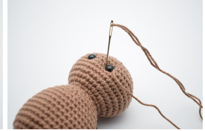
2. Insert the needle into the other side of the eye, and tighten the sewing string a bit.

1. In brown yarn, pull the needle out through the side of one of the eyes,