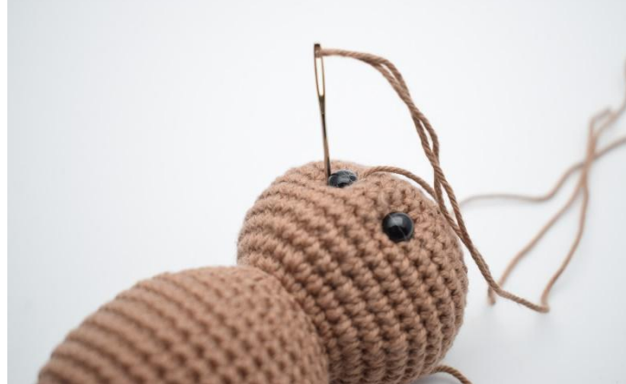
and down again at the other side of the same