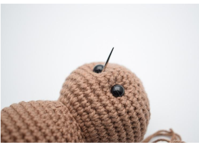
Pull the needle out through the side of the 3. other eye,