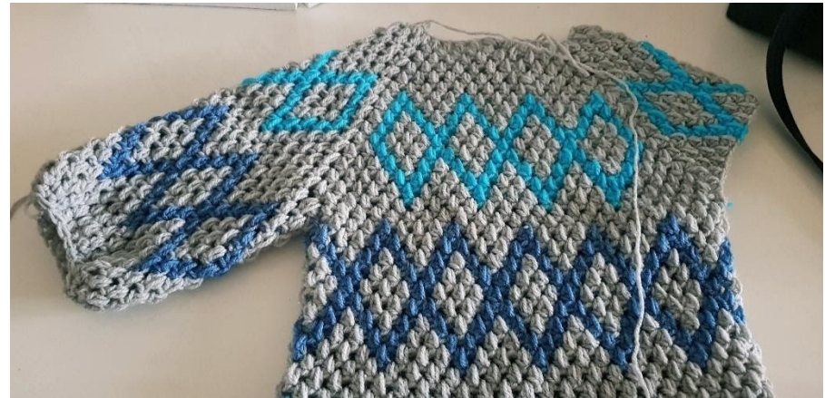
*the picture above is for a child size

If you want to have a longer sleeve you can follow the same pattern as for the body.