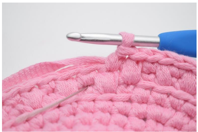
15. Work 1 long-sc in the spot indicated by the needle.