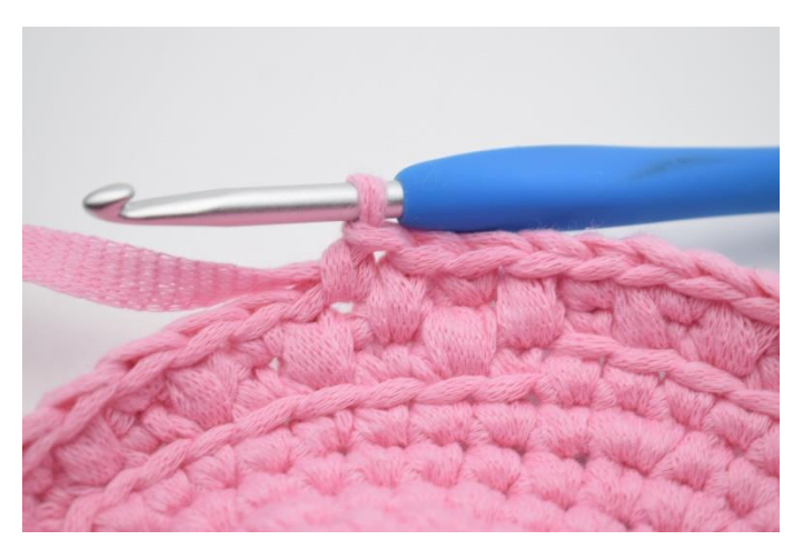
17. Work 1 sc into the next st.