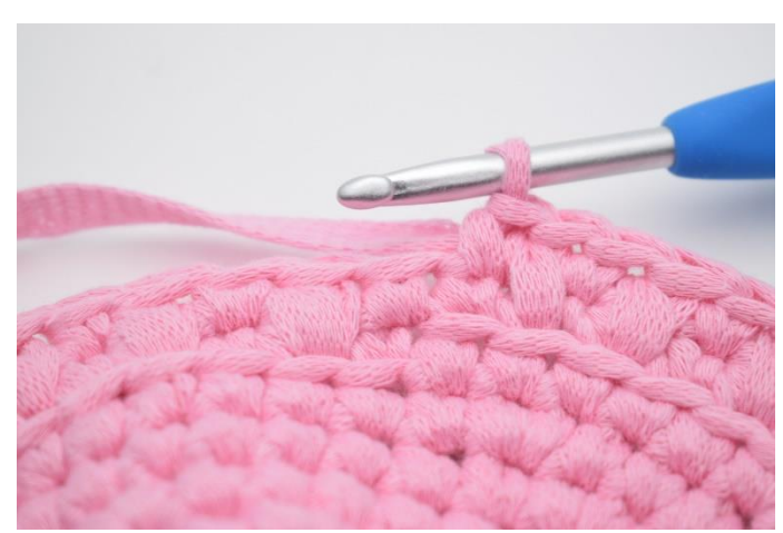
11. Continue alternating sc and long-sc to the end of the rnd. End with 1 sc.