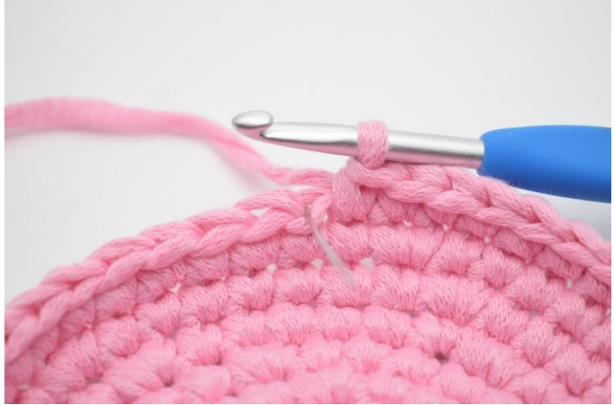
2. Work sc into the BL where the needle is pointing.