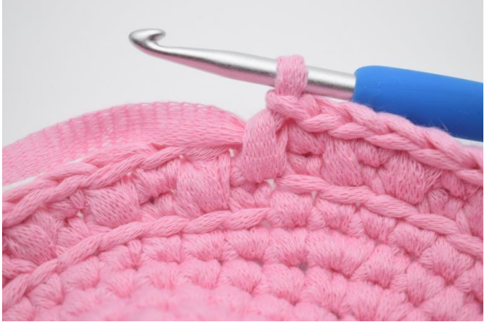
13. Like this.