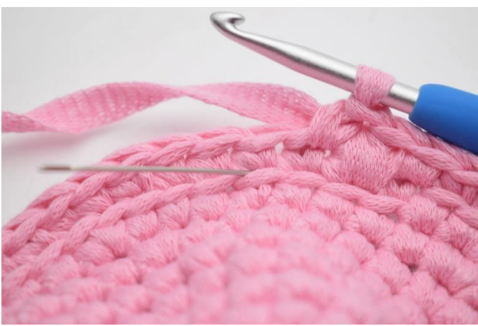
9. Work 1 long- sc into the next st as indicated by the needle.