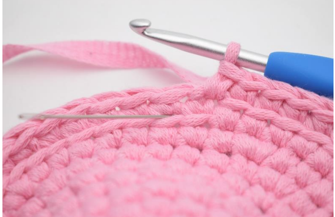
6. Work 1 long-sc in the next st. Skipping the previous row, insert hook in sc in the row below, as indicated by the needle.