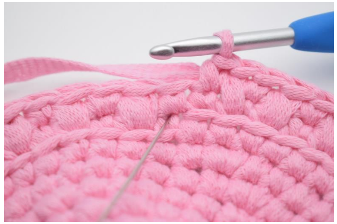
12. Now work 1 long-sc in the spot indicated by the needle.