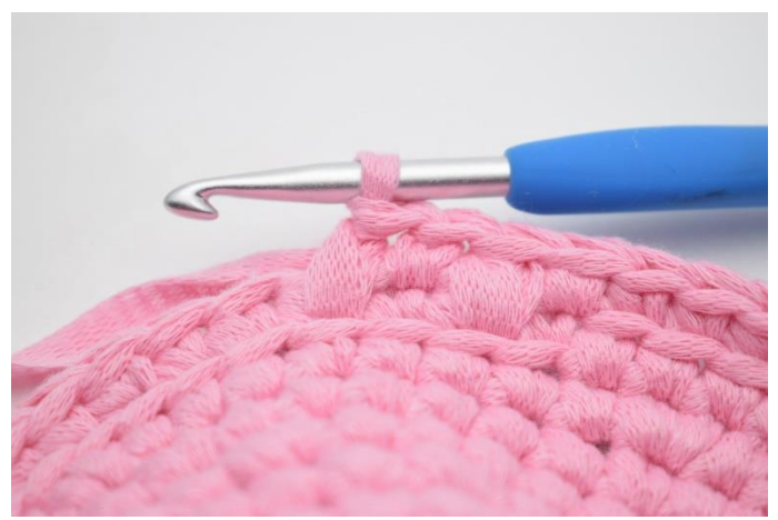
10. Like this.