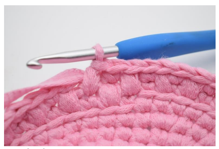
16. Like this.