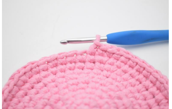
1. This is where the increases end.