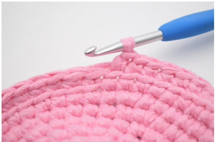
4. Work 1 sc in the BL of each st to the end of the rnd.