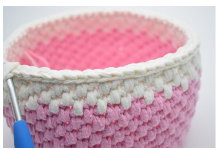
20. End with 1 rnd of sl st. Cut the yarn and weave in the ends.