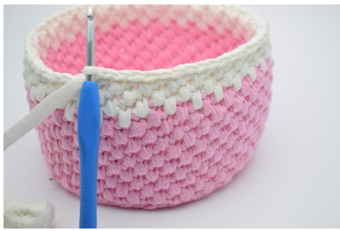
19. Continue following the pattern as described above.