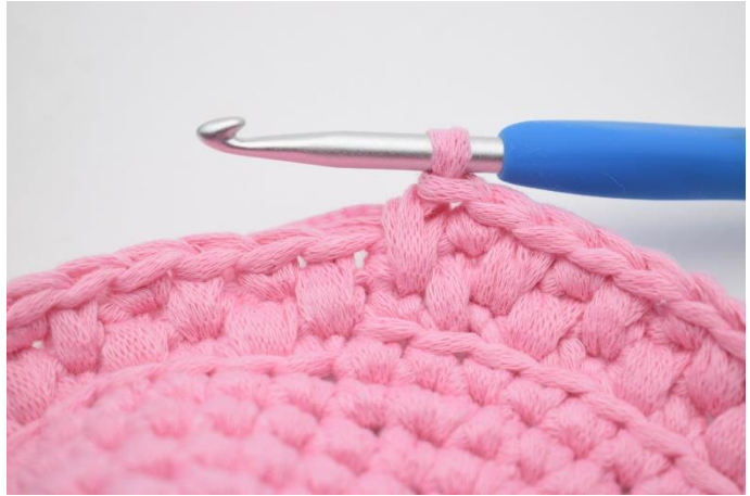
18. Continue alternating sc and long-sc to the end of the rnd. End with 1 long-sc.