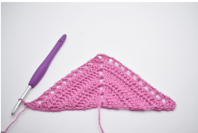
11. Like this.