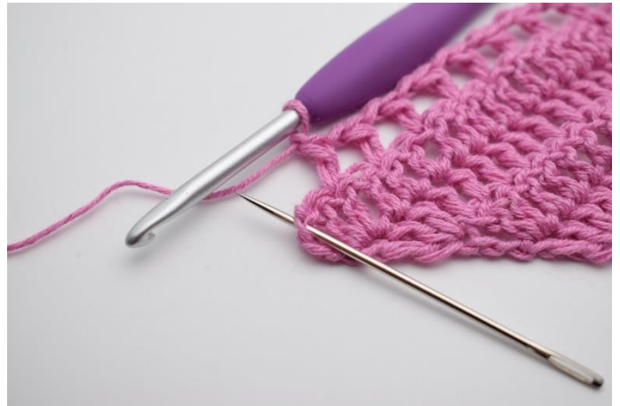
10. Ch 1, skip 1 st, 2 dc and 1 tr in the last st.