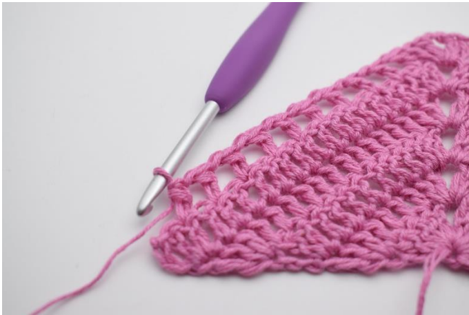
9. Repeat *-* a total of 9 times.