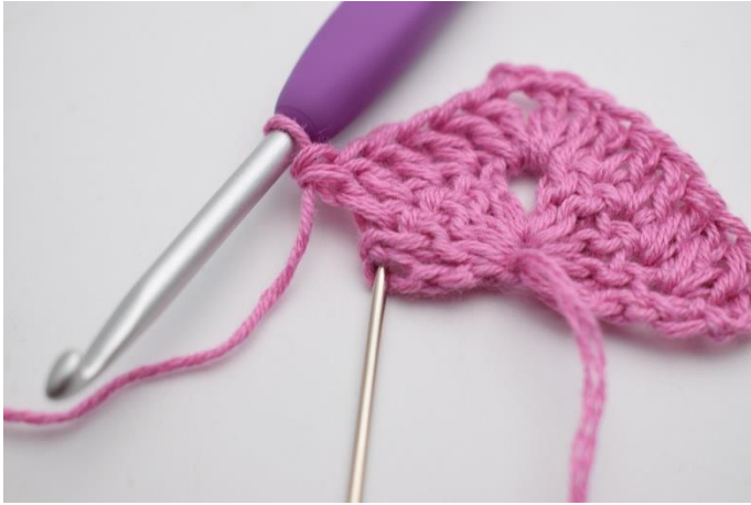
7. 2 dc and 1 tr in the last st.