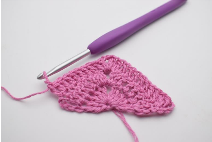
5. Work 1 dc in the next 8 sts.