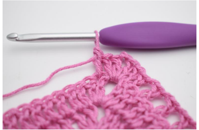
6. 1 dc in the next st.