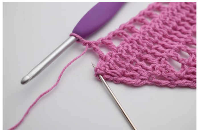
10. Ch 1, skip 1 st, 2 dc and 1 tr in the last st.