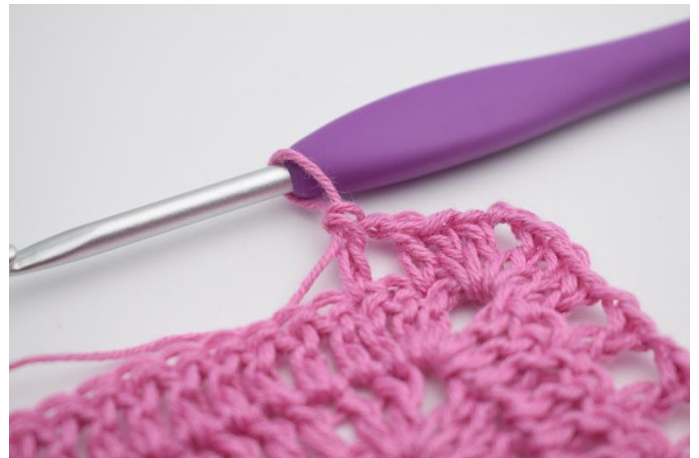
8. Like this.