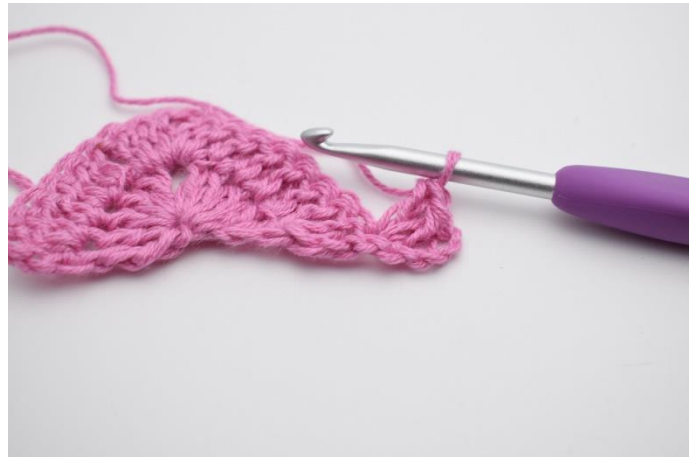
2. Like this.