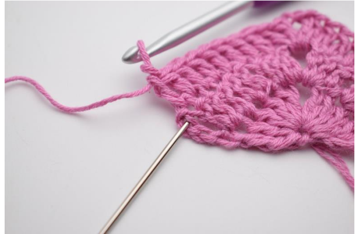
6. 2 dc and 1 tr in the last st.