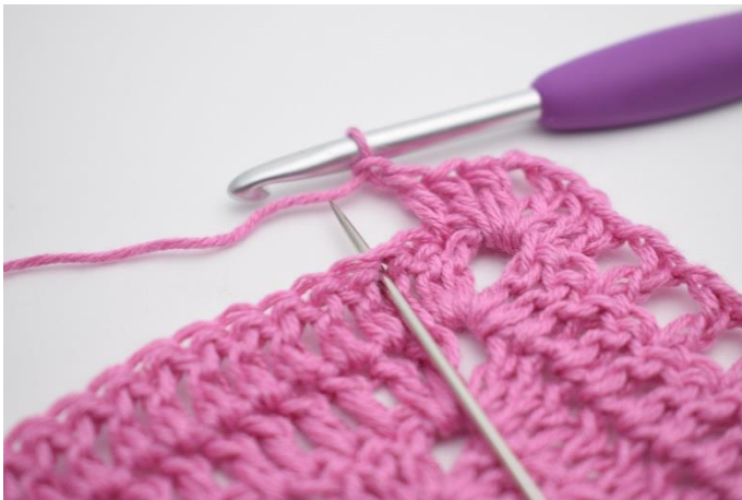
7. *Ch 1, skip 1 st, dc in the next st.*