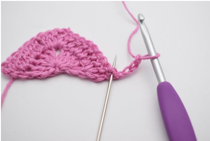
1. Ch 4 and turn. 2 dc in the first st. (The needle shows the first st)