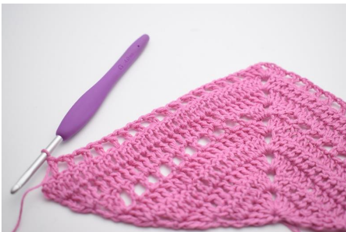
9. Repeat *-* a total of 15 times.