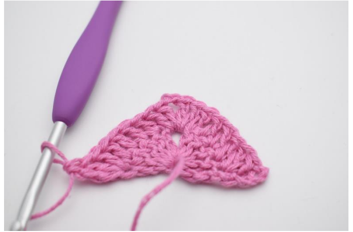
8. Like this.