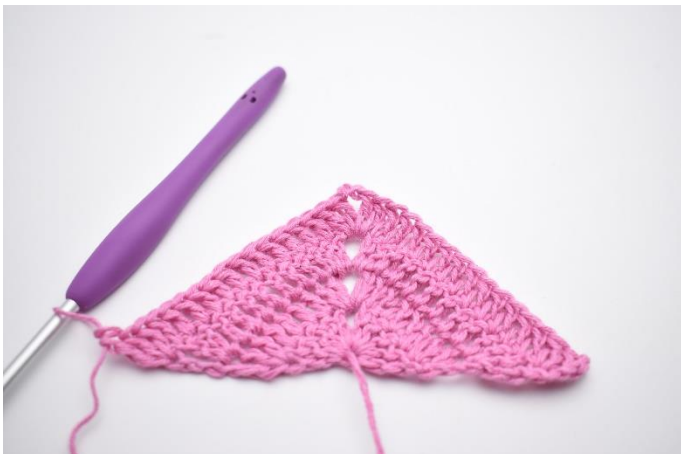
1. Ch 4 and turn. 2dc in the first st. 1 dc in the next 12 sts. (2dc, ch2, 2 dc )in the ch-space. 1 dc in the next 12 sts. 2 dc and 1 tr in the last st.