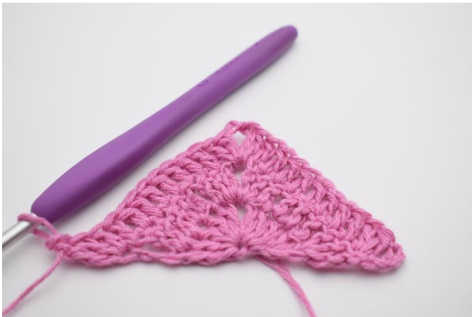
7. Like this.