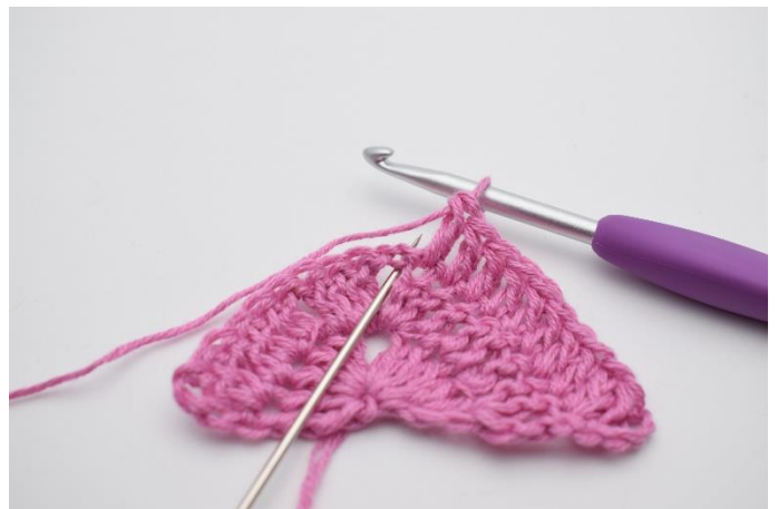
4. (2dc, ch2, 2 dc) in the ch-space.