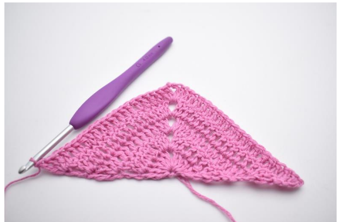
1. Ch 4 and turn. 2dc in the first st. 1 dc in the next 16 sts. (2dc, ch2, 2 dc )in the ch-space. 1 dc in the next 16 sts. 2 dc and 1 tr in the last st.