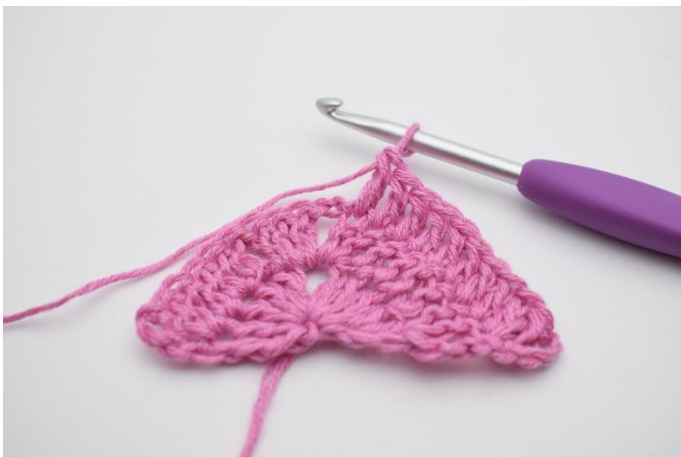
3. Work 1 dc in the next 8 sts.