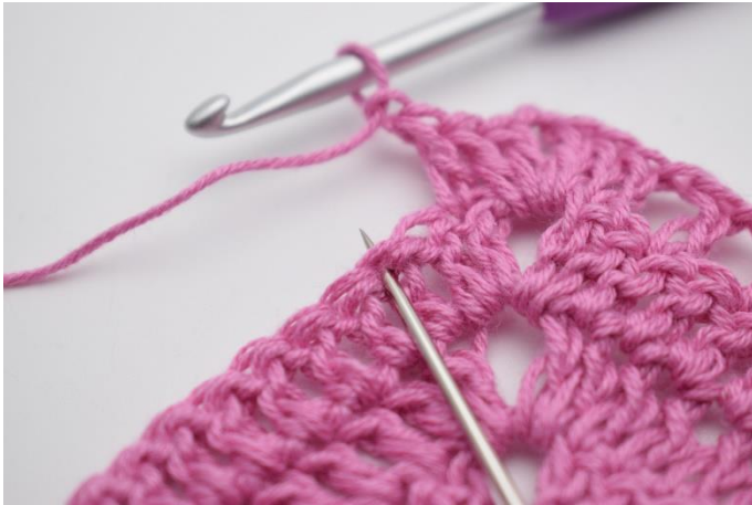
7. *Ch 1, skip 1 st, dc in the next st.*