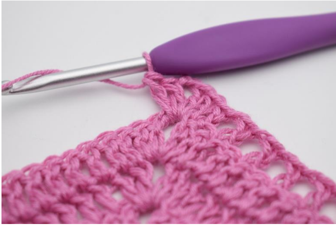
5. (2dc, ch2, 2 dc) in the ch-space.