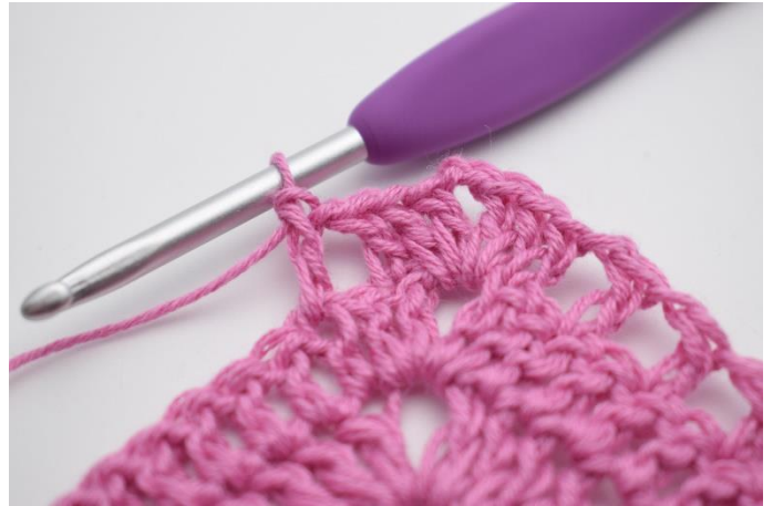
8. Like this.