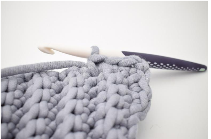
4. Sc along all edges, catching both pieces.

3. In the corners, work 1 sc, 1 ch, 1 sc in the same st.