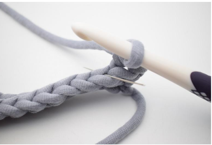
4. Work 1 sc tbl in the next st. The needle shows where to work your sts.