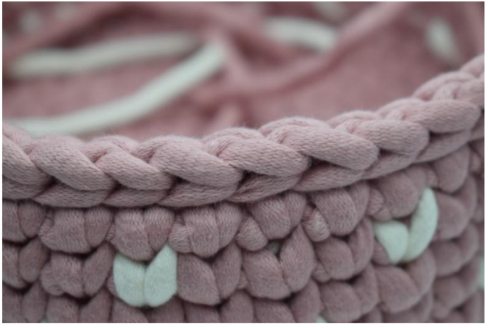
22. Work 1 round of ss. Cut the yarn and weave in the ends.