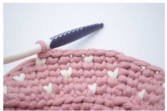
19. Ch 1. Work 1 ks in the first 2 s with color 1. Next ks is worked with color 2. "Work 1 ks in the last 2 s with color 1, next ks is worked with color 2".