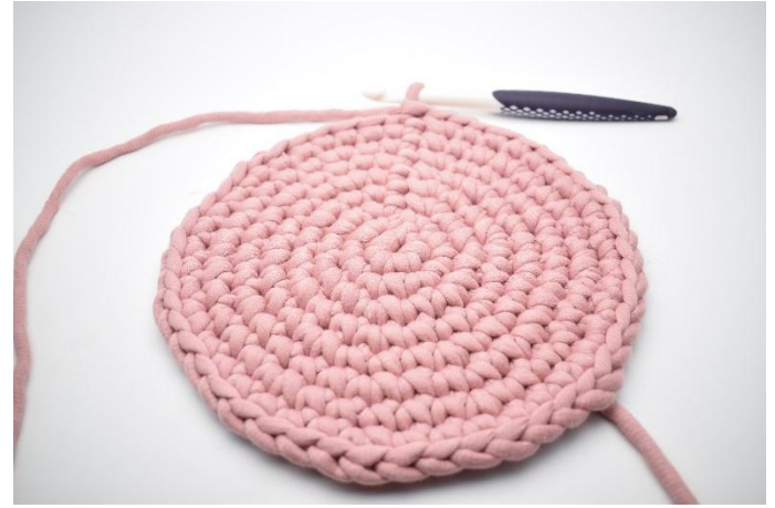
1. Here is your just finished base finished with 1 ss.