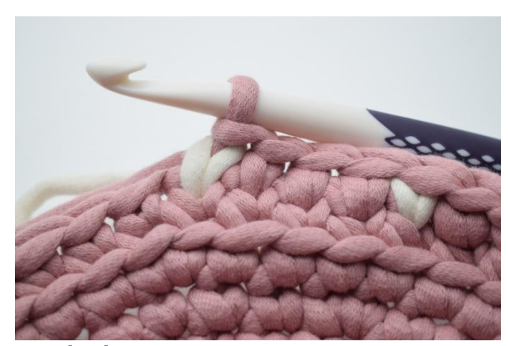
13. Like this.