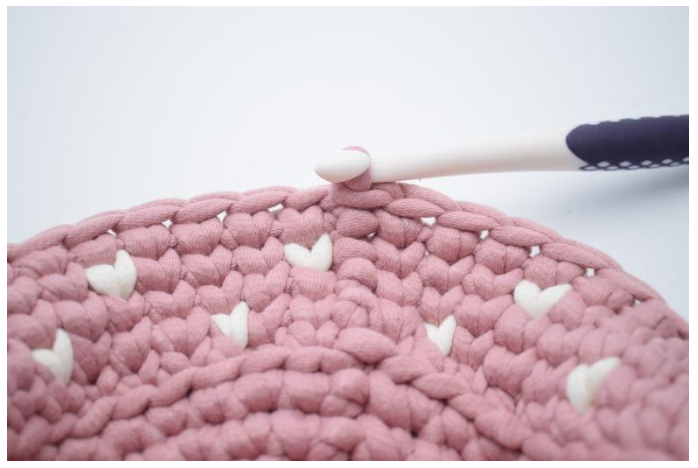
18. Ch 1. Work 1 round of ks with color 1. Finish with 1 ss.