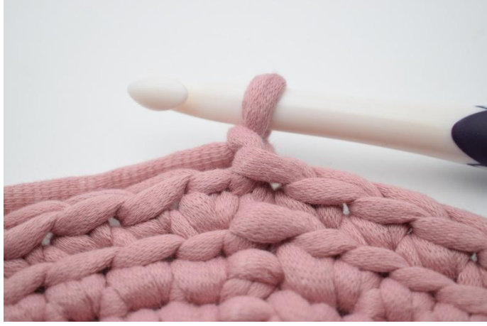
1. Ch 1.