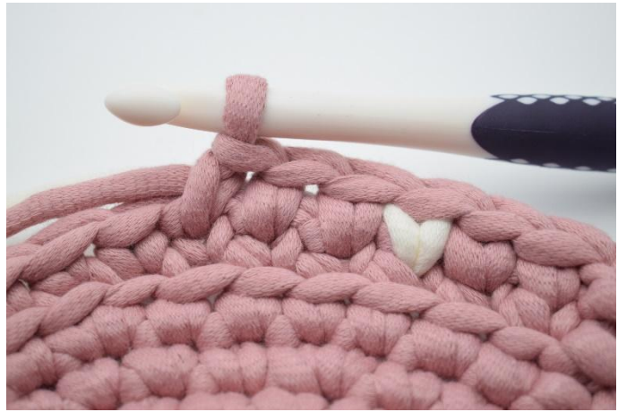
11. Work 1 ks w color 1 in the next 3 s.