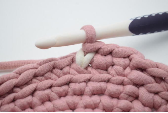
10. Like this.