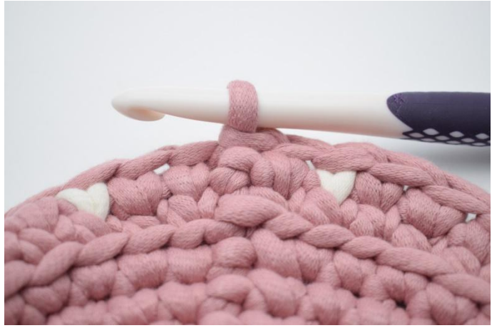
14. Repeat "work 1 ks in the next 3 s with color 1, 1 ks in the next s with color 2" around. Finish with 1 ss.