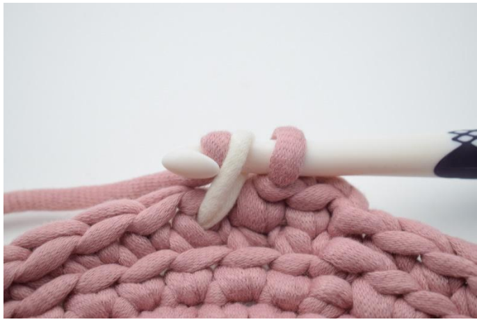
Yarn over w color 1 and pull through both loops.