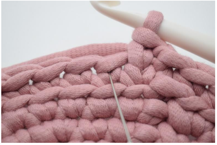
4. Work 1 ks in the next s. The sewing needle marks where your sc should be worked in order for it to become a ks.