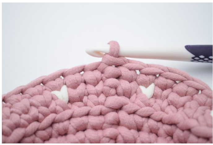
15. Ch 1. Work 1 round of ks with color 1. Finish with 1 ss.