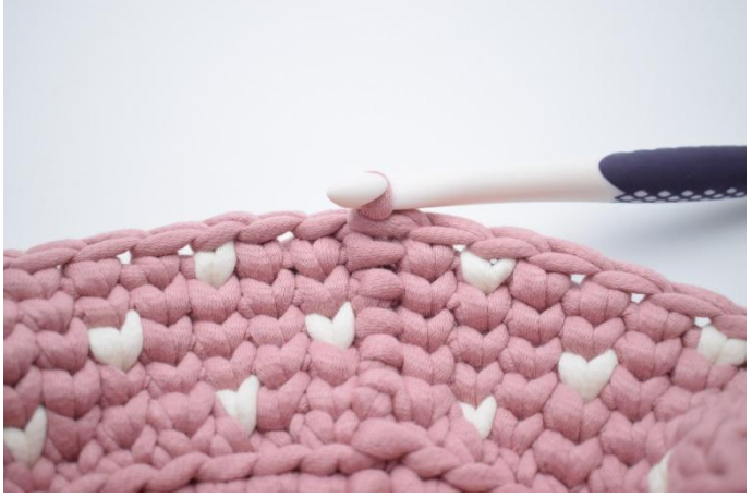
20. Repeat from "to" around. Work 1 ks in the last s with color 1. Finish with 1 ss. (36)