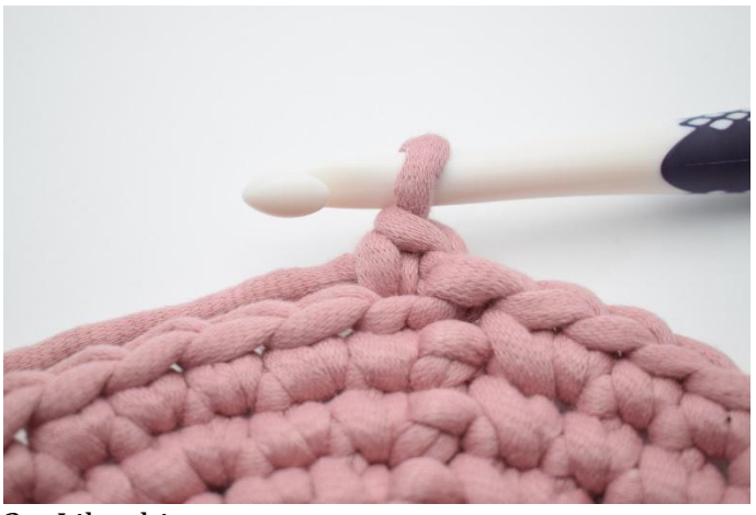
3. Like this.