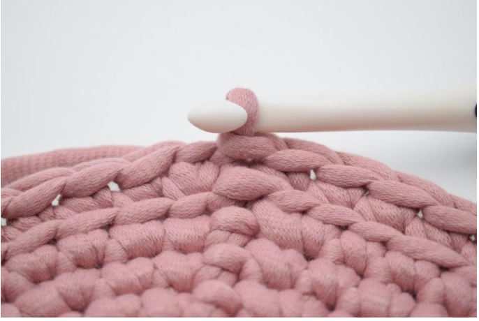
4. Repeat with sc in blo around and finish with 1 ss.