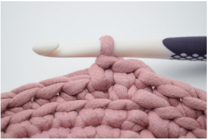
5. Like this.