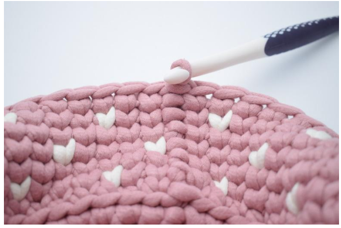
21. Ch 1. Work 1 round of ks with color 1. Finish with 1 ss.