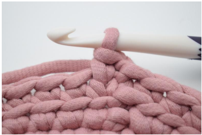
3. Like this. Now, you have worked 1 ks.