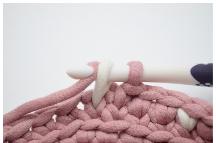
12. Work 1 ks with color 2 in the next s. Yarn over with color 1 and pull the yarn through.