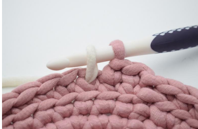
8. Pull the yarn back through the s.