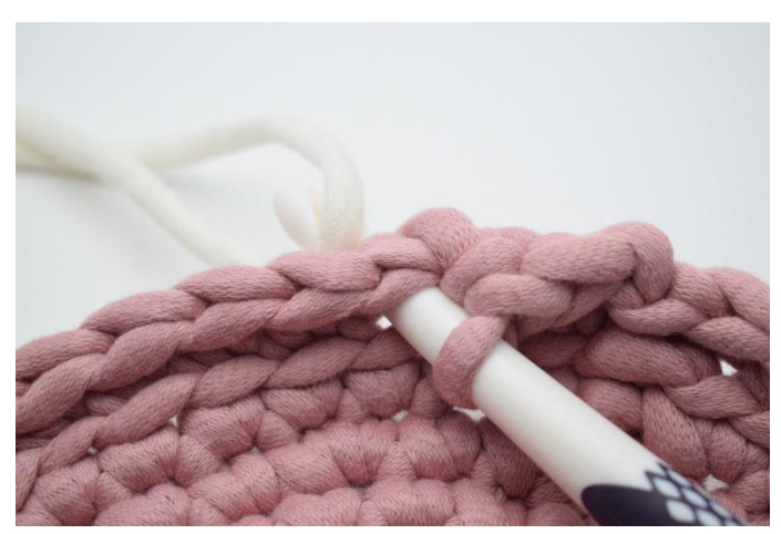
7. Yarn over with color 2.