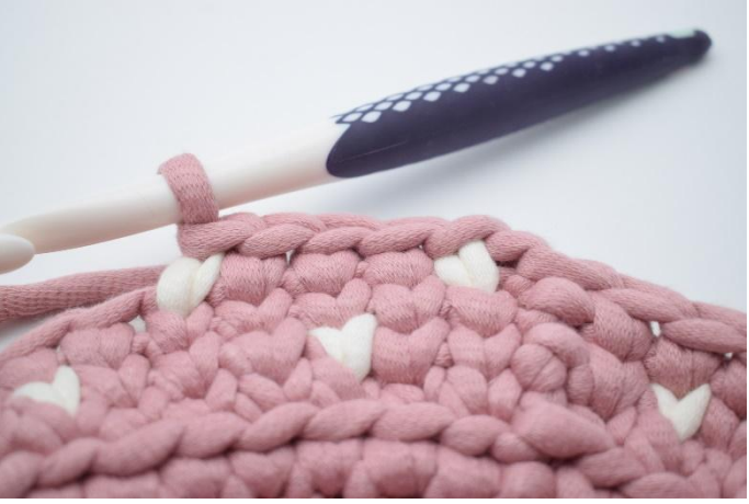
16. Ch 1. Work 1 ks in the first s with color 2. "Work 1 ks in the next 3 s with color 1, 1 ks in the next s with color 2".