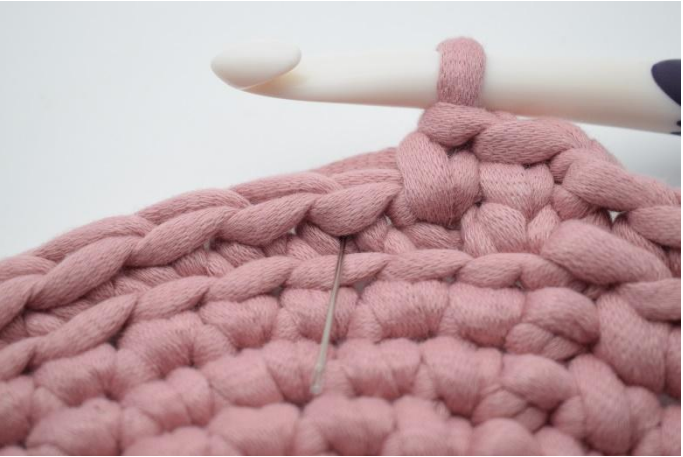
6. Next s is worked with color 2. Insert the crochet hook in the s. The sewing needle here marks where your ks should be worked.