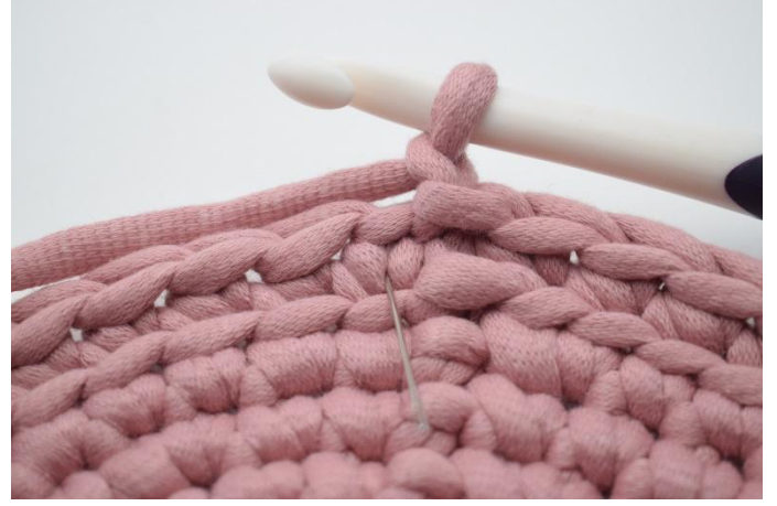
2. Now, you are going to make a knit stitch (ks). Ks is a normal sc, but instead of working it as you normally would, you work it in the "v" of the stitch. The sewing needle here marks where you should work your sc in order for it to become a ks