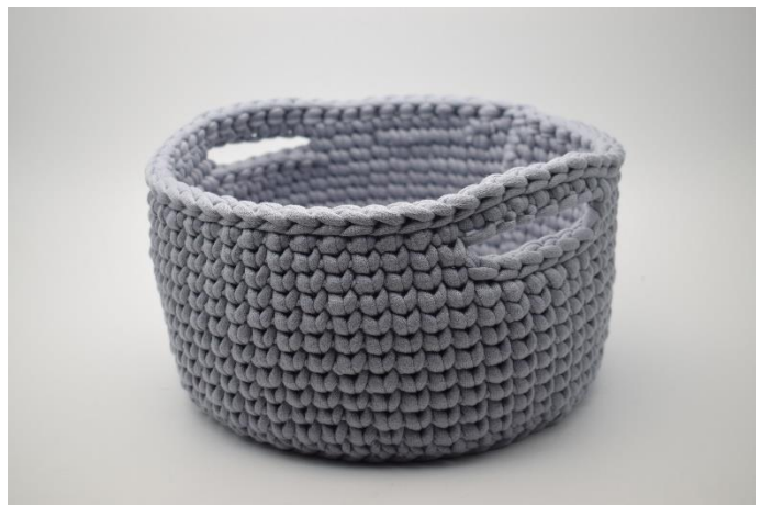
2. Cut the yarn and weave in ends.