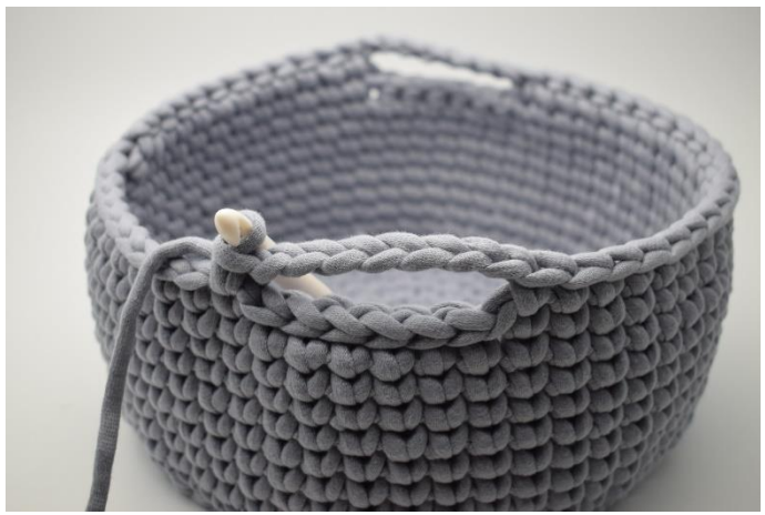
5. Ch 7 and skip the 6 sl st from previous round. 6. Like this.