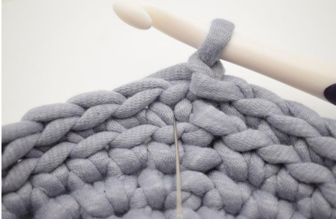
2. Now you work the ks. A ks is worked as an ordinary sc, but instead of working in the normal way you work it in the "v" on the stitch. The needle on the photo shows where you work the sc to create a ks.