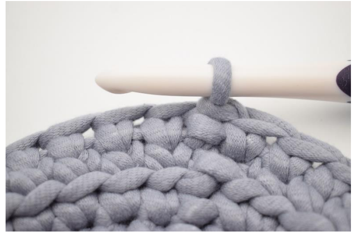
6. Repeat working 1 ks in every st on entire round and finish with 1 sl st.