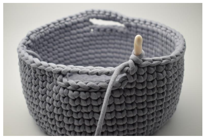
3. Work 1 ks in each of the next 21 st.