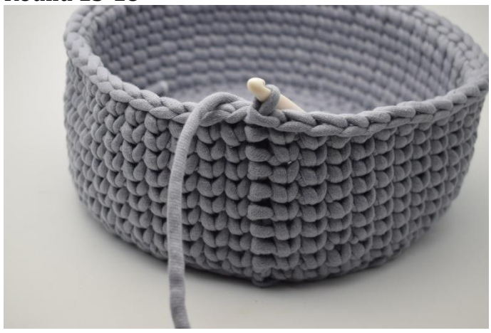
1. Repeat working the ks round until have worked a total of 8 rounds.