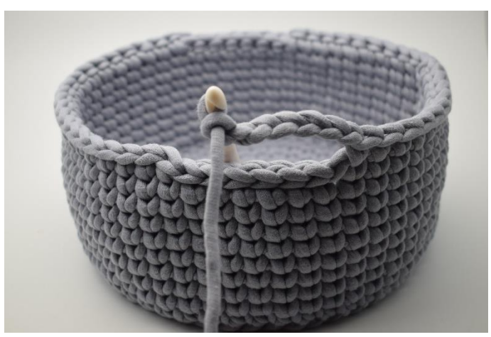
2. Ch 7 and skip the 6 sl st from previous round.