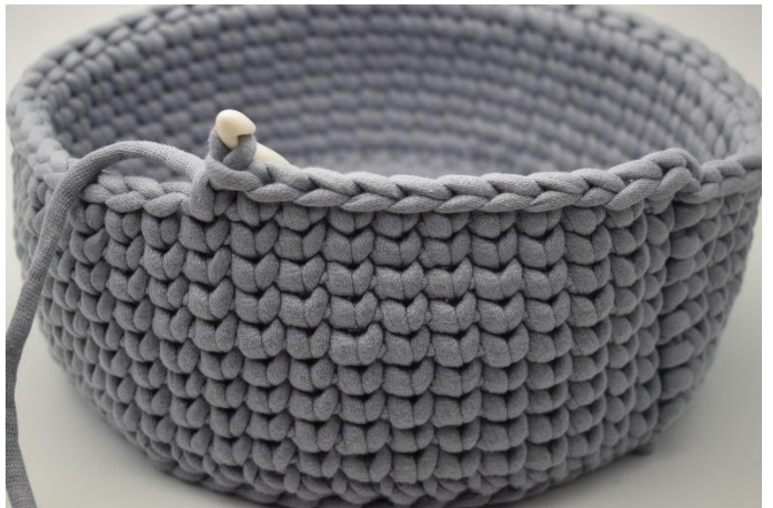
1. Ch 1 and work 1 ks in each of the first 11 st.