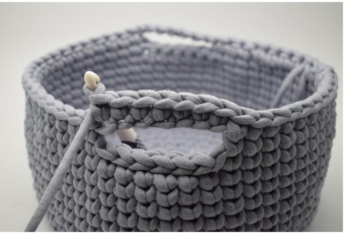
2. Work 1 sc in each of the 7 ch st from previous round.