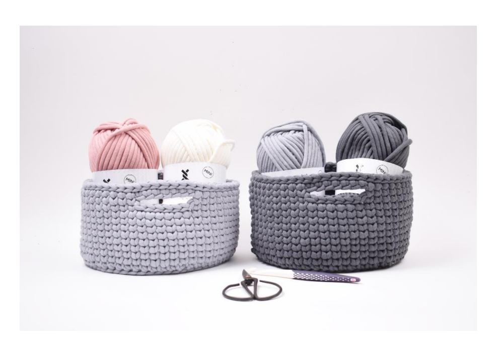
Enjoy ☺ Love from Hobbii