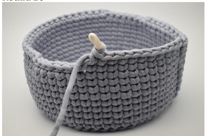
1. Ch 1. Work 1 ks in each of the first 11 st.