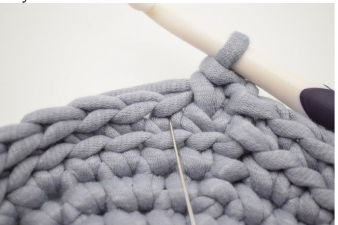
4. Work 1 ks in next st. The needle on the photo shows where to work you sc to create a ks.