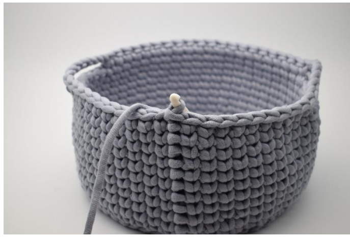
7. Work 1 ks in each of the last 10 st.