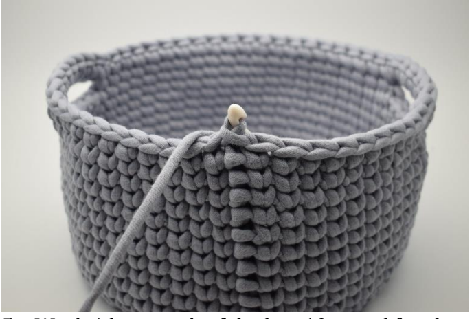
5. Work 1 ks in each of the last 10 st and finish with 1 sl st.