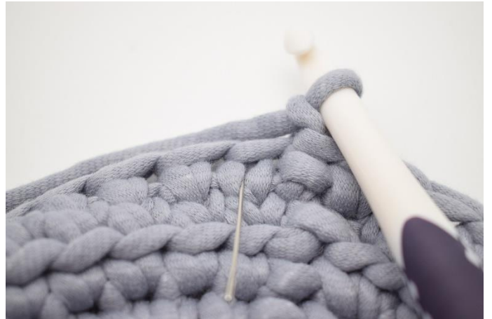
Ch 1 and work this round as round 8. Work 1 2. Like this. You have now worked 1 ks. ks in next st. The needle on the photo shows where to work your ks.