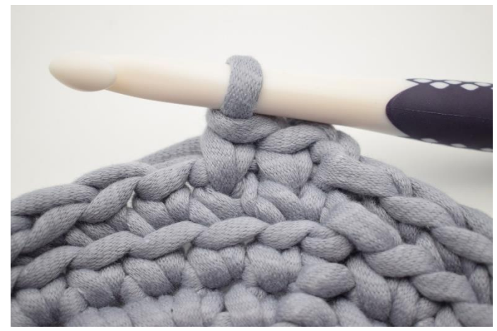
5. Like this.