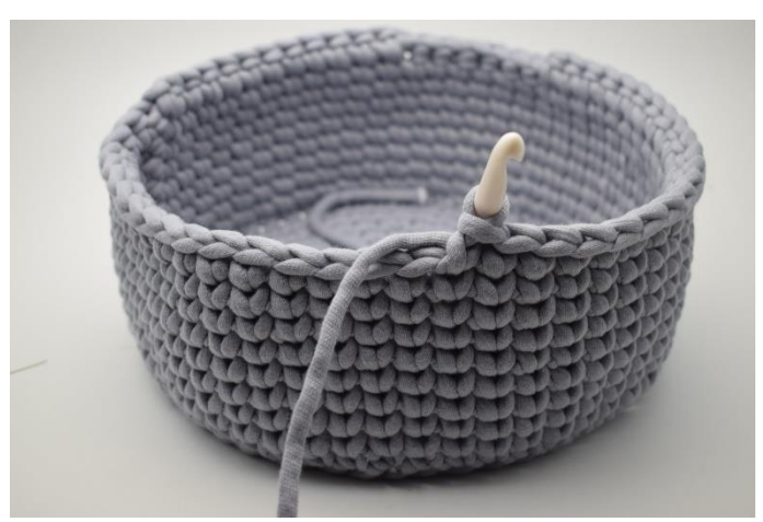
4. Work 1 ks in each of the next 21 st.