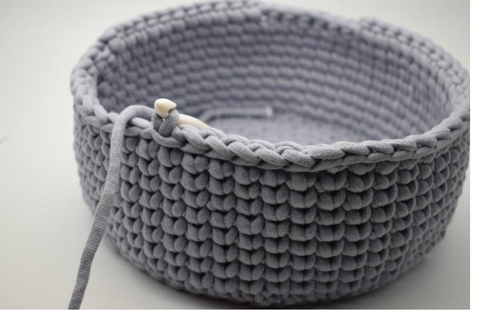
6. Like this.