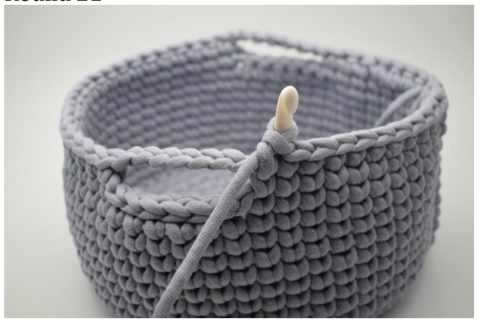
1. Ch 1 and work 1 ks in each of the first 11 st.