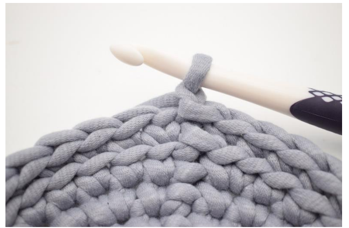
1. Ch 1.