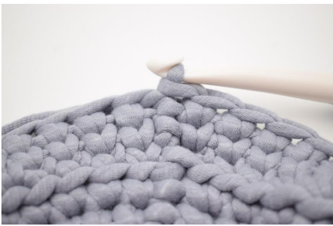
Repeat working 1 ks in every st on entire round and finish with 1 sl st.