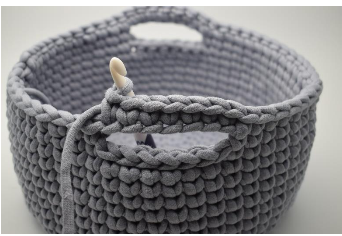
4. Work 1 sc in each of the 7 ch st from previous round.