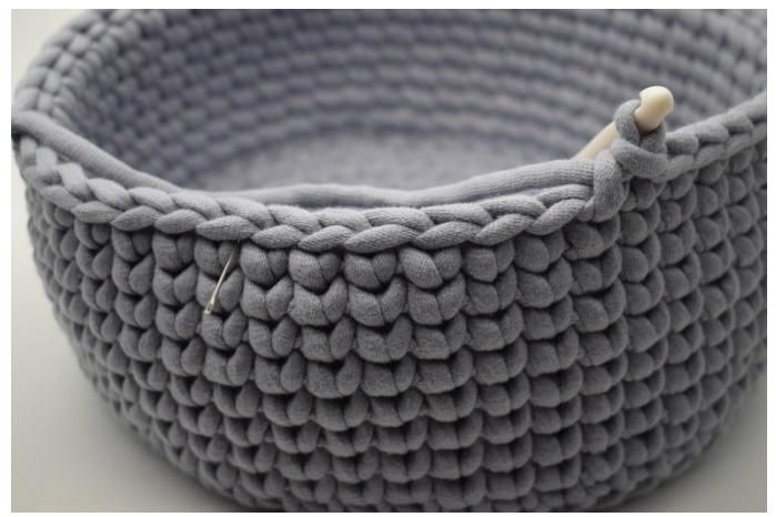
2. Now work 1 sl st in each of the next 6 st, where you would normally work ks. Work a total of 7 sl st.