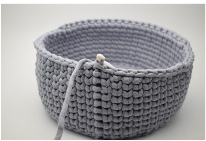
7. Work 1 ks in each of the last 10 st and finish with 1 sl st.