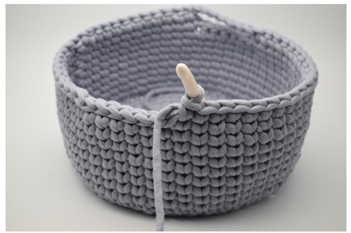
4. Work 1 ks in each of the next 21 st.