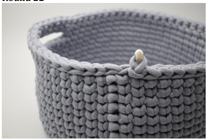
1. Work 1 sl st in every st on entire round.