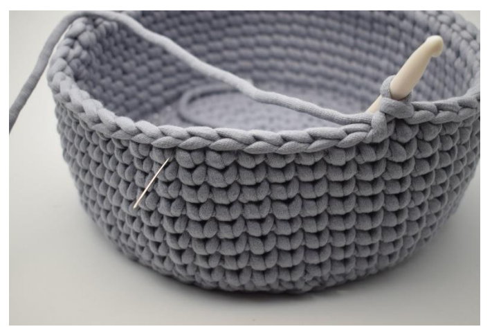
5. Now work 1 sl st in each of the next 6 st, where you would normally work ks. Work a total of 7 sl st.