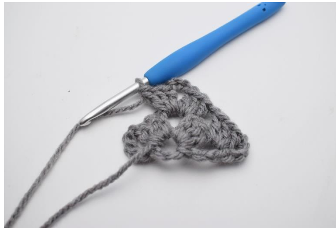
13. Crochet 1 dc cluster.