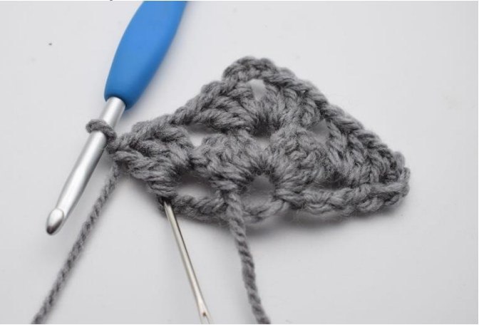
16. Ch 1. The needle now shows the 4<sup>th</sup> chain in the previous row.

14. Ch 1. The next cluster is made in the ch-space shown by the needle.