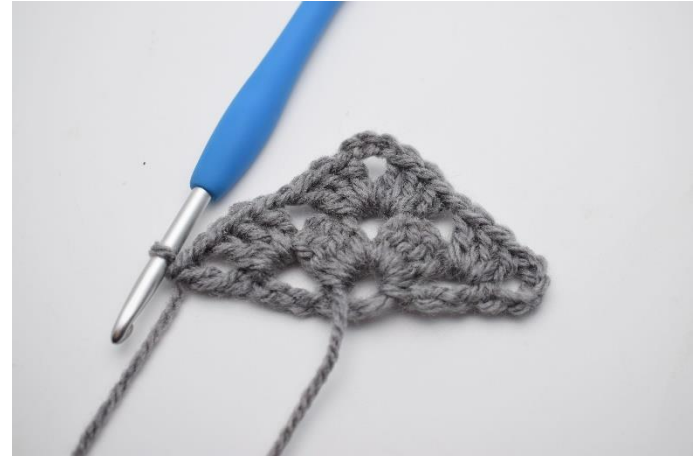
17. Crochet 1 tr in the 4<sup>th</sup> chain from the previous row.