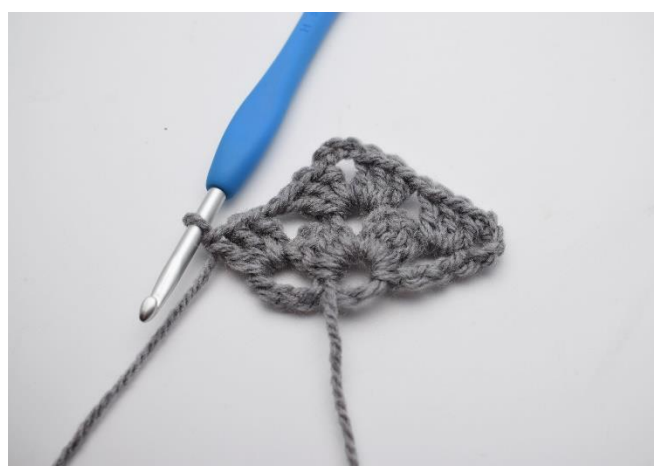
15. Crochet 1 dc cluster.