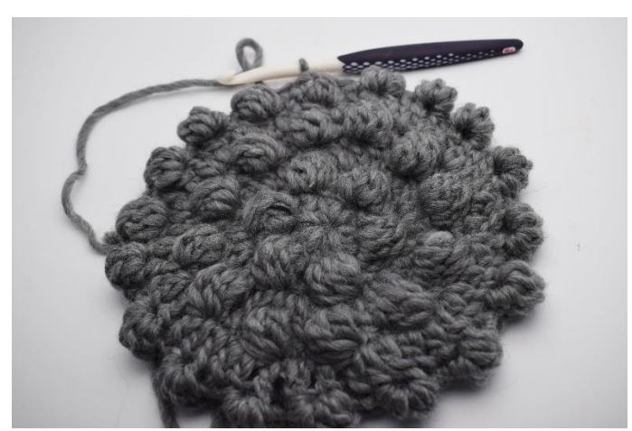
3. Work "1 sc in the next 2 sts, 1 BuSt in the next st" Repeat "-" to the end of the rnd. End with a sl st. (54) There are 18 BuSt on this rnd.