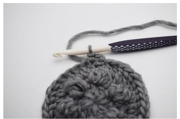
1. Ch 1. Work 1 sc in the next 2 sts.