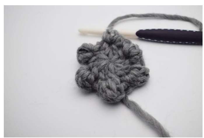
11. Work "2 sc in the next st, 1 BuSt in the s" Repeat "-" to the end of the rnd. End with a sl st (18) There are 6 BuSt in this rnd.