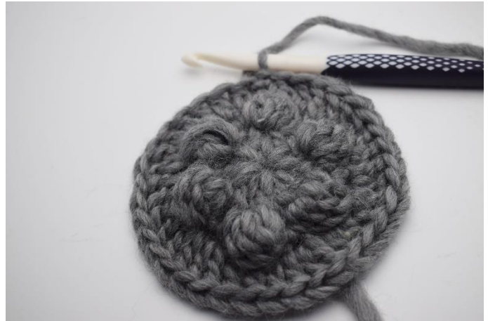
2. Work 2 dc in each st to the end of the rnd. End with a sl st. (36)