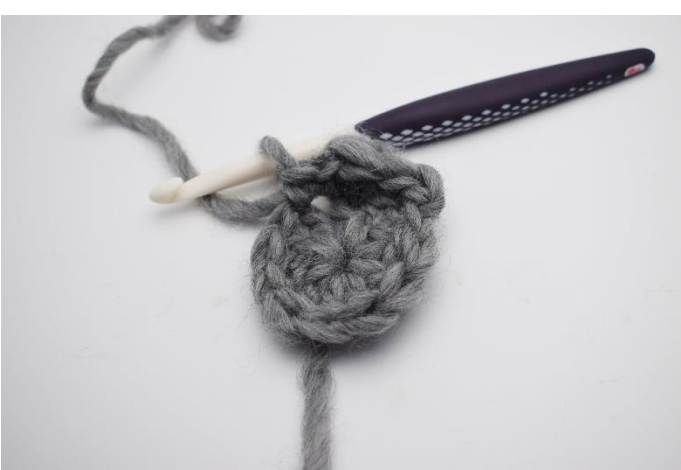
8. Work 2 sc in the next st.