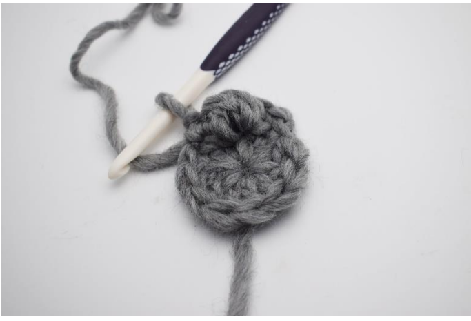
9. Push the BuSt through to the front side of the work.