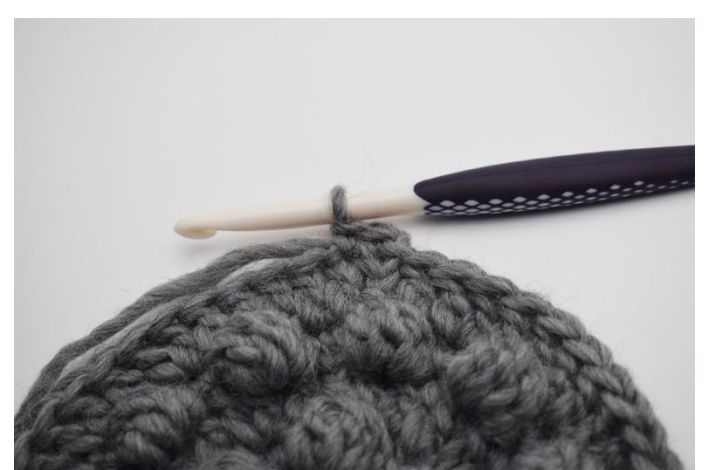
1. Ch 1. Work 1 sc in the next 2 sts.