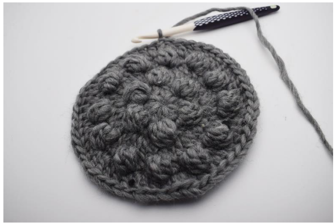
2. Work "2 dc in the next st, 1 dc in the next st" Repeat "-" to the end of the rnd. End with a sl st. (54)