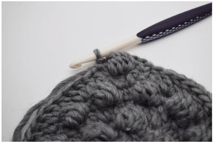
2. Work 1 BoSt in the next st.