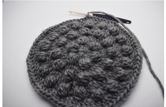
2. Work "2 dc in the next st, 1 dc in the next 2 sts" Repeat "-" to the end of the rnd. End with a sl st. (72)