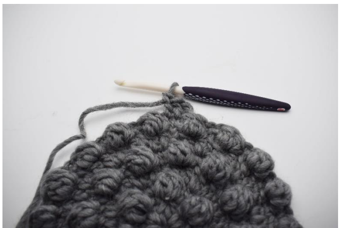
1. Ch 3 (counts as 1 dc). Work 1 dc in the same st. Work 1 dc in the next 2 sts.