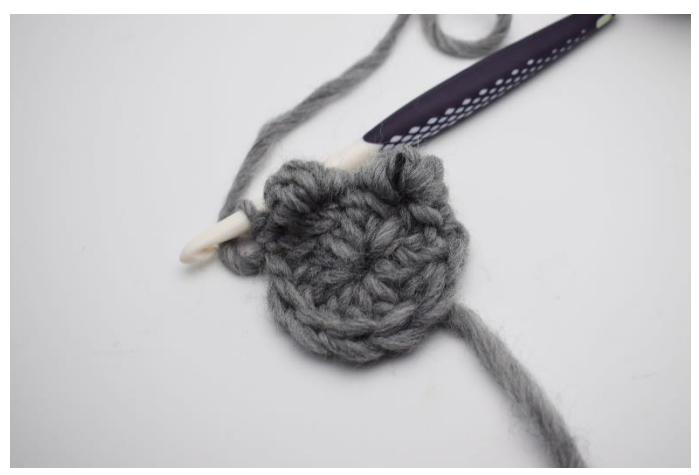
10. Work 1 BuSt in the next st.