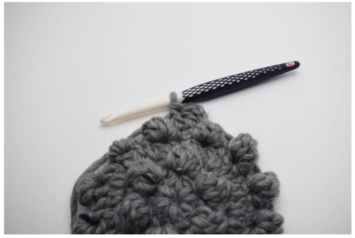
1. Ch 3 (counts as 1 dc). Work 1 dc in the same st. Work 1 dc in the next st.