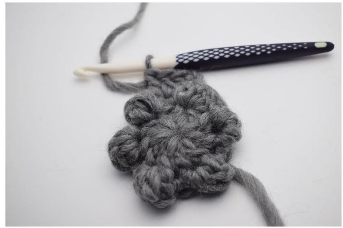
1. Ch 3 (counts as 1 dc). Work 1 dc in the same st. Work 2 dc in the next st.