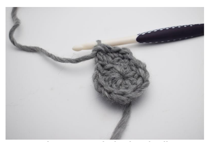
7. Wrap the yarn over the hook and pull through all 6 loops. Pull to tighten a little. Your BuSt is now on the back side of the work.