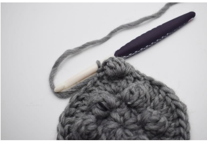
2. Work 1 BuSt in the next st.