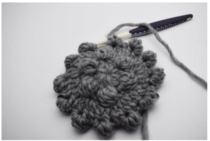
3. Work "1 sc in the next 2 sts, 1 BuSt in the next st" Repeat "-" to the end of the rnd. End with a sl st. (36) There are 12 BuSt in this rnd.