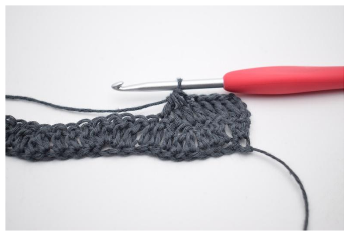
3. Work 3 dc tog over the next 3 stitches.