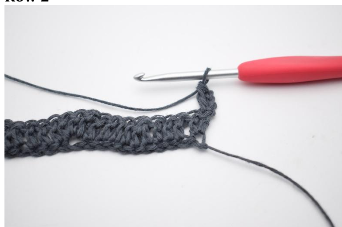
1. Turn by chaining 3. Work 1 dc in the first stitch.