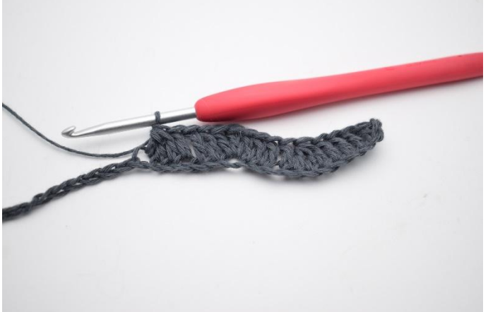
8. Work 3 dc tog over the next 3 ch stitches*.