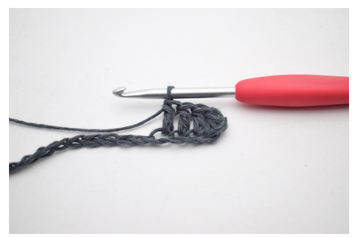
3. Work 1 dc in the next 3 ch stitches.