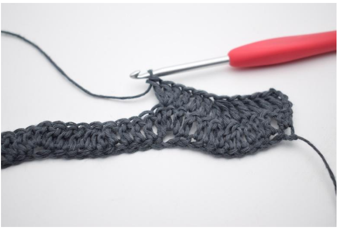
5. Work 3 dc in the next stitch