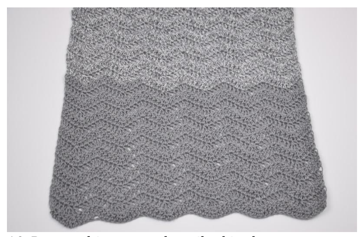
10. Repeat this row as described in the pattern.