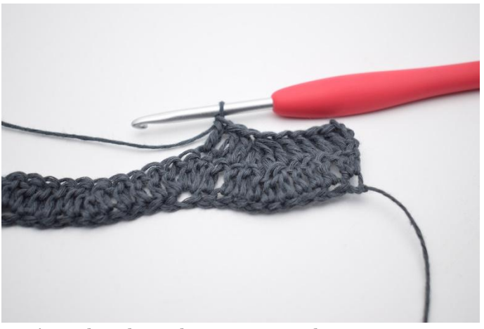
4. *Work 1 dc in the next 3 stitches.