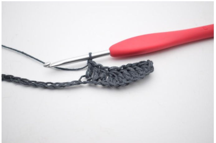
5. *Work 1 dc in the next 3 ch stitches.