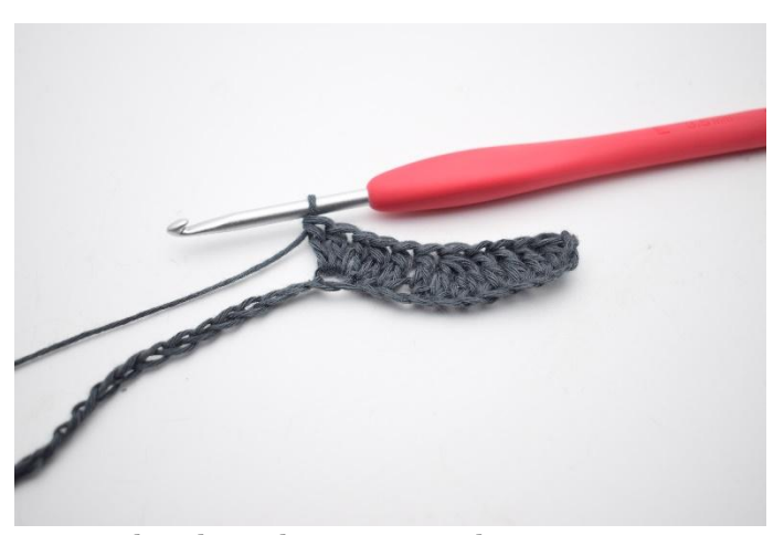
6. Work 3 dc in the same stitch.