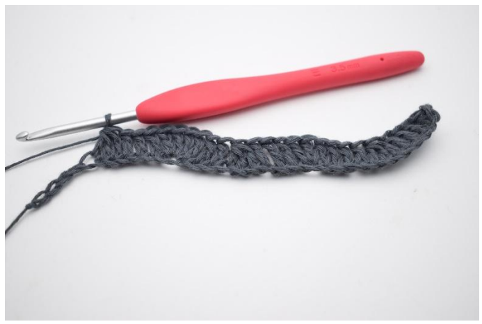
9. Repeat from *-* as described in the pattern.