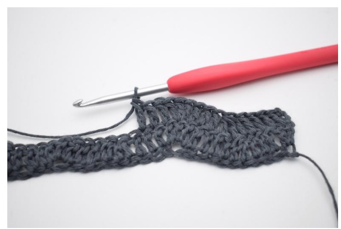
6. Work 1 dc in the next 3 stitches.