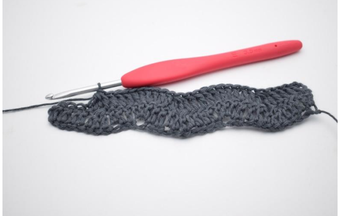
8. Repeat from *-* as described in the pattern.