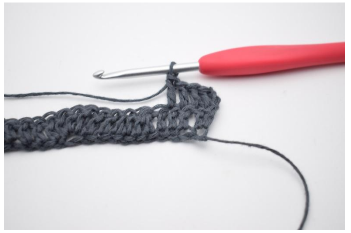
2. Work 1 dc in the next 3 stitches.