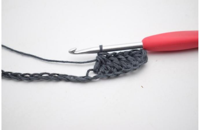
4. Work 3 dc tog over the next 3 ch stitches