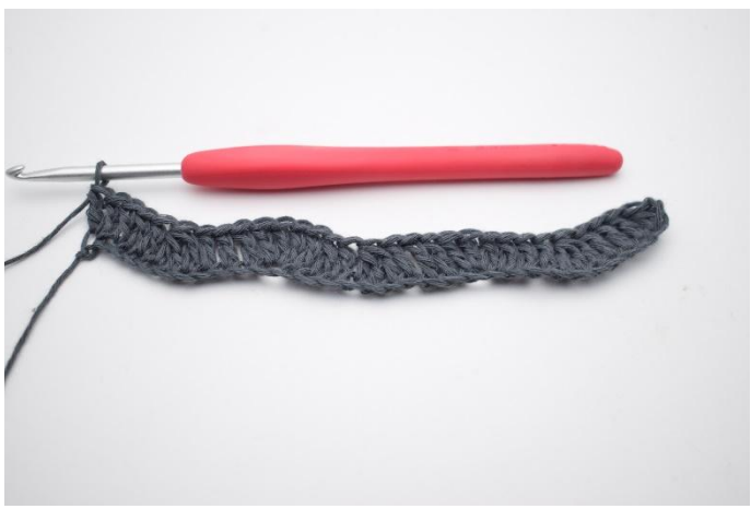
11. In the last stitch work 2 dc.