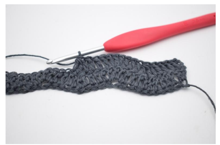
7. Work 3 dc tog over the next 3 stitches*.