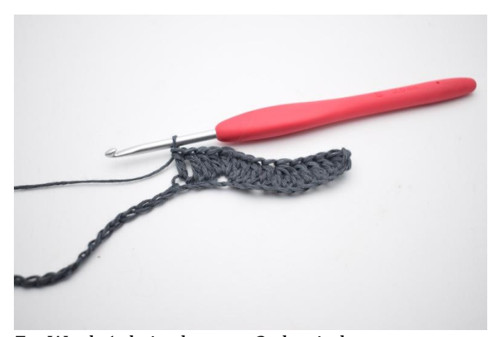
7. Work 1 dc in the next 3 ch stitches