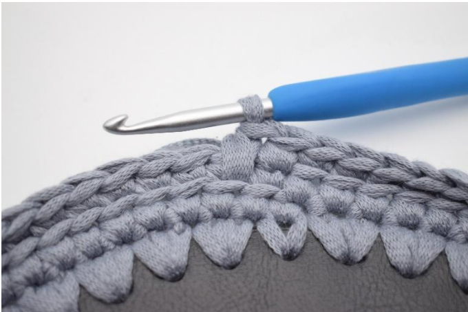
9. Like this. Now, you have worked 1 sc and 1 lsc.