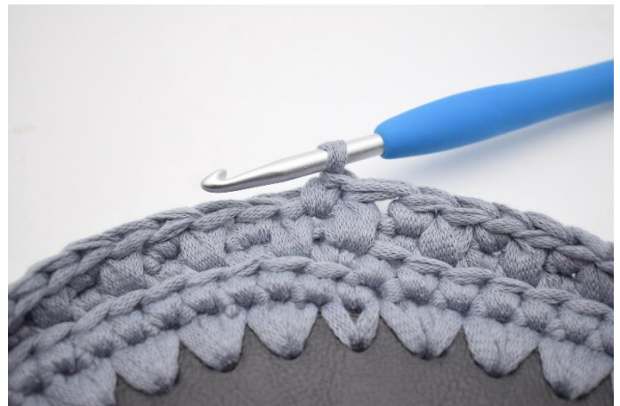
16. Work 1 sc in the next st.