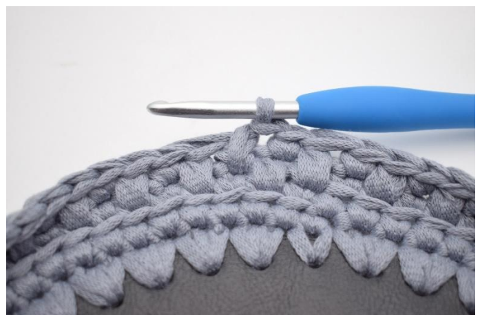
18. Like this.