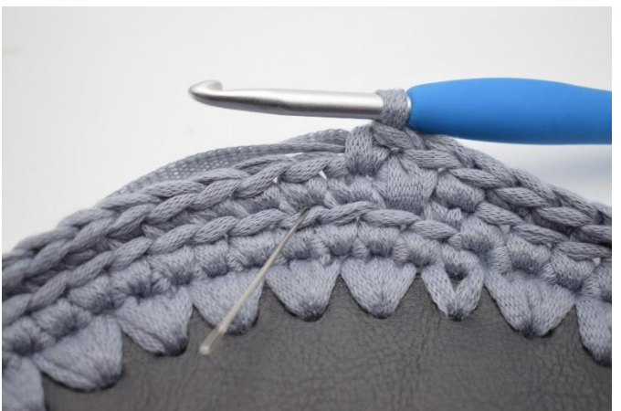
11. Work 1 lsc in the next st. The needæ marks where your lsc should be worked.