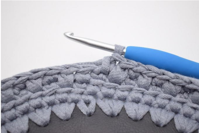
13. Repeat the round of alternating between sc and lsc. Finish the round with 1 sc.