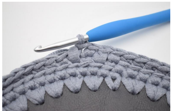
12. Like this.