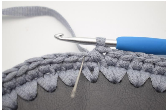
4. Now, work sc in blo. The needle marks where your sc should be worked.