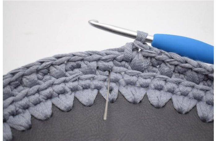
14. Now, alternate between lsc and sc. Work 1 lsc in the next st. The needle marks where your lsc should be worked.