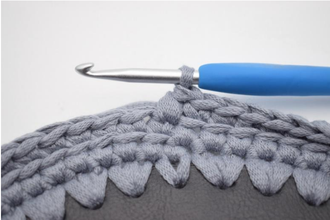
7. Now, alternate between sc and lsc. Start with a sc.