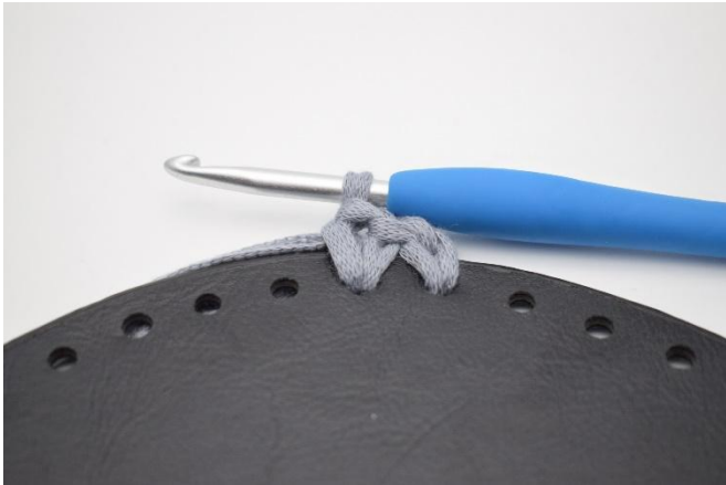
1. Work sc in each hole of the base as described in the pattern.