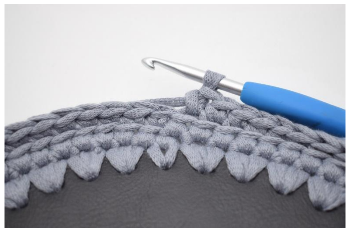
6. Repeat the round of sc in blo.