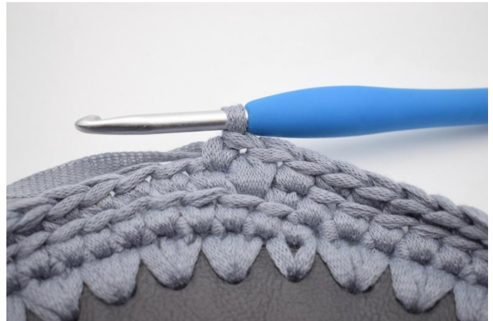
10. Work 1 sc in the next st