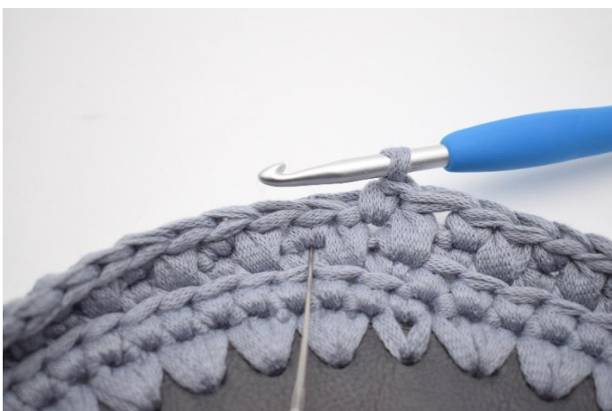
17. Work 1 lsc in the next st. The needle marks where your lsc should be worked.