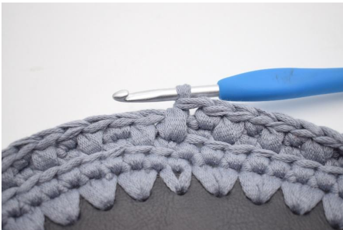
15. Like this.