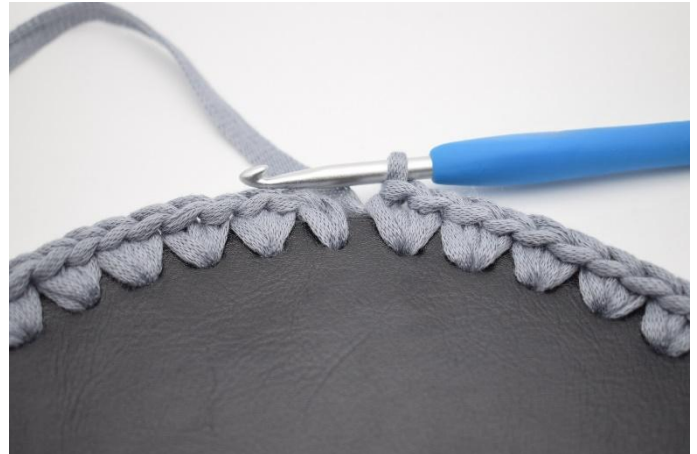
2. Like this.