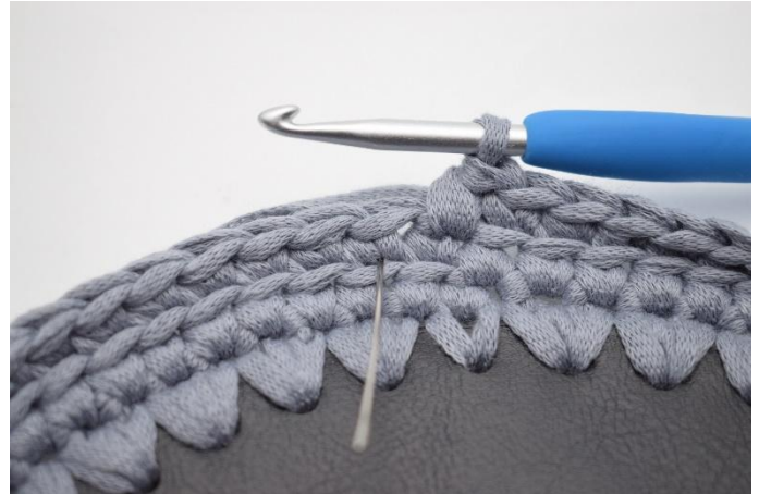
8. Work 1 lsc in the next st. The needle marks where your lsc should be worked.