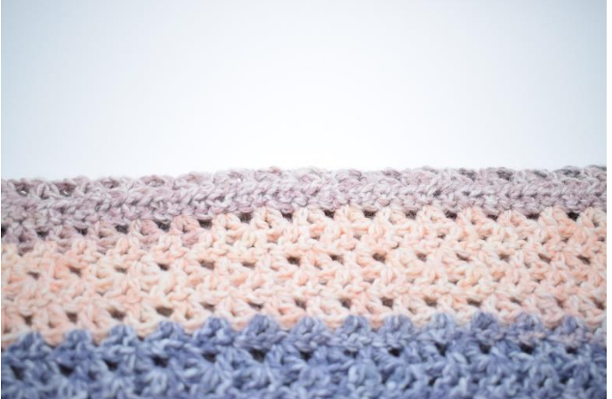
2. Lay the ends together and sew them together using a mattress stitch.

1. When your work is the desired length you will sew the ends together to form a tube.