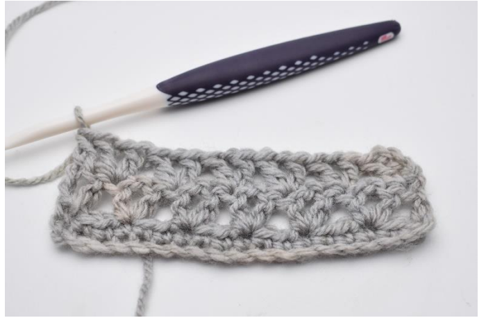
10. work 1 dc.

9. In the 3rd ch of the turning ch- where the needle is pointing