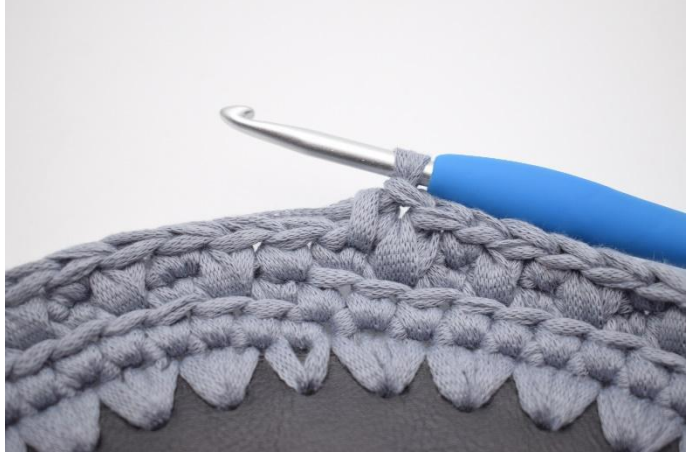
13. Repeat the round of alternating between sc and lsc. Finish the round with 1 sc.