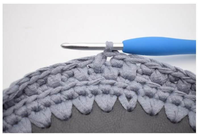
18. Like this.