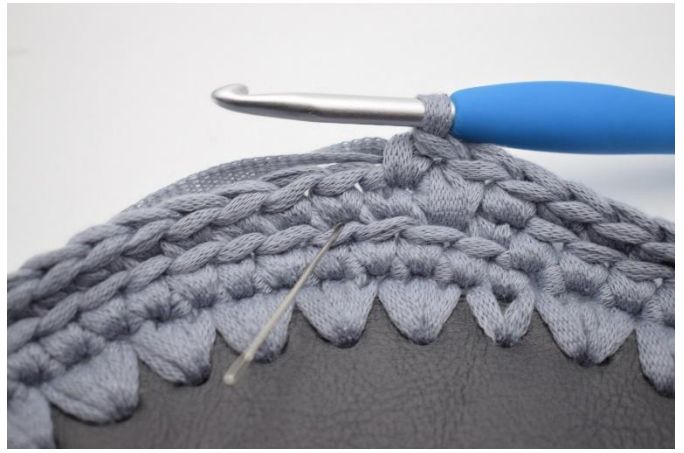
11. Work 1 lsc in the next st. The needæe marks where your lsc should be worked.