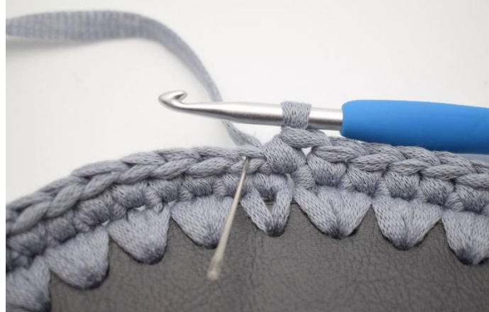
4. Now, work sc in blo. The needle marks where your sc should be worked.