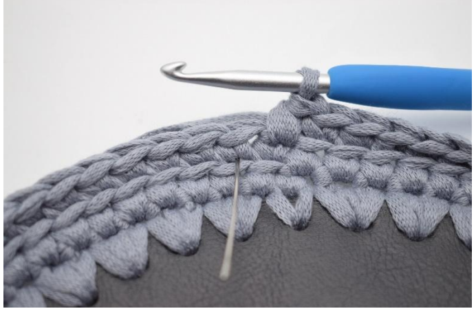
8. Work 1 lsc in the next st. The needle marks where your lsc should be worked.