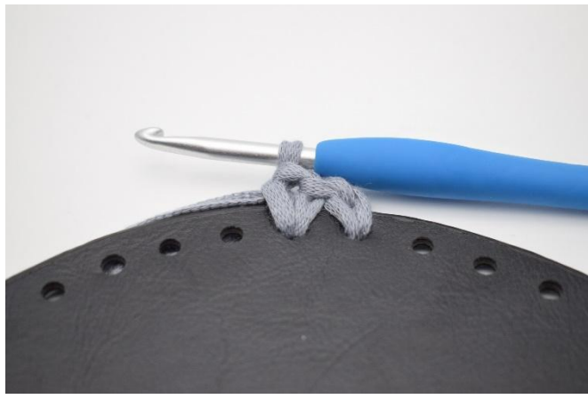
1. Work sc in each hole of the base as described in the pattern.