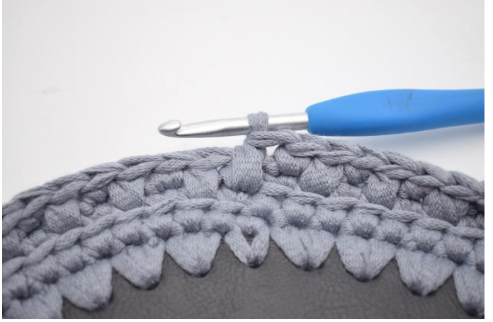
15. Like this.