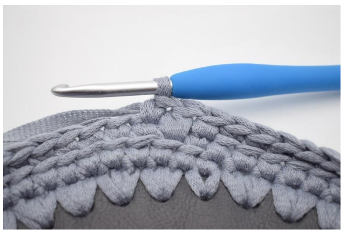
10. Work 1 sc in the next st