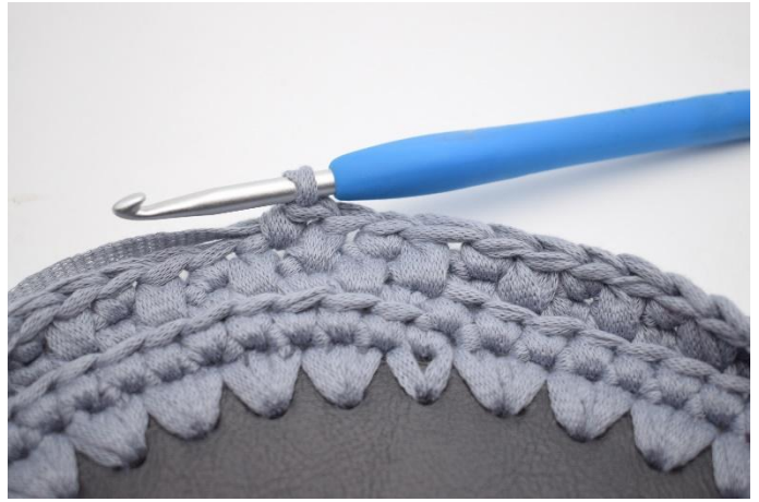
19. Work 1 sc in the next st.