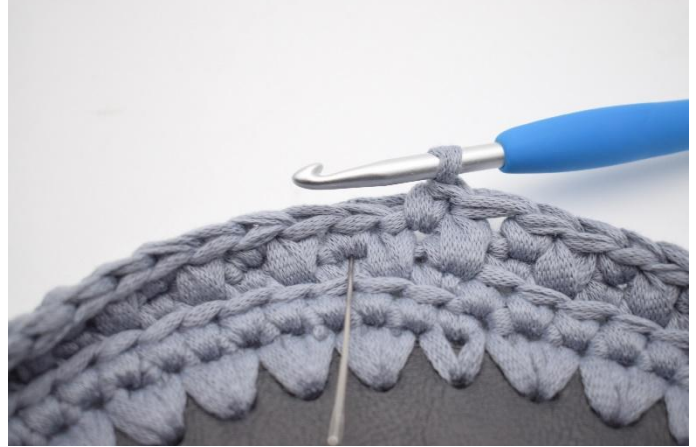
17. Work 1 lsc in the next st. The needle marks where your lsc should be worked.