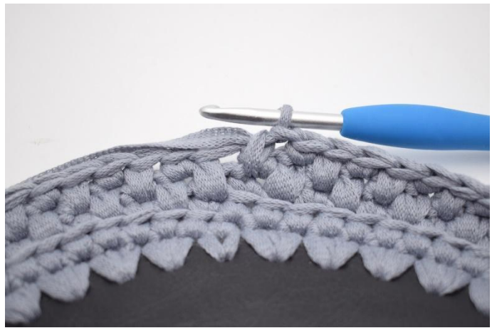
20. Repeat the round alternating between lsc and sc. Finish the round with 1 lsc. Repeat these rounds as described in the pattern. Finish with 1 round of ss. Cut the yarn and weave in ends.

Glue or sew the "handmade" label onto the tray