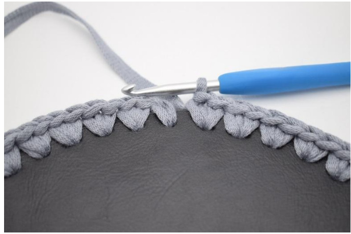
2. Like this.