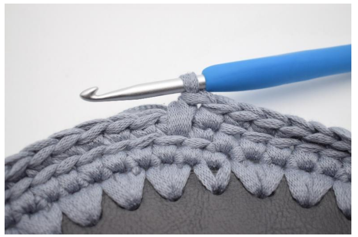
9. Like this. Now, you have worked 1 sc and 1 lsc.