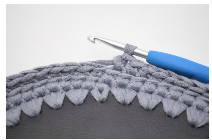
6. Repeat the round of sc in blo.