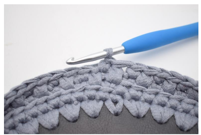
16. Work 1 sc in the next st.