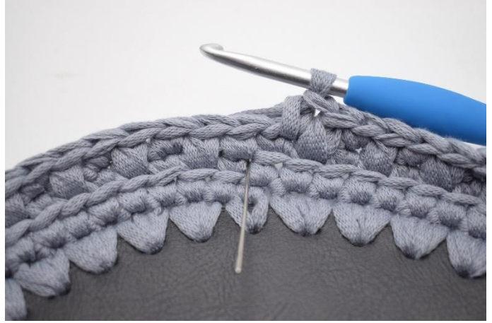
14. Now, alternate between lsc and sc. Work 1 lsc in the next st. The needle marks where your lsc should be worked.