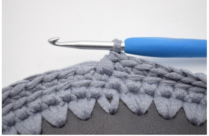
7. Now, alternate between sc and lsc. Start with a sc.