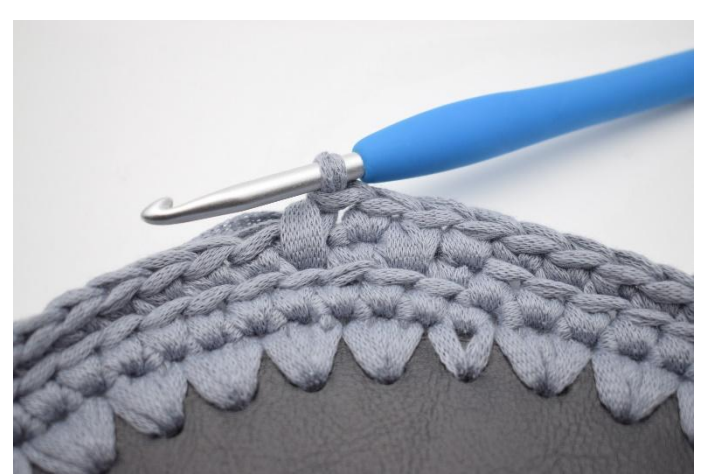
12. Like this.