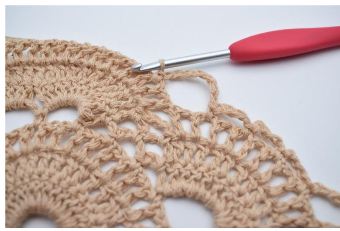
23. Like this.