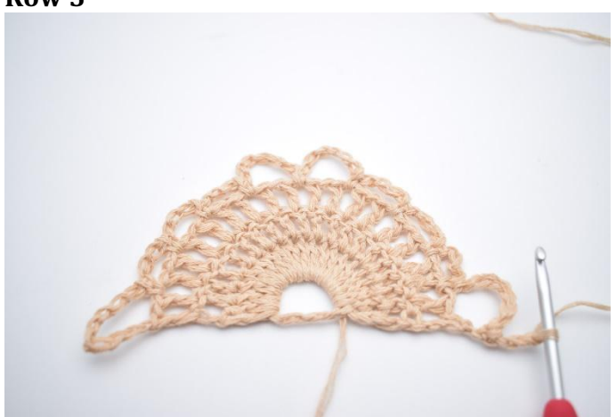
1. Ch 3 and turn (counts as dc 1).