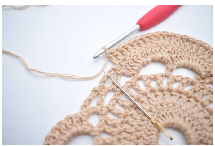
7. Sc 1 in next ch-gap. The needle marks where to sc 1.