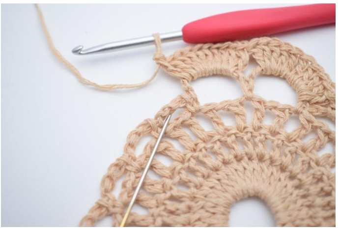
9. Sc 1 in next ch-gap. The needle marks where to sc 1.