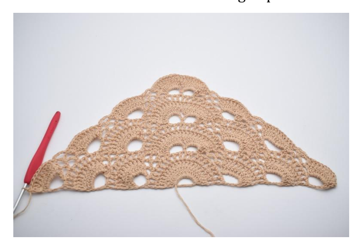
15. \ This \ row \ is \ made \ according \ to \ pattern \ row \ 11.