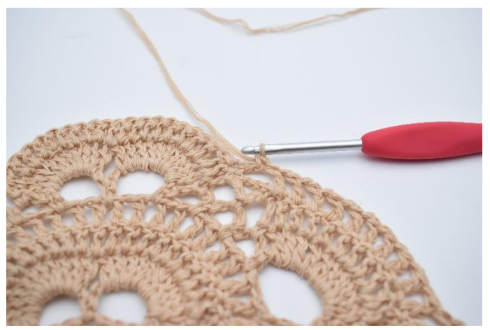
52. Like this.