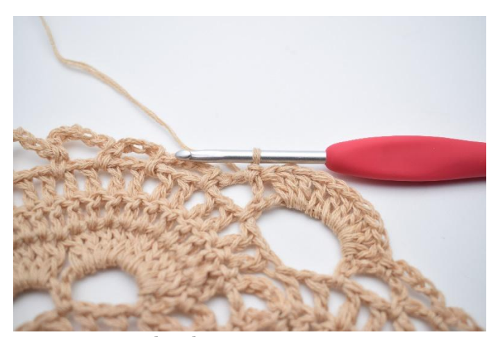
37. Sc 1 in the ch-gap next to it.