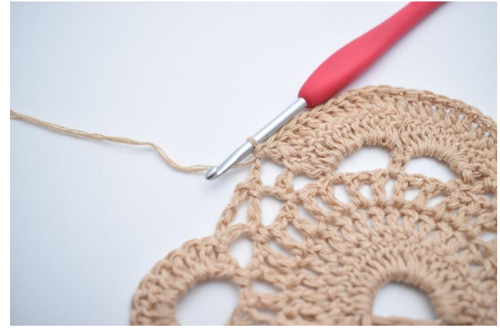
8. Like this.