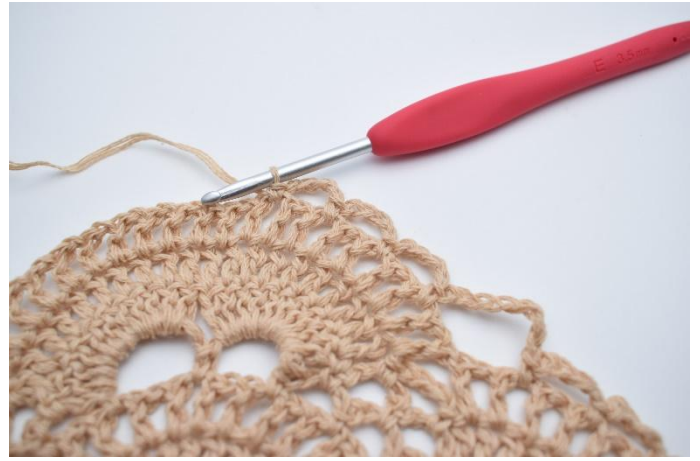
24. "Ch 4, skip 1 ch space, sc 1 in next ch space". Repeat from " to " a total of 3 times so you have 3 small ch-gaps.