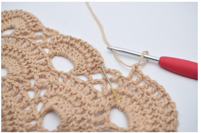
48. Skip the small ch-gap and dc 1 into the first dc of the next large ch-gap. The needle marks where to put your next dc.