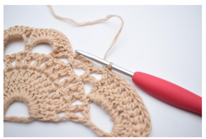
4. Like this.