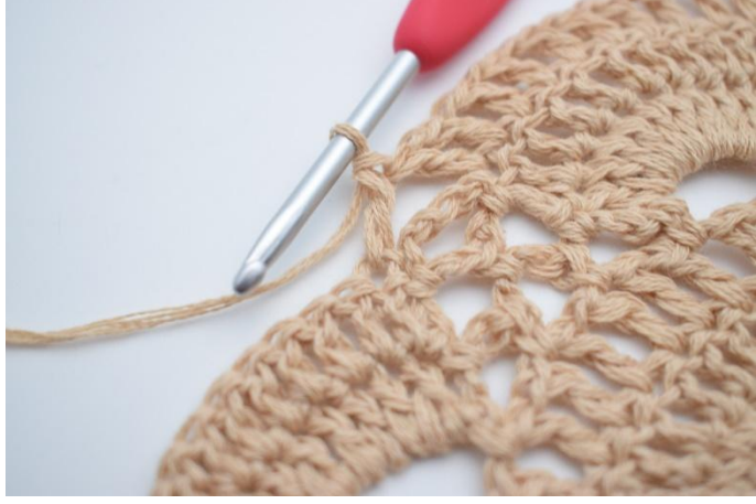
7. Like this.