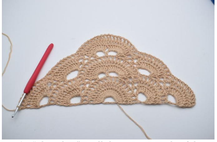
57. "Ch 1, dc 1" in all the remaining dc of the last large ch-gap (10 dc).