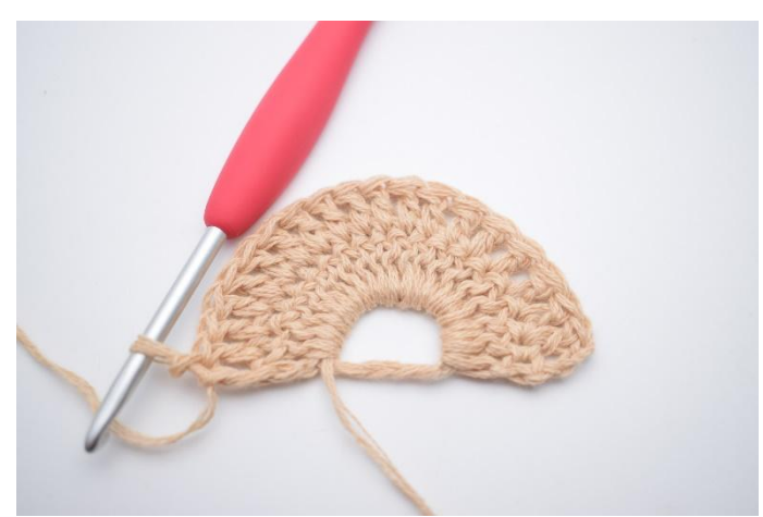
2. Dc 1 in each of the st all round (20dc).