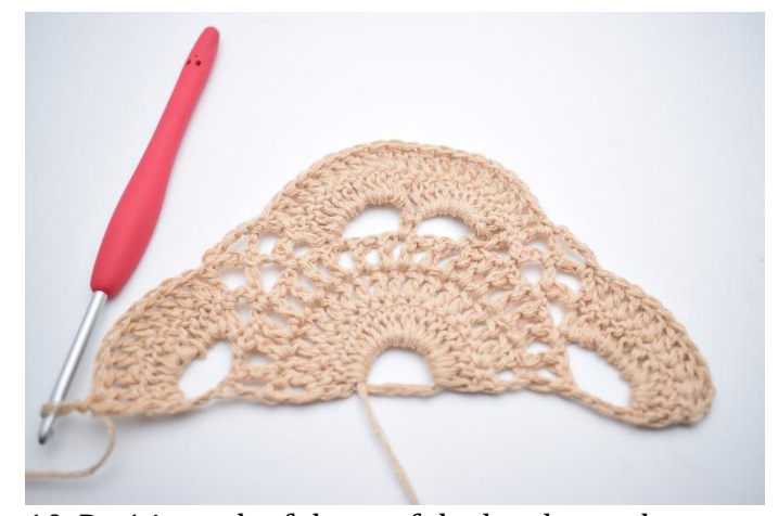
10. Dc 1 in each of the st of the last large ch-gap. (10 dc)