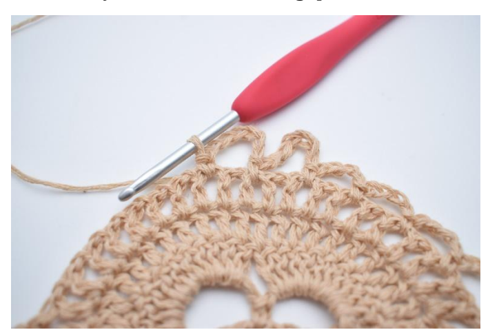
26. Ch 7, skip 1 ch space and sc 1 in next ch space.