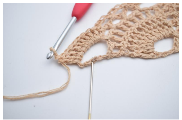
44. Dc 10 into the last large ch-gap. The needle marks where to put your last dc.