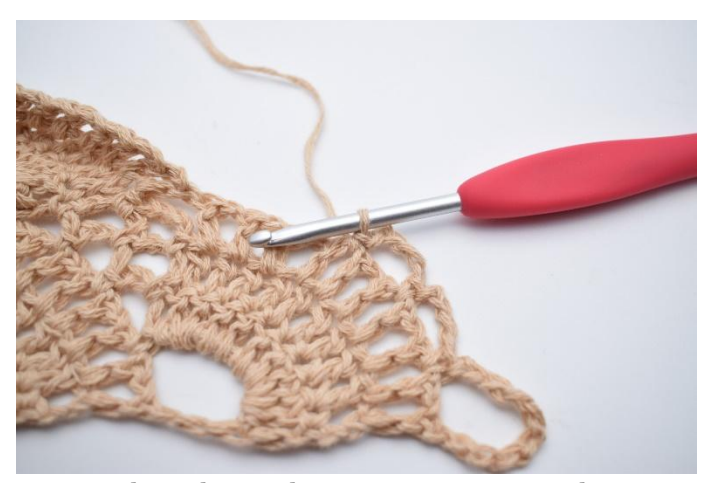
20. Ch 4, skip 1 ch space, sc 1 in next ch space.