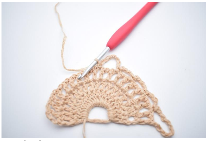
9. Like this.