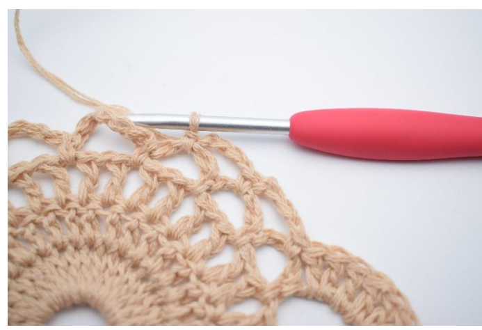
6. Ch 4, sc 1 in next ch-gap.