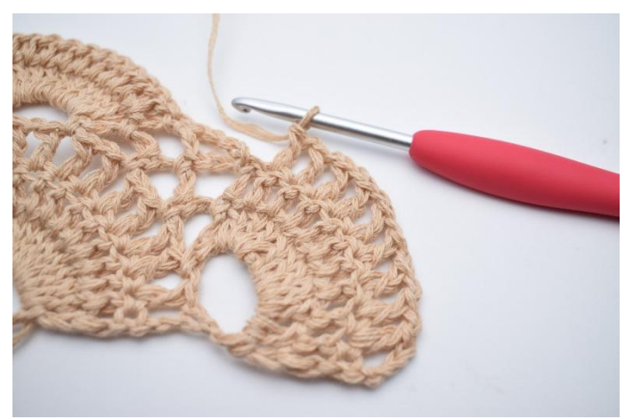
2. Dc 1 in next st. "Ch 1, dc 1" in all dc of the large ch-gap (10 dc).