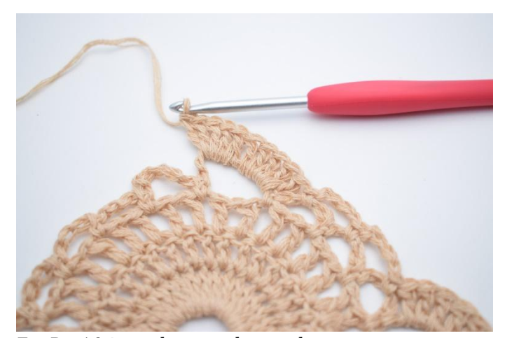
7. Dc 10 into the next large ch-gap.