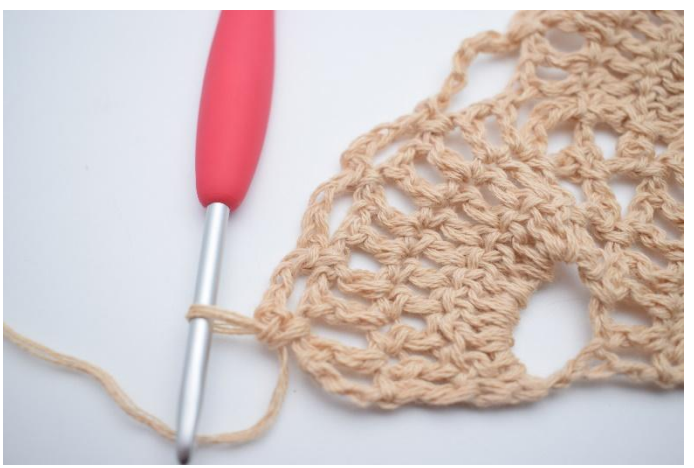
30. "Ch 4, skip 1 ch space, sc 1 in next ch space". Repeat from " to " a total of 3 times so you have 3 small ch-gaps.