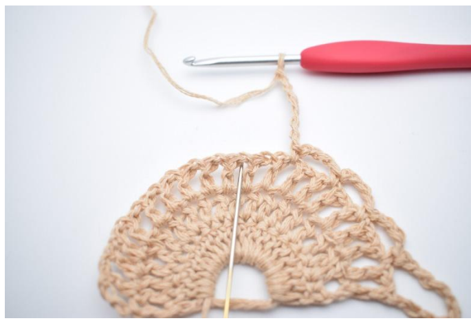
8. Ch 7, skip 1 ch-gap, sc 1 in next ch-gap.