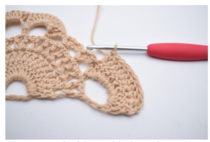
2. Dc 1 in each of the st of the large ch-gap (10 dc).