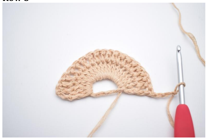
1. Ch 4 and turn (counts as dc 1 and ch 1).