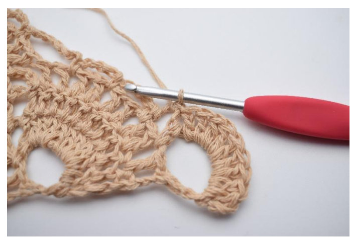
34. Sc 1 in the next ch-gap.