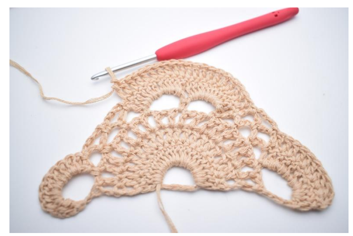
6. Dc 1 in each of the st of the 2 large ch-gaps (20 dc).