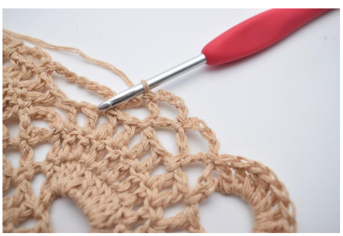
35. Ch 4, sc 1 in the next ch-gap. Repeat once more so you have 2 small ch-gaps.