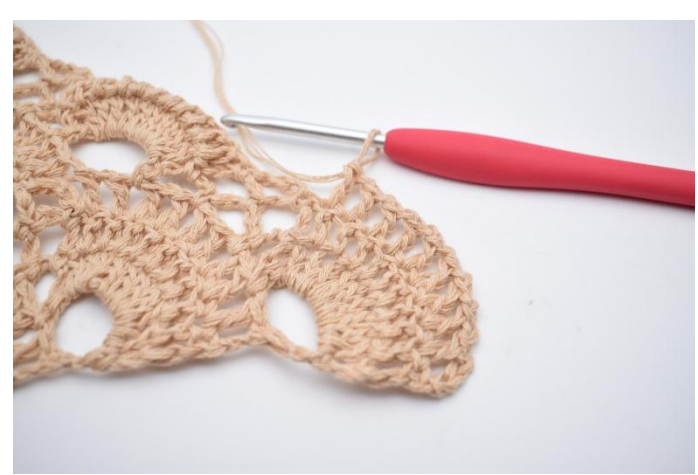
47. Dc 1 in next st. "Ch 1, dc 1" in all dc of the large ch-gap (10 dc).