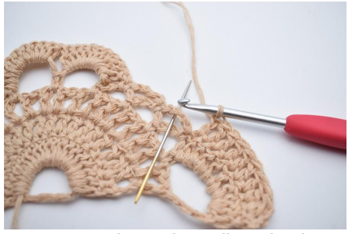
3. Sc 1 in next ch-gap. The needle marks where to sc 1.