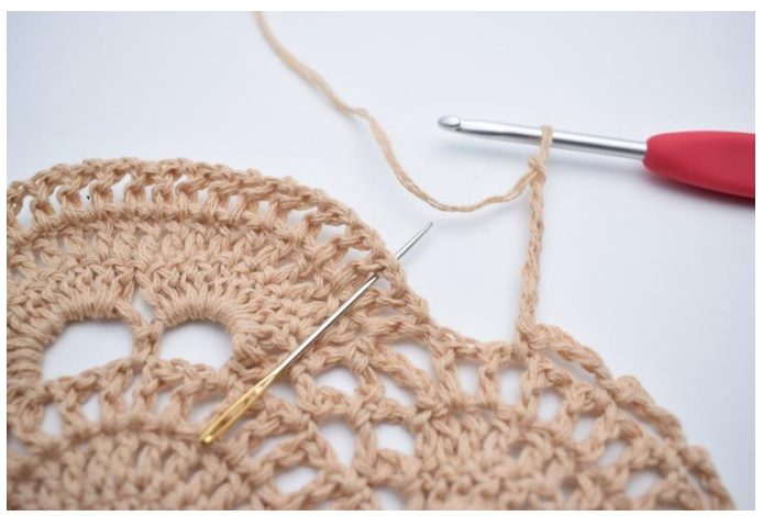
22. Chain 7 and skip 2 ch spaces. Sc 1 in next ch space. The needle marks where to sc 1.