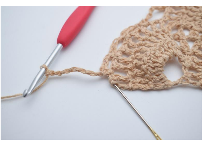
31. Ch 7 and dc 1 in last st. The needle marks where to dc 1.