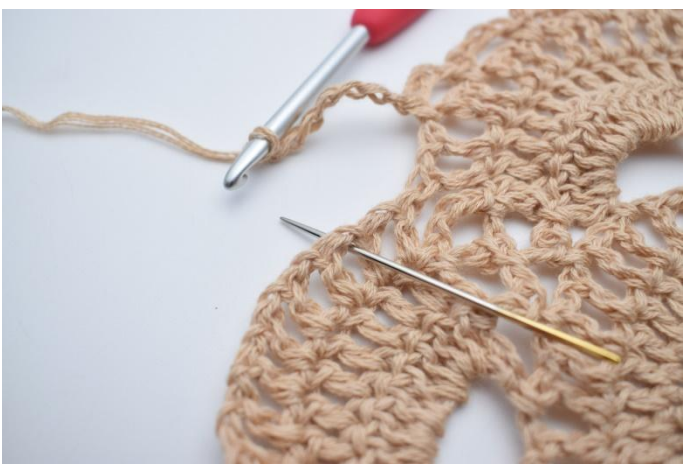
28. Chain 7 and skip 2 ch spaces. Sc 1 in next ch space. The needle marks where to sc 1.