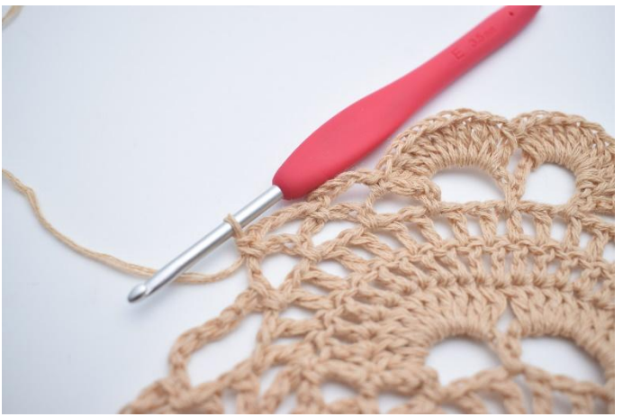
41. Ch 4, sc 1 in the next ch-gap. Repeat once more so you have 2 small ch-gaps.