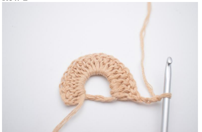
1. Ch 3 and turn (counts as dc 1).