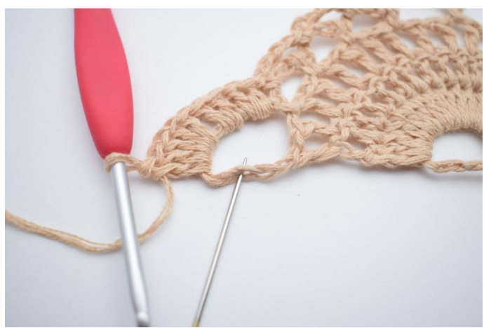
13. Dc 10 into the last large ch-gap. The last dc is crocheted into the 3rd ch marked here by the needle.