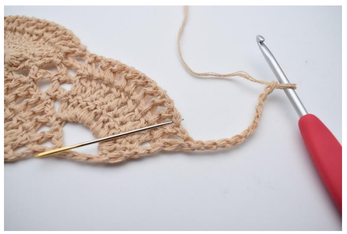
17. Skip 1 ch space and sc 1 in next ch space. The needle marks the ch space in which to sc 1.