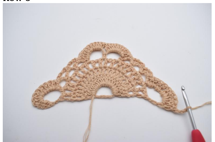
1. Ch 3 and turn (counts as dc 1).