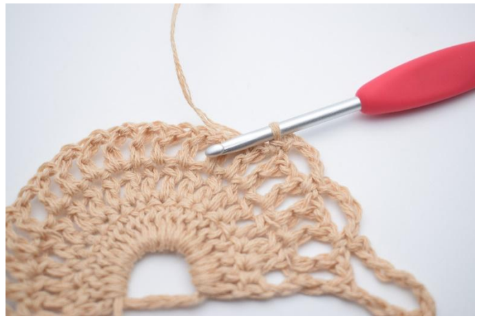
6. Ch 4, skip 1 ch-gap, sc 1 in next ch-gap.