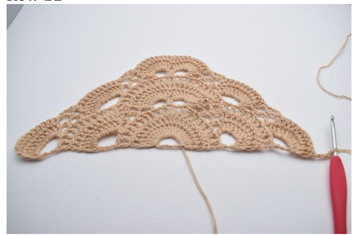
46. Ch 4 and turn (counts as dc 1 and ch 1).