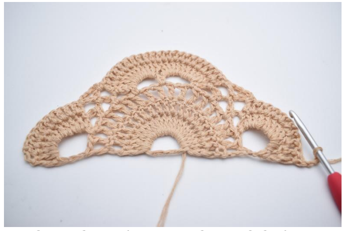
1. Ch 4 and turn (counts as dc 1 and ch 1).