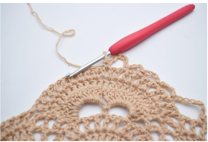
25. Ch 7, skip 1 ch space and sc 1 in next ch space.