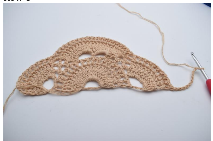
16. Ch 10 and turn (counts as dc 1 and ch 7).