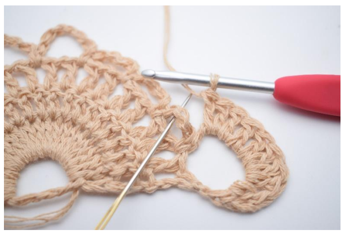
3. Sc 1 in next ch-gap. The needle marks where to sc 1.