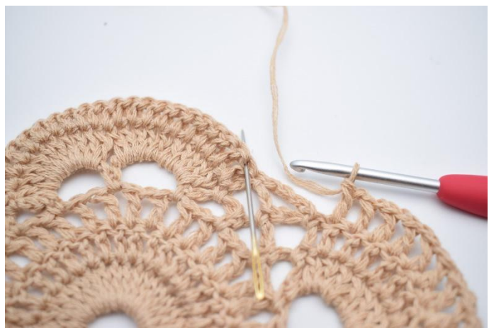
3. Skip the small ch-gap and dc 1 into the first dc of the next large ch-gap. There needle marks where to dc 1.