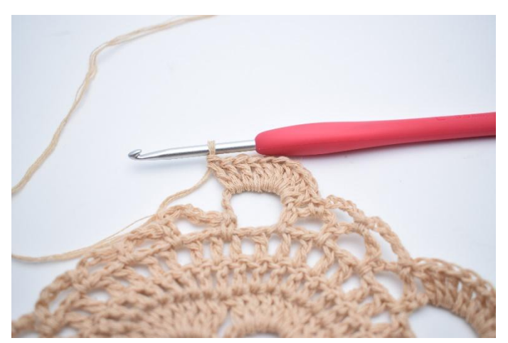
39. Dc 10 into the next large ch-gap.