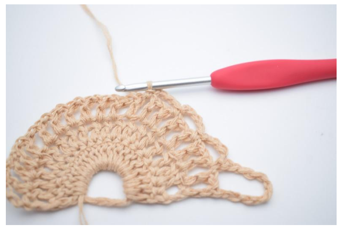
7. Repeat once more so you have 3 small chapses.