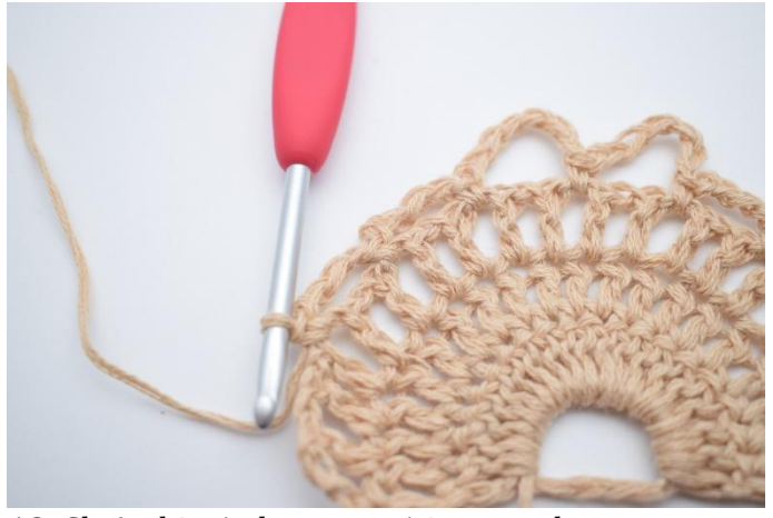
12. Ch 4, skip 1 ch-gap, sc 1 in next ch-gap.