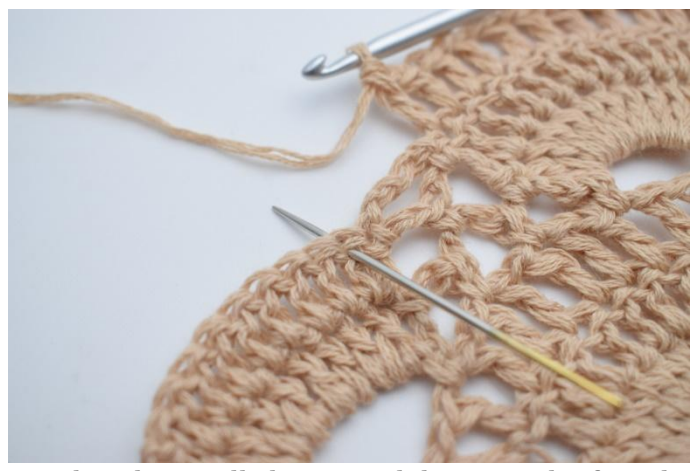
6. Skip the small ch-gap and dc 1 into the first dc of the next large ch-gap. There needle marks where to dc 1.