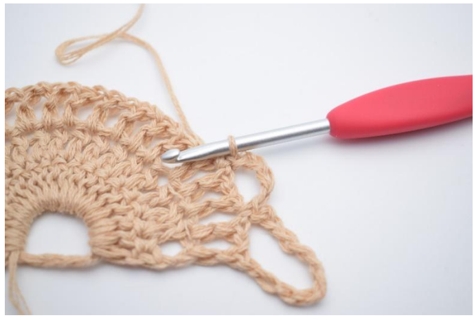
5. Like this.