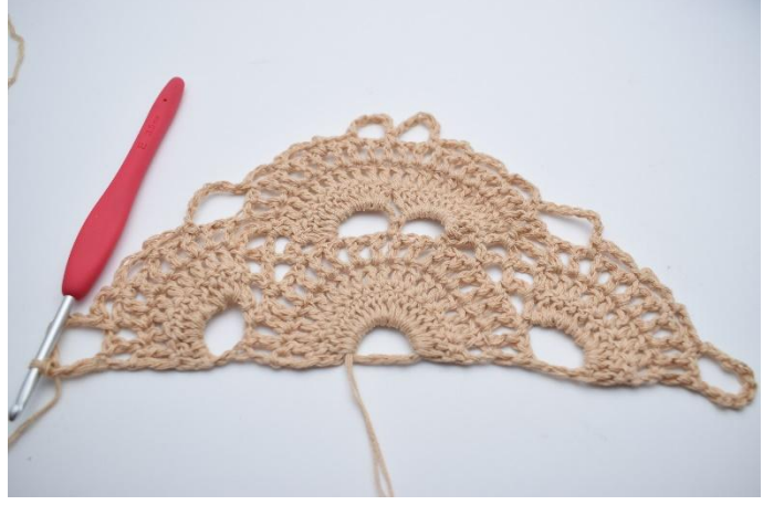
32. Like this.