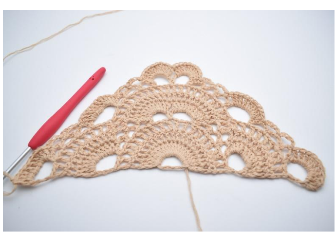
45. Like this.