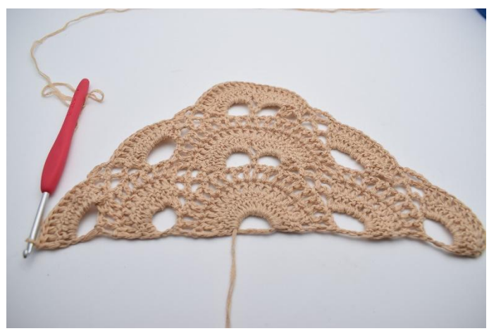
9. Dc 1 in each of the st of the last large ch-gap (10 dc).