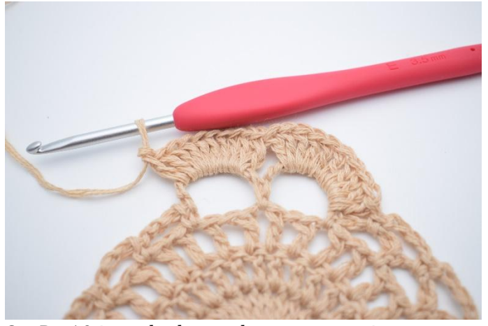
8. Dc 10 into the large ch-gap next to it.