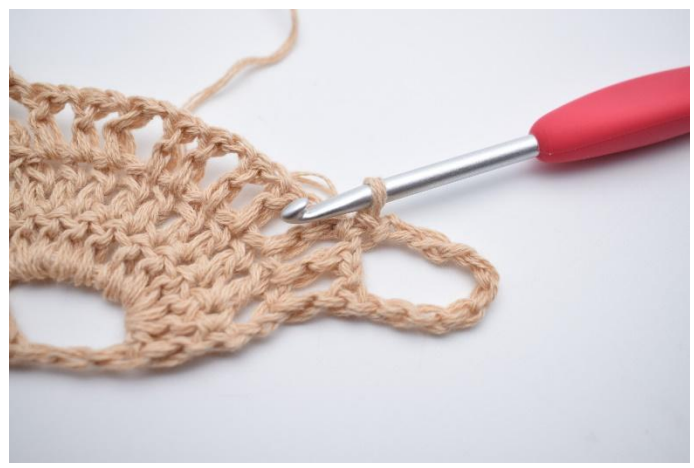
18. Like this.