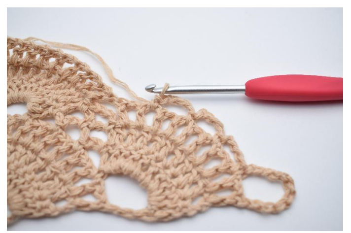
21. Repeat once more so you have 3 small chaps.