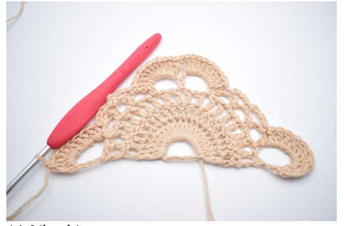
14. Like this.