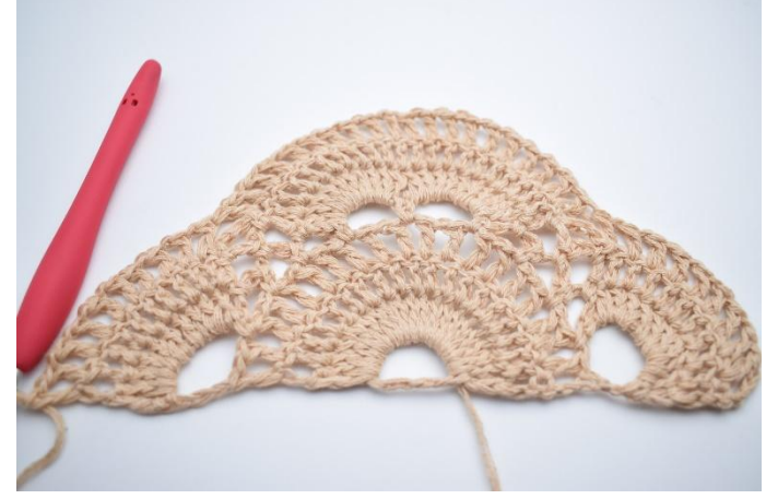
8. "Ch 1, dc 1" in all the remaining dc of the last large ch-gap (10 dc).