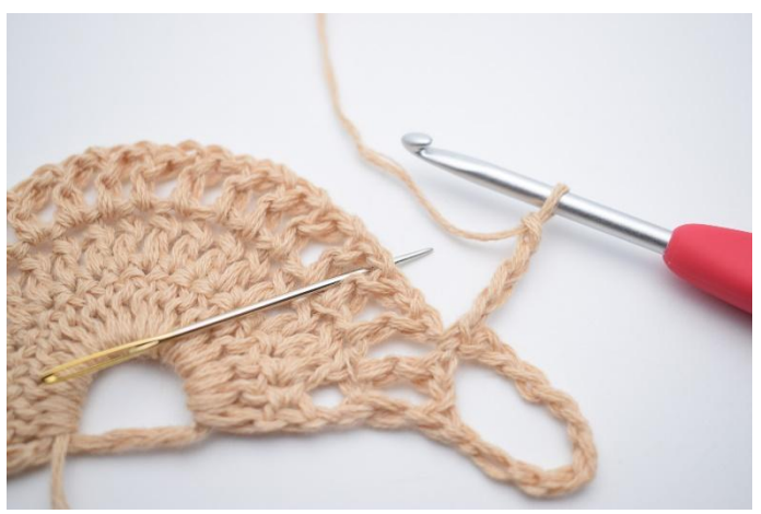
4. Ch 4, skip 1 ch-gap, sc 1 in next ch-gap. The needle marks the ch-gap in which you sc 1.