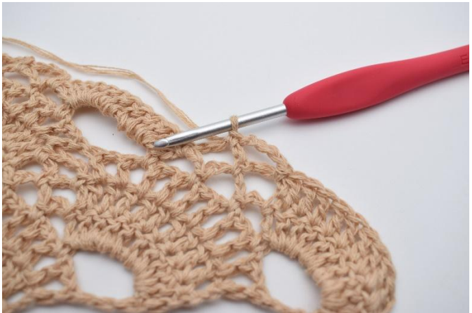
2. Sc 1 in next ch-gap, ch 4 and sc 1 in next ch-gap.