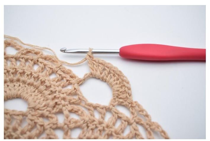
36. Dc 10 into the large ch-gap.