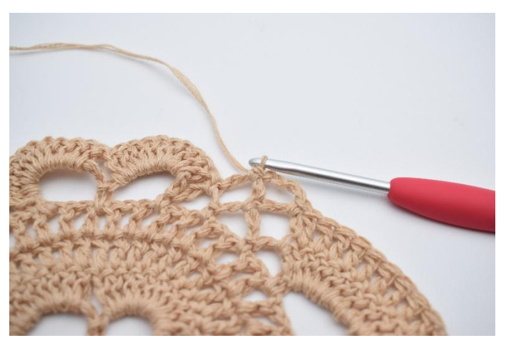
4. Sc 1 in next ch-gap. Ch 4 and sc 1 in next ch-gap.