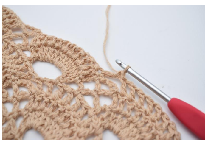
49. Like this.