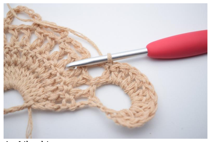
4. Like this.