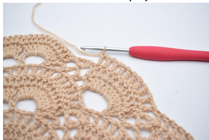
50. "Ch 1, dc 1" in all dc of the large ch-gap (10 dc).