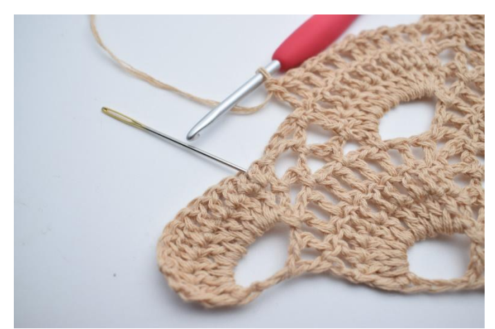
56. Skip the small ch-gap and dc 1 into the first dc of the last large ch-gap. The needle marks where to put your next dc.