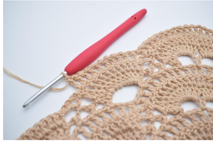
55. "Ch 1, dc 1" in all dc of the large ch-gap (10 dc).