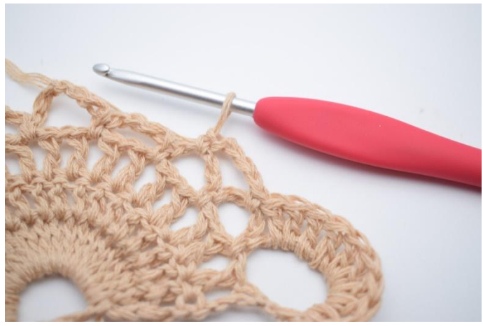
5. Ch 4, sc 1 in next ch-gap.