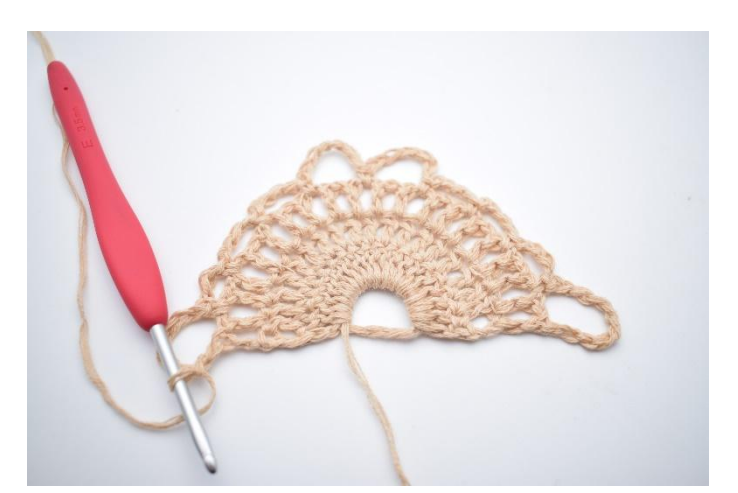
16. Like this.