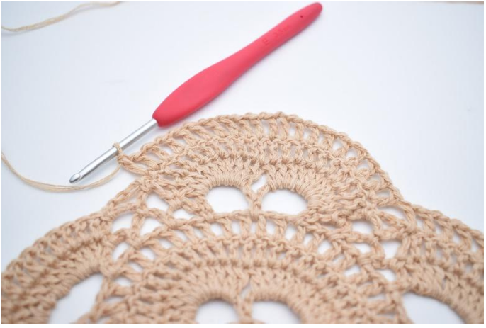
53. "Ch 1, dc 1" in all dc of the 2 large ch-gaps (20 dc).