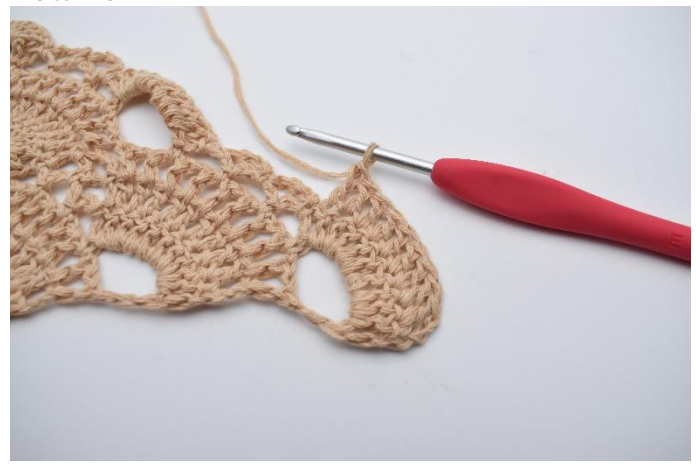
1. Ch 3 and turn (counts as dc 1). Dc 1 in each of the st of the large ch-gap (10 dc).