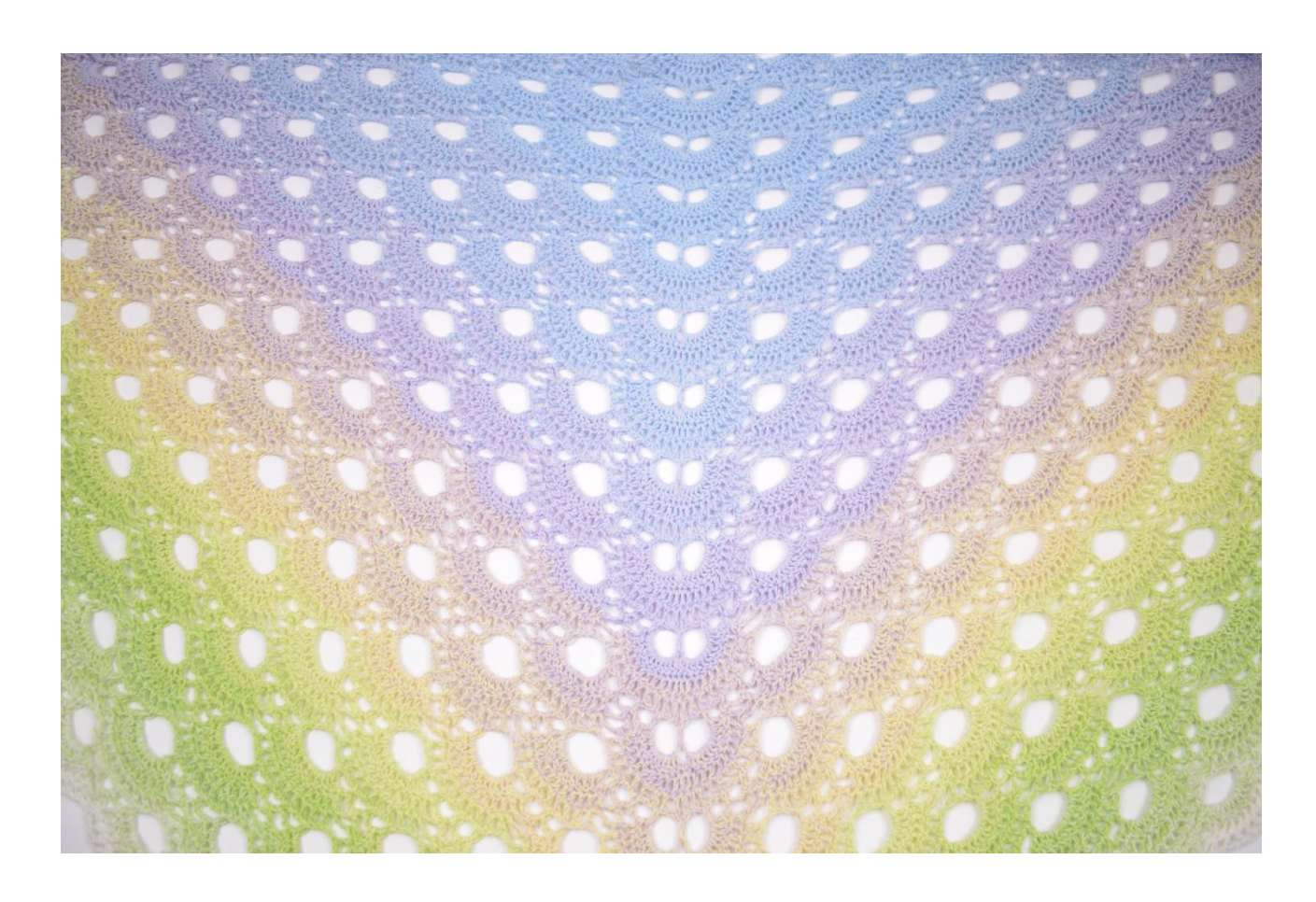
Enjoy \ \odot

1. This row is made according to pattern row 11. Continue the pattern by repeating rows 8-11 until your yarn finishes and the shawl has the desired size.