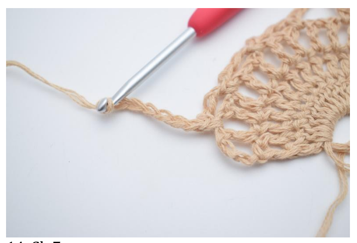
14. Ch 7.