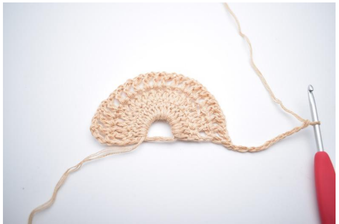
1. Ch 10 and turn (counts as dc 1 and 7 ch).