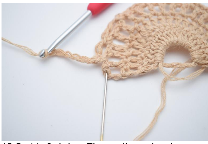
15. Dc 1 in 3rd ch st. The needle marks where your dc 1 goes.