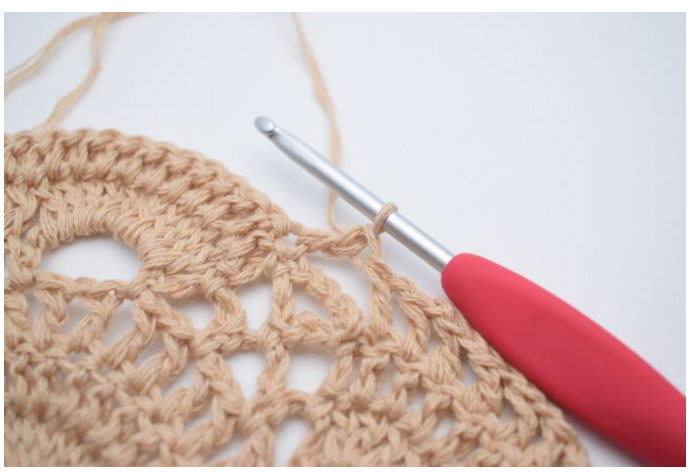
4. Like this.