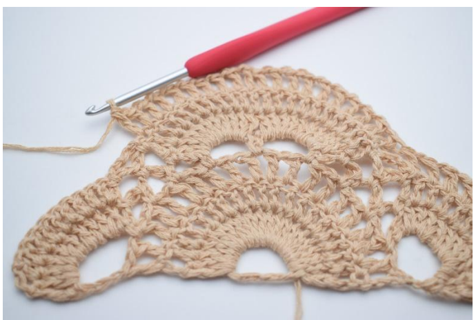
5. "Ch 1, dc 1" in all dc of the 2 large ch-gaps (20 dc).