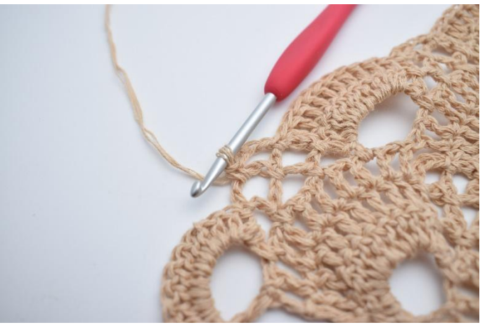
8. Sc 1 in next ch-gap. Ch 4 and sc 1 in next ch-gap.