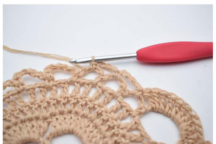
38. Ch 4, sc 1 in the next ch-gap. Repeat once more so you have 2 small ch-gaps