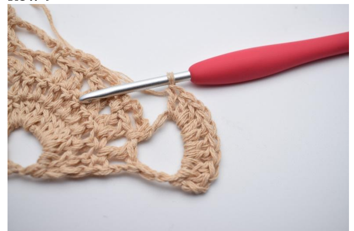
33. Ch 3 and turn (counts as dc 1). Dc 9 into the large ch-gap (10 dc).