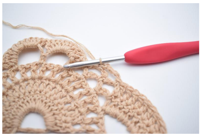
5. Ch 4 and sc 1 in next ch-gap.