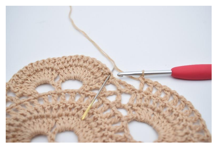
51. Skip the small ch-gap and dc 1 into the first dc of the next large ch-gap. The needle marks where to put your next dc.