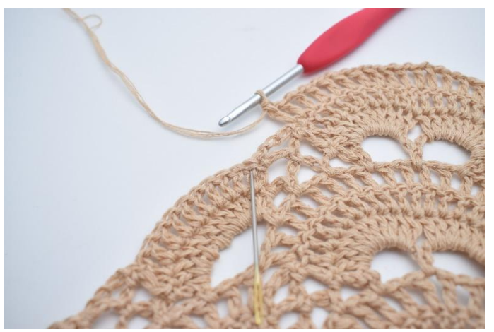
54. Skip the small ch-gap and dc 1 into the first dc of the next large ch-gap. The needle marks where to put your next dc.