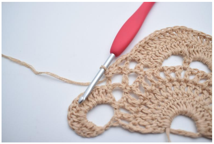
9. Ch 4 and sc 1 in next ch-gap. The needle marks where to sc 1.