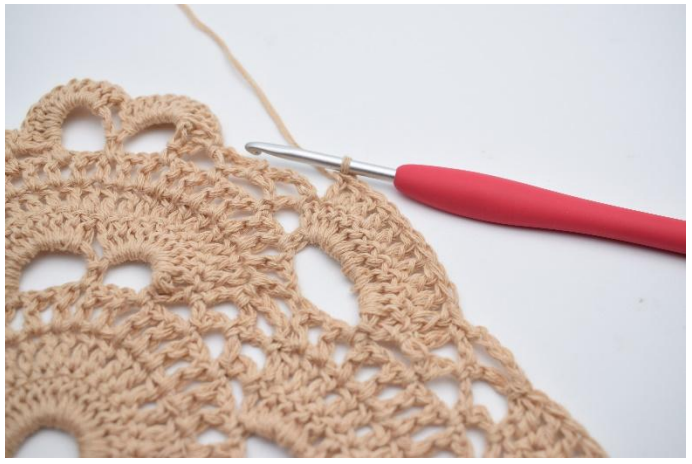
3. Dc 1 in each of the st of the next large ch-gap (10 dc).