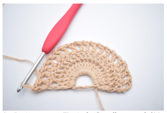
Dc 1 in next st. "Dc 1, ch 1" in all st to end. (20 dc)