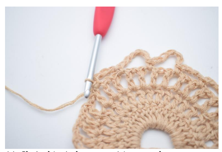
11. Ch 4, skip 1 ch-gap, sc 1 in next ch-gap.