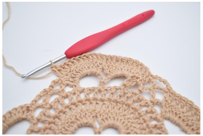
5. Dc 1 in each of the st of the 2 large ch-gaps (20 dc).