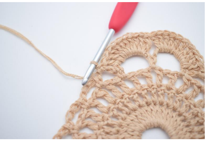
10. Like this.