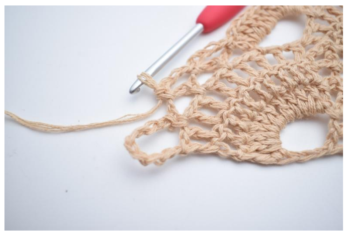
43. Ch 4, sc 1 in the next ch-gap. Repeat once more so you have 2 small ch-gaps.