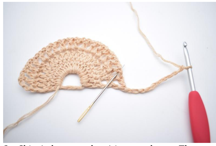
2. Skip 1 ch-gap and sc 1 in next ch-gap. The needle marks the ch-gap in which you sc 1.