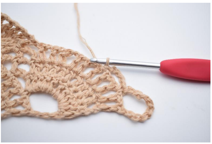
19. Ch 4, skip 1 ch space, sc 1 in next ch space.