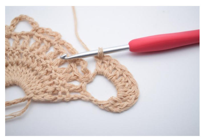
2. Dc 9 into the large ch-gap.