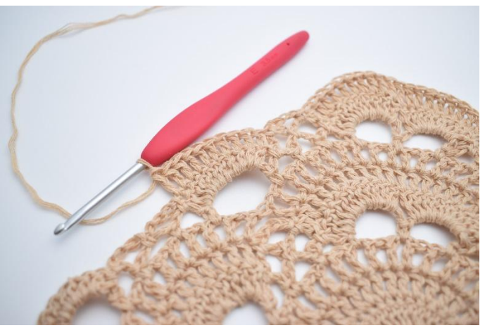
7. Dc 1 in each of the st of the next large ch-gap (10 dc).