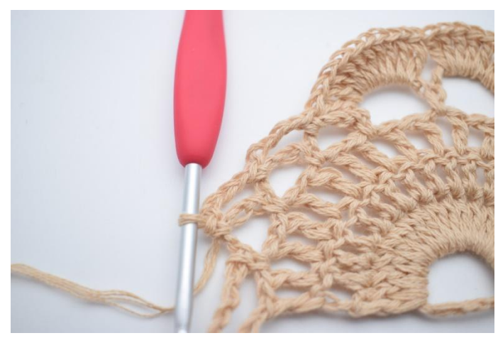
12. Ch 4 and sc 1 in next ch-gap.