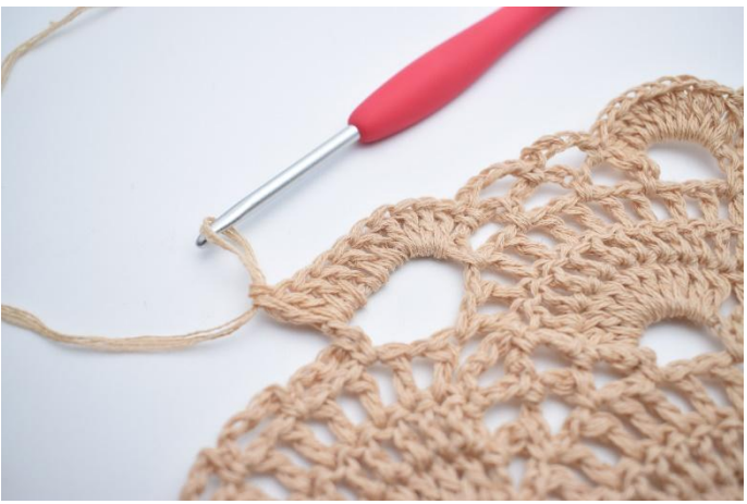
42. Dc 10 into the large ch-gap. Sc 1 in next ch-gap.