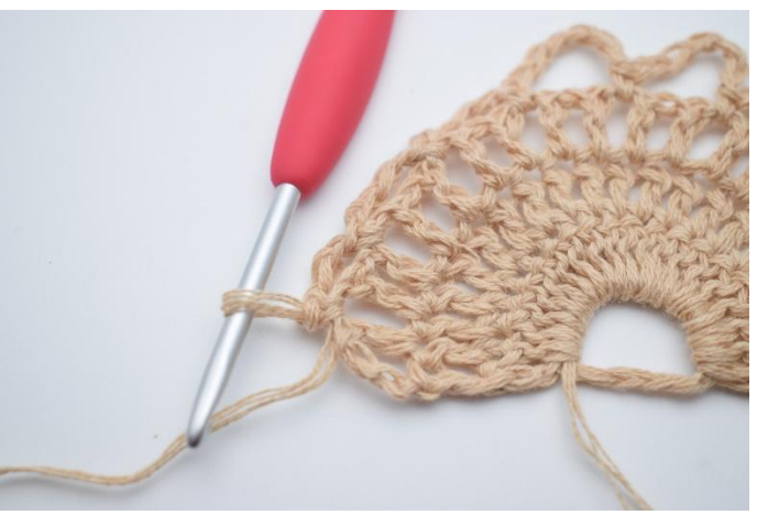
13. Repeat once more so you have 3 small chgaps.