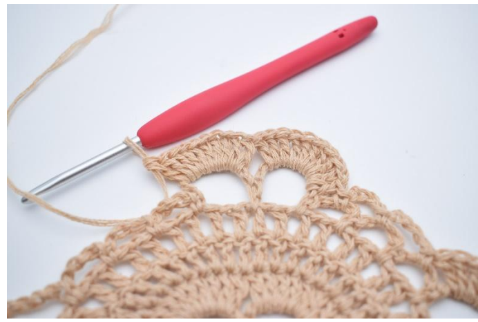
40. Dc 10 into the large ch-gap next to it. Sc 1 in next ch-gap.