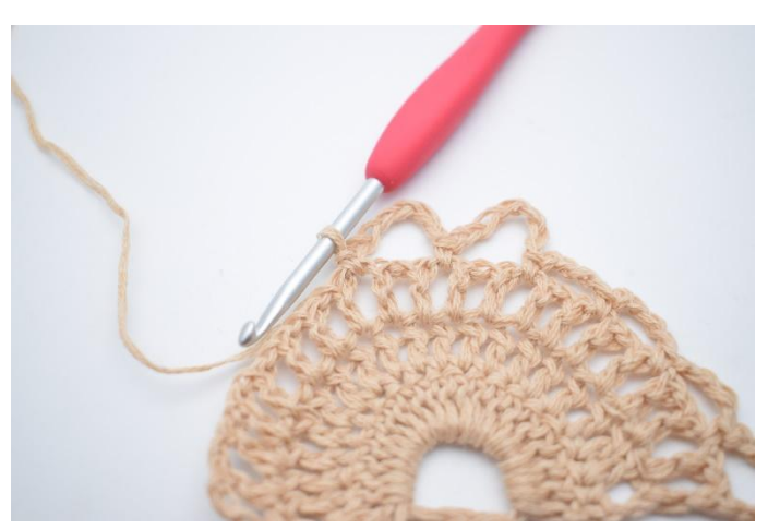
10. Ch 7, skip 1 ch-gap, sc 1 in next ch-gap".