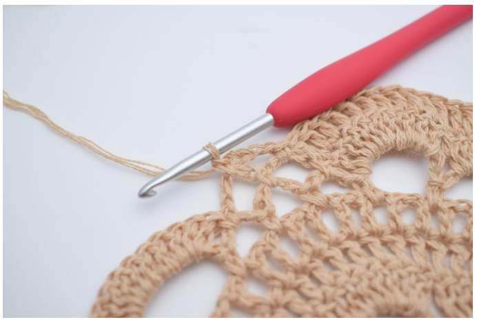
6. Sc 1 in next ch-gap. Ch 4 and sc 1 in next ch-gap.