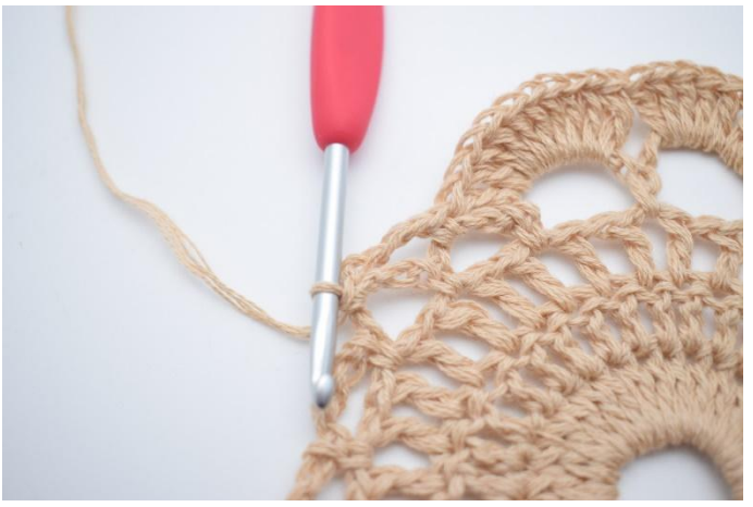
11. Ch 4 and sc 1 in next ch-gap.