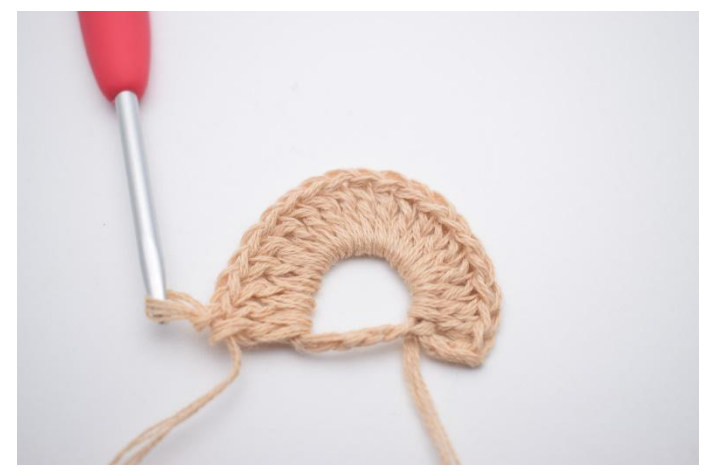
2. Dc 19 into the ch circle (20 dc).