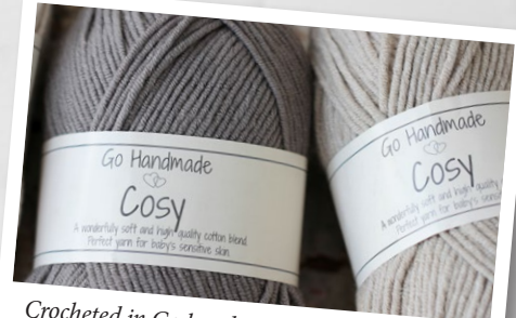
Crocheted in Go handmades Cosy – A wonderfully soft and high-quality cotton mix that keeps the shape. 60% Cotton/40% Acrylic, 50 g/100 m.

Go handmade's collection of bag handles and locks has been made of the best materials beautifully assembled by competent hands.