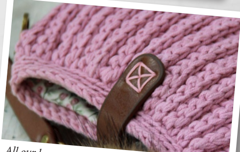
All our bags are with lining – beautiful lining gives the finish, the extravagant look and the luxury feeling of quality. The lining also has a very important function, it keeps the bag in shape.