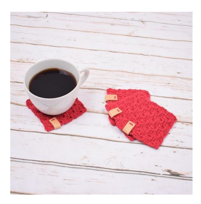
Enjoy © Love from Hobbii.com