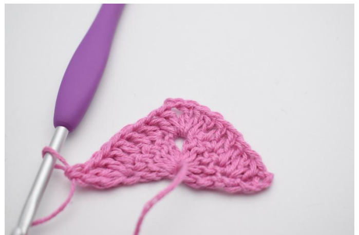
8. Like this.