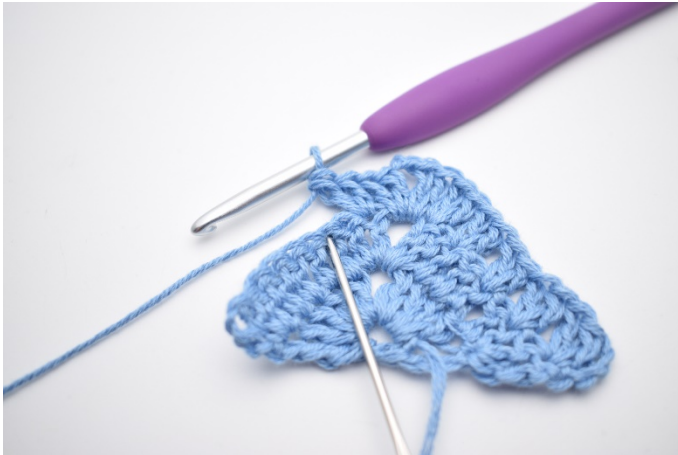
5. *2 dc in the next st, skip 1 st*