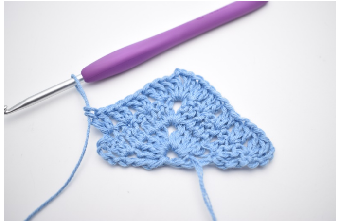
6. Repeat *-* a total of 4 times.