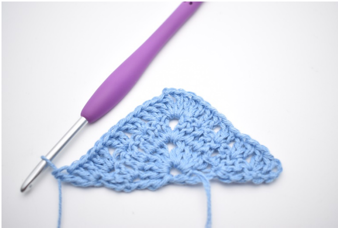
7. In the last st, work 2 dc and 1 tr.