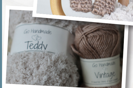
Crocheted in Go handmades Teddy: 100% Polyester, 50 g/65 m and Go handmades Vintage: 70% Wool/30% Bamboo, 25 g/60 m.