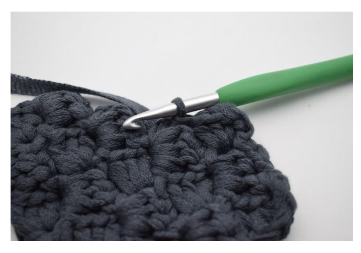
Work row as described until the last "square".