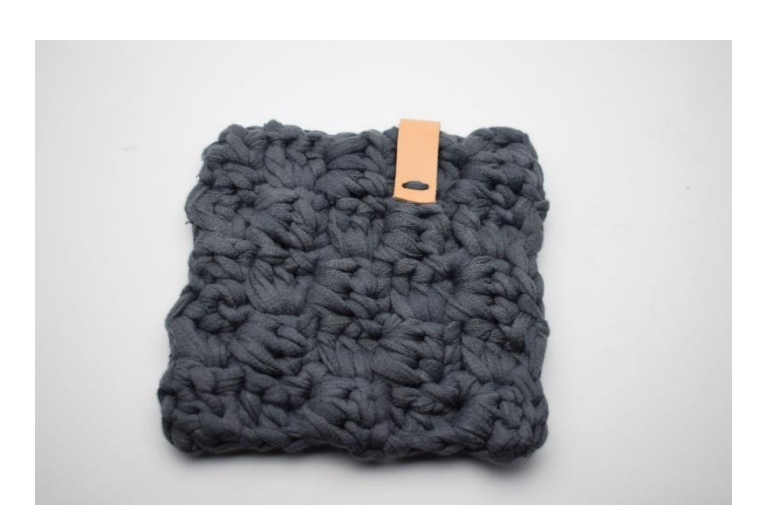
Enjoy ☺ Love from Hobbii.com