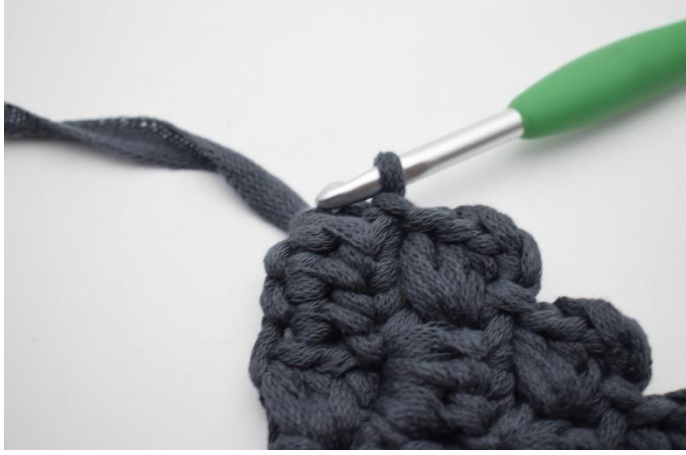
2. Turn and work sl st along the side of the first "square". Ch 2 (= replaces 1 hdc) and 3 hdc. Work 1 sl st in the top corner of the next "square".