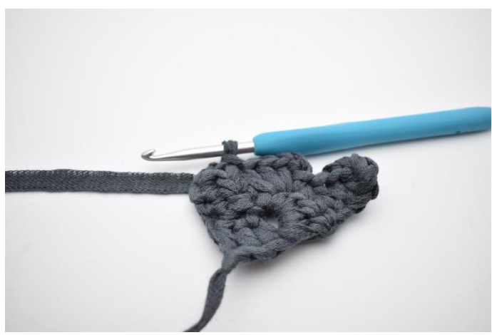
Ch 2 (= replaces 1 hdc) and 3 hdc in the same "hole" which was made with sl st and ch 2. You now worked one more "square" and you have a total 3 "squares" on your row.