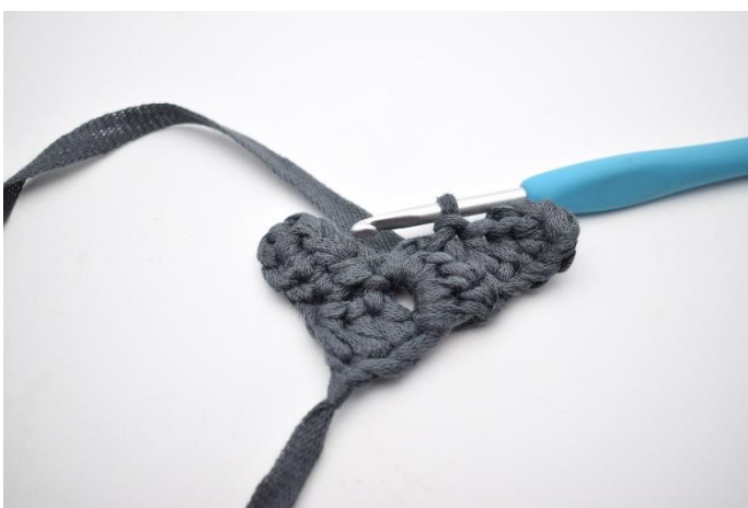
Ch 2 (= replaces 1 hdc) and 3 hdc in the same "hole" which was made with sl st and ch 2. Work 1 sl st in left hook on 2 nd "square" from previous row. You have now worked one more "square" and you have 2 "squares" on your row.