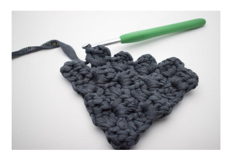
When at the last "square" on the row, you finish as follows: Ch 1 in the top corner of the next "square". You have now decreased 1 "square" on your row.