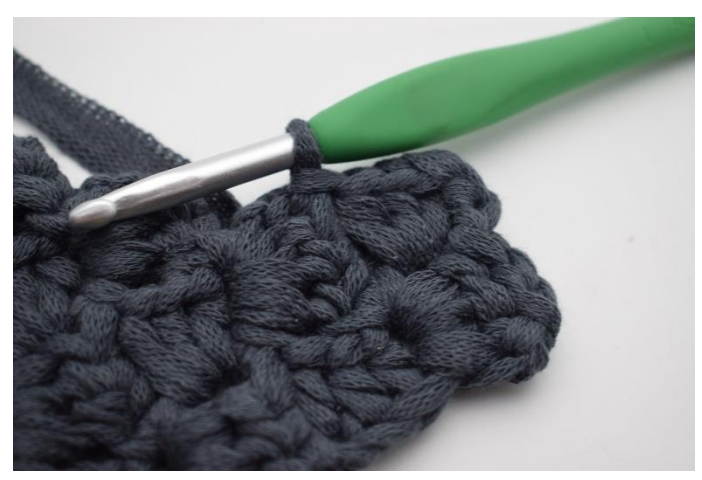
Work entire row like this until the last "square".