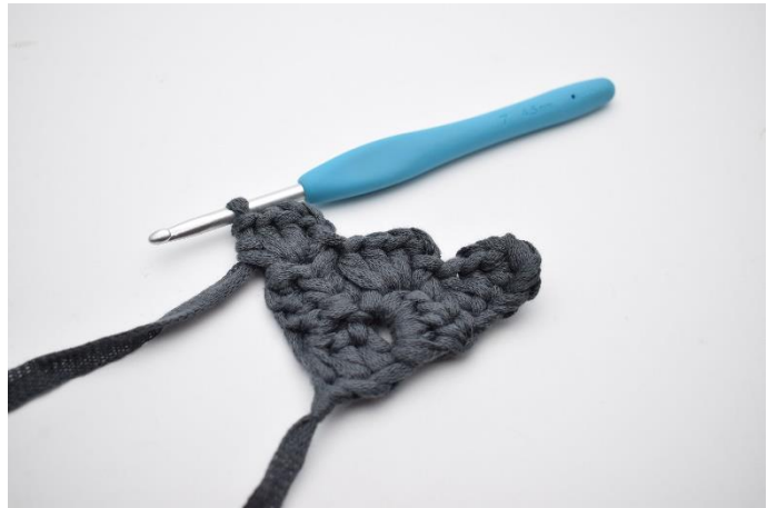
Repeat the rows and inc in each row until you have 5 squares.