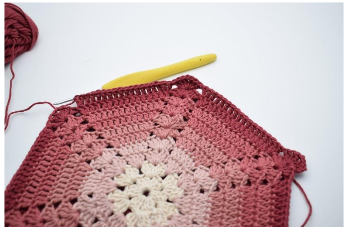
10. Skip 3 st, 2 dc in next st, 1 dc in each of the next 14 st, 2 dc in next st".