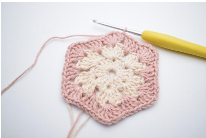
7. Repeat from "to" a total of 5 times and finish with 1 sl st.