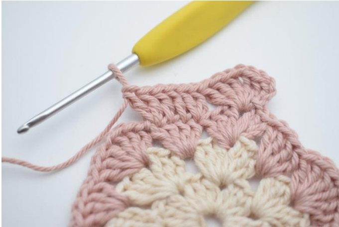
7. Like this.