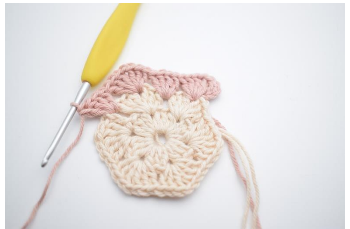
6. And 4 dc around the following ch-space".