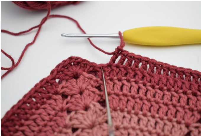
7. 2 dc in next st.