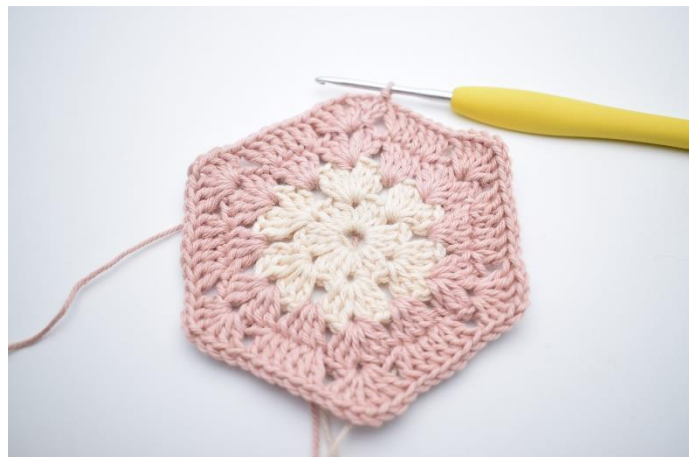
10. Repeat from "to" 5 times and finish with 1 sl st.