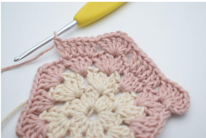
9. Skip 3 st, 2 dc in next st, 1 dc in each of the next 2 st, 2 dc in next st".