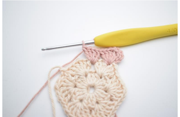
4. Like this.