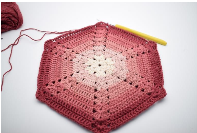
11. Repeat from "to" 5 times and finish with 1 sl st.