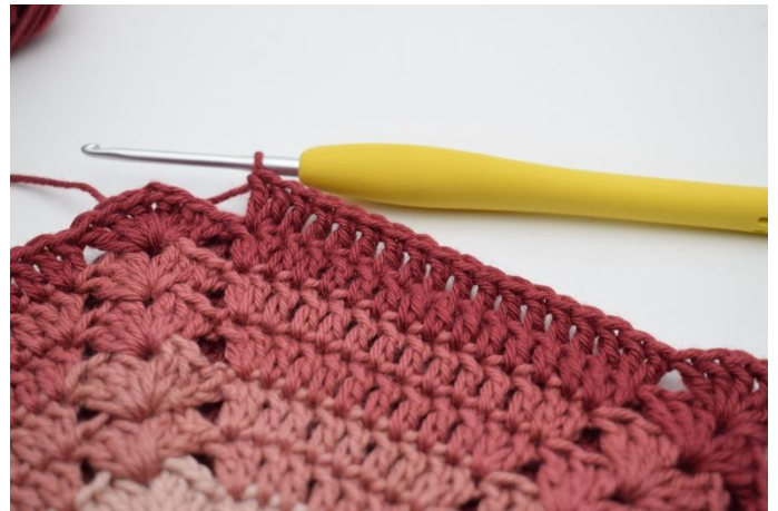
8. Like this.