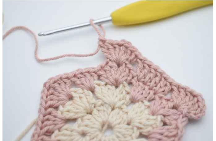
8. Then work "3 dc, ch 1, 3 dc around next ch-space,