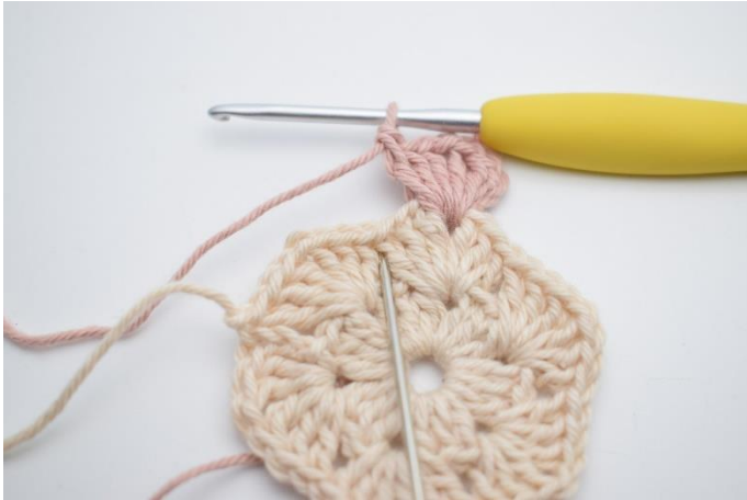
3. Work 4 dc around next ch-space.