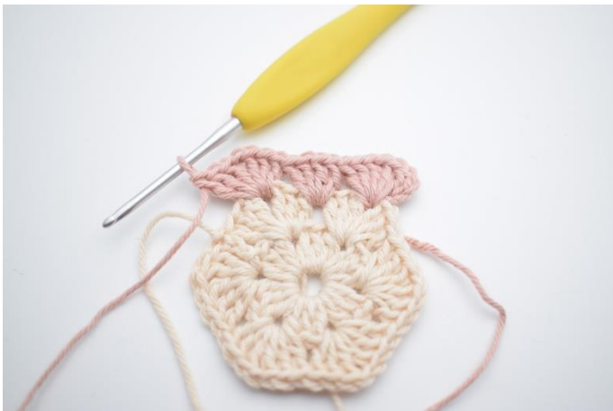
5. "3 dc, ch 1, 3 dc around next ch-space,