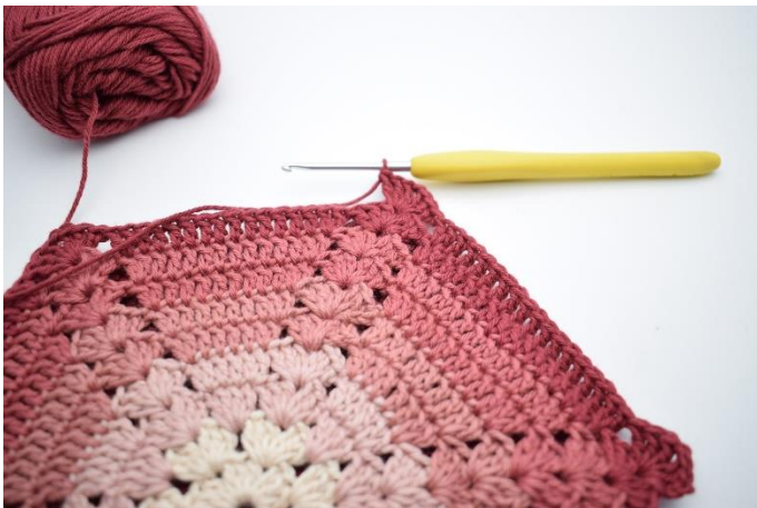
9. Ch 3 (replaces 1 st dc). Work 2 dc, ch 1, 3 dc around ch-space.