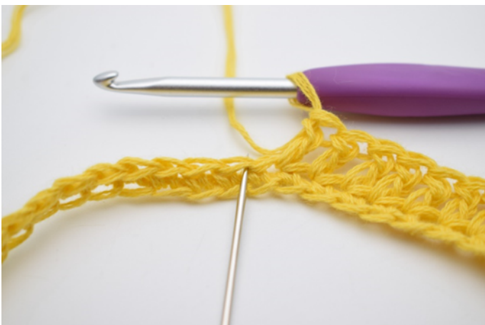
5. In next st "dc 2, ch 2, dc 2".