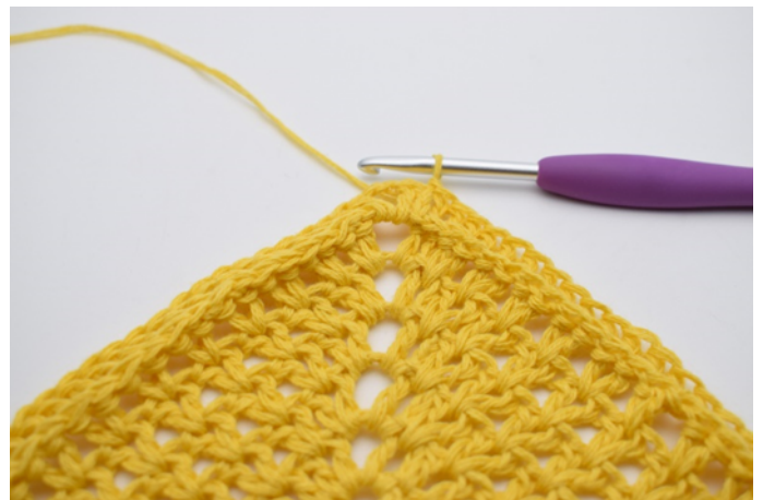
8. Like this.