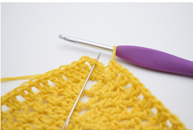
9. Repeat from “ to “ 29 (30) 32 (33) times. Finish with 1 sl st into the top of the 3 ch you started the round with.