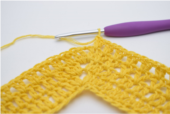
5. Repeat from “ to “ 29 (30) 32 (33) times.