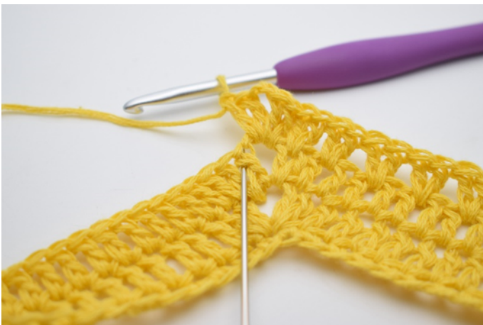
9. "Dc 2 between the next 2 dc's, miss 1 st".