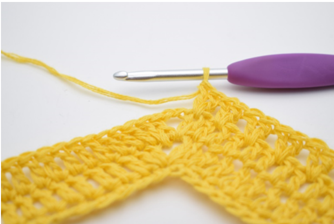
7. Repeat from " to " a total of 27 (28) 30 (31) times.