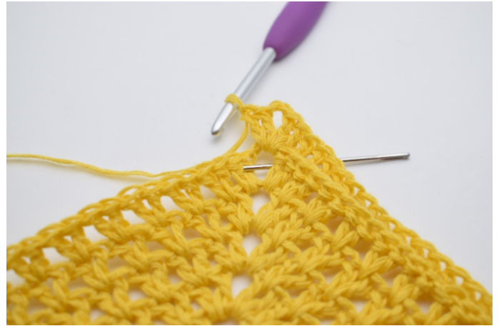
6. Bpdc through the next 70 (72) 76 (78) st.