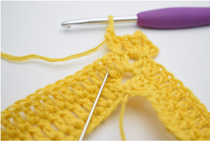
5. Miss 1 st (2 posts), "Dc 2 between the next 2 dc's, miss 1 st".