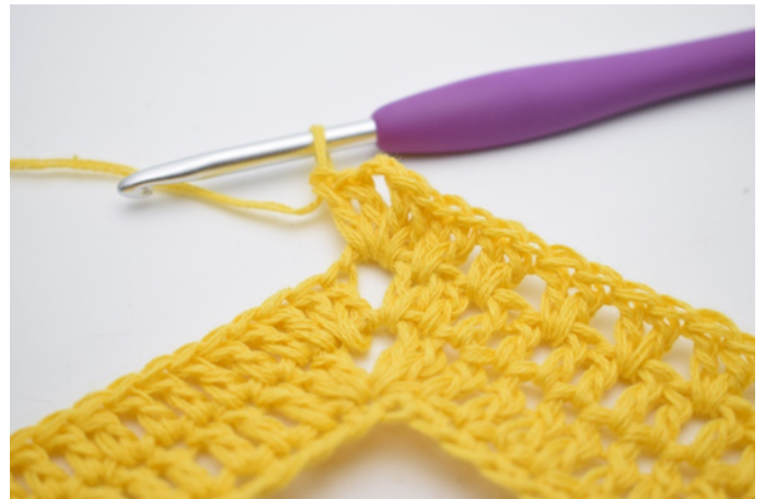
8. "Dc 2, ch 2, dc 2" in the ch sp.