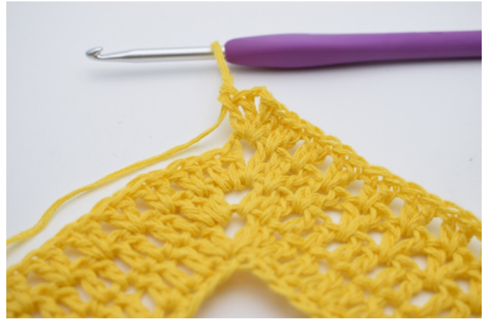
6. Dc 2, ch 2, dc 2 in the ch sp.