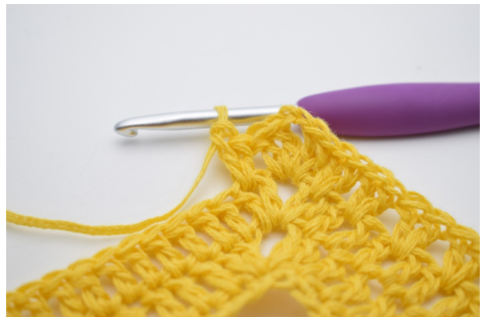
10. Like this.