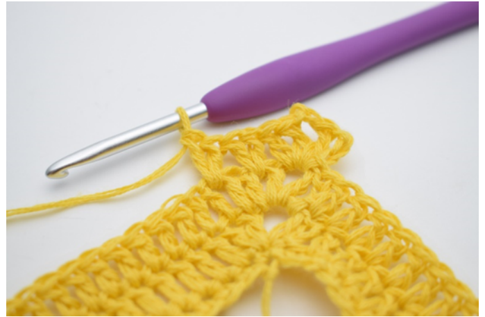
6. Like this.