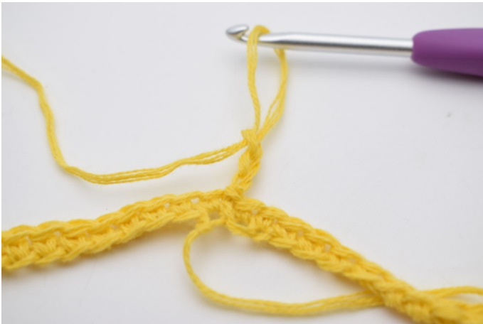
1. Ch 3 (counts as 1 dc).