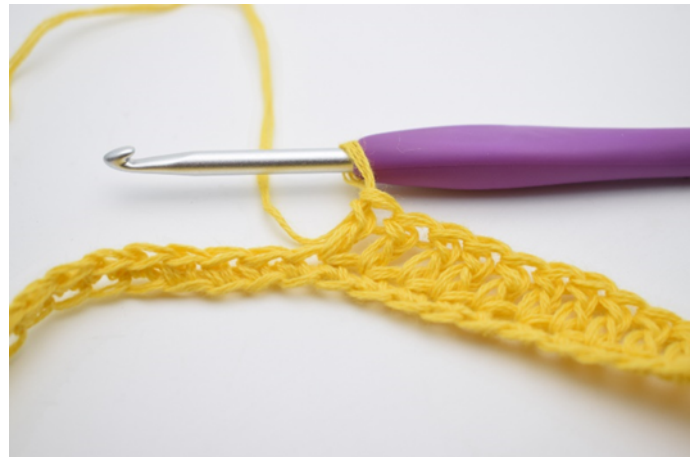
4. Dc 1 in the next 46 (48) 52 (54) st.