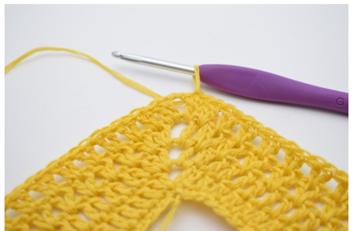
10. Like this.