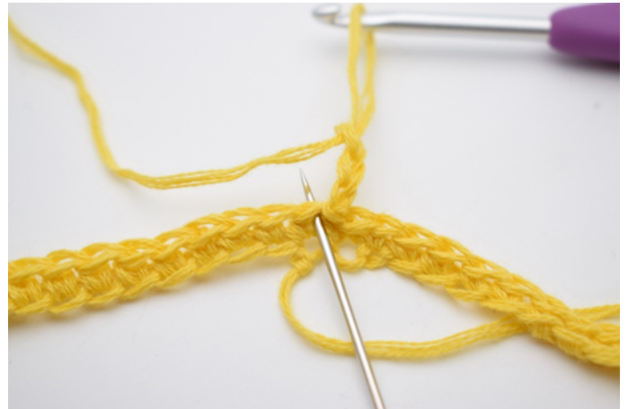
2. In the same stitch dc 1, ch 2, dc 2. The needle marks the stitch.