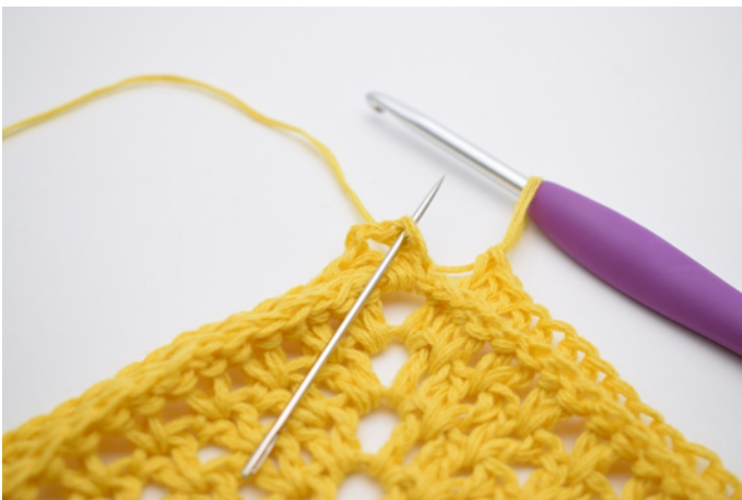
7. Finish with 1 sl st into the top of the 3 ch you started the round with.