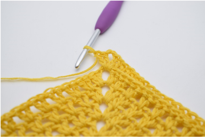
5. Dc 2, ch 2, dc 2 in the ch sp.