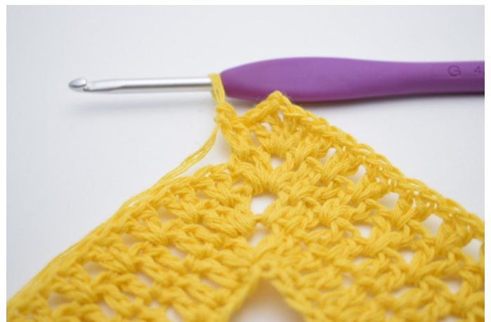
8. Like this.