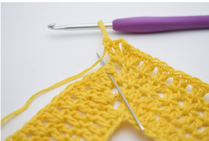
7. “Dc 2 in the space between 2 dc’s from previous round”.