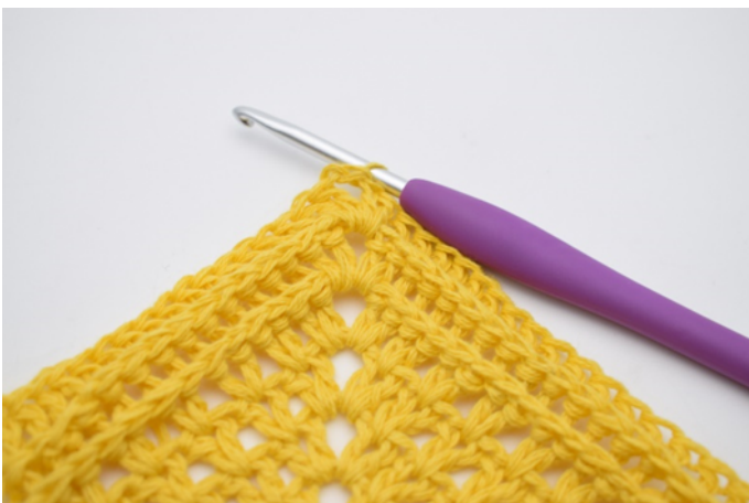
Like round 8 but with 74 (76) 80 (82) bpd on both sides.