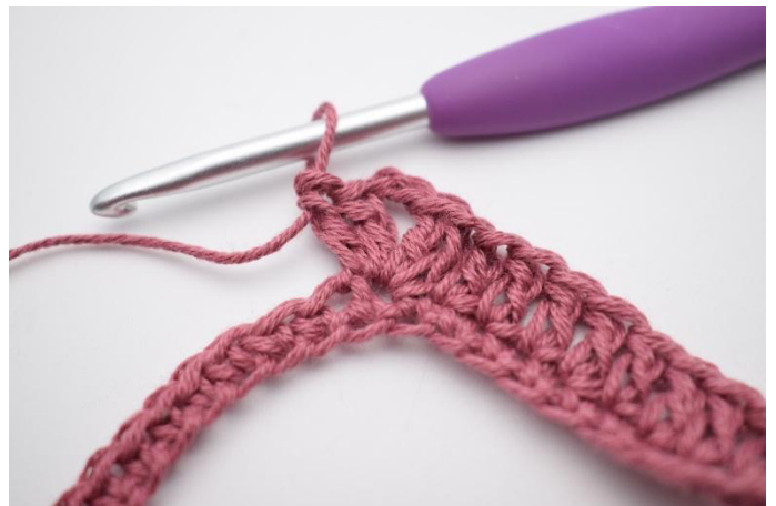
6. Like this.