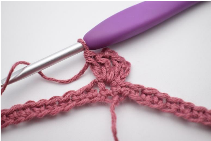
3. Like this.