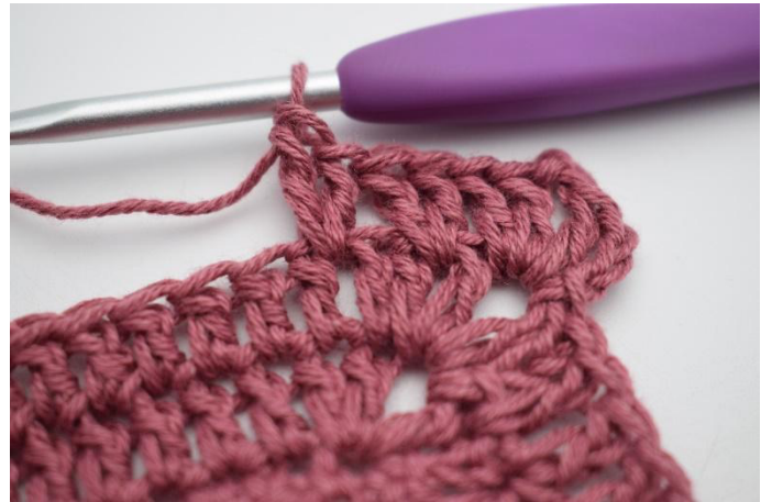
6. Like this.