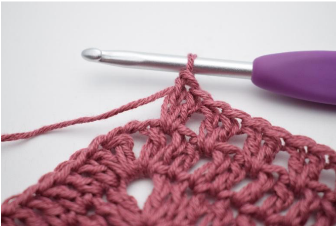
7. Repeat from " to " a total of 27 (28) 30 (31) times.