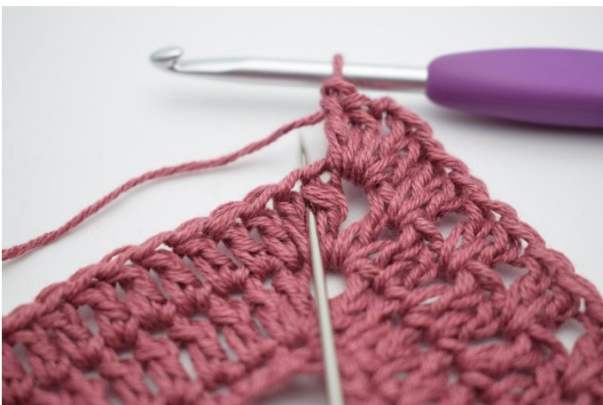
9. "Dc 2 between the next 2 dc's, miss 1 st".