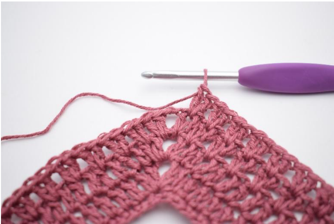
5. Repeat from “ to “ 29 (30) 32 (33) times.