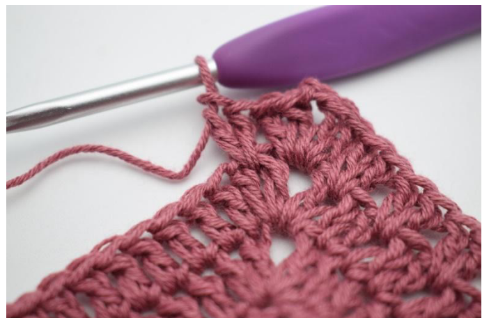
10. Like this.