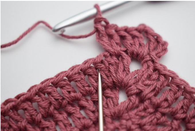
5. Miss 1 st (2 posts), "Dc 2 between the next 2 dc's, miss 1 st".