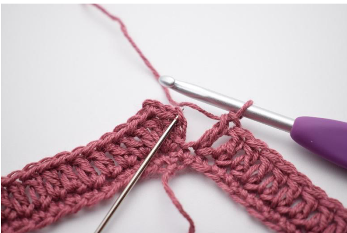
7. Dc 1 in the last 46 (48) 52 (54) st. Finish with 1 sl st into the top of the 3 ch you started the round with.