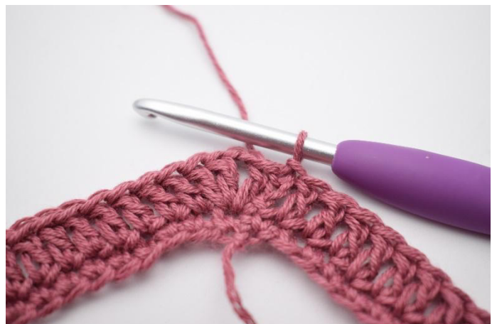
8. Like this.