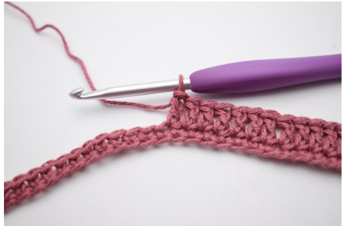
4. Dc 1 in the next 46 (48) 52 (54) st.