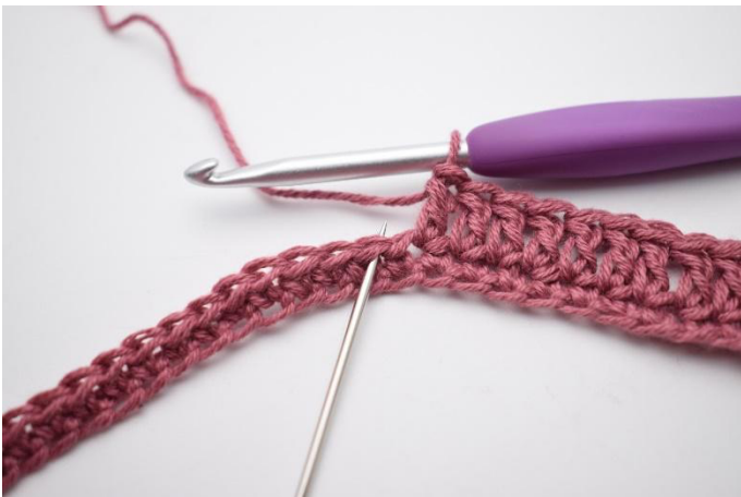
5. In next st "dc 2, ch 2, dc 2".