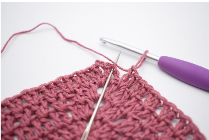
9. Repeat from “ to “ 29 (30) 32 (33) times. Finish with 1 sl st into the top of the 3 ch you started the round with.