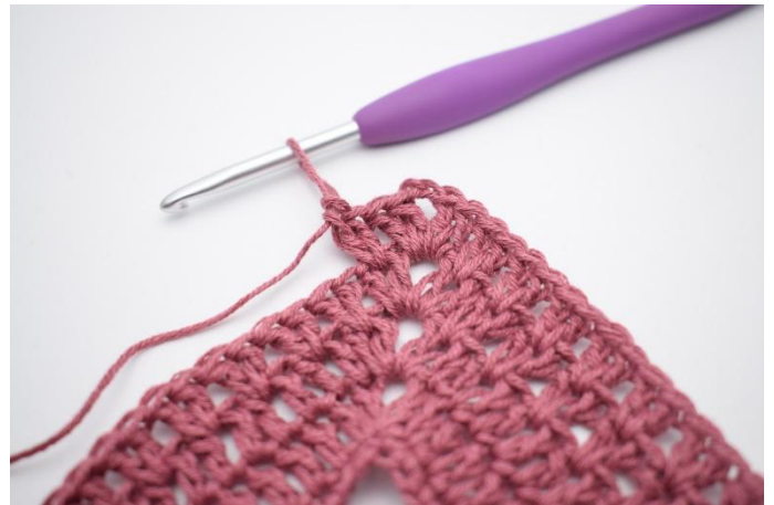
8. Like this.