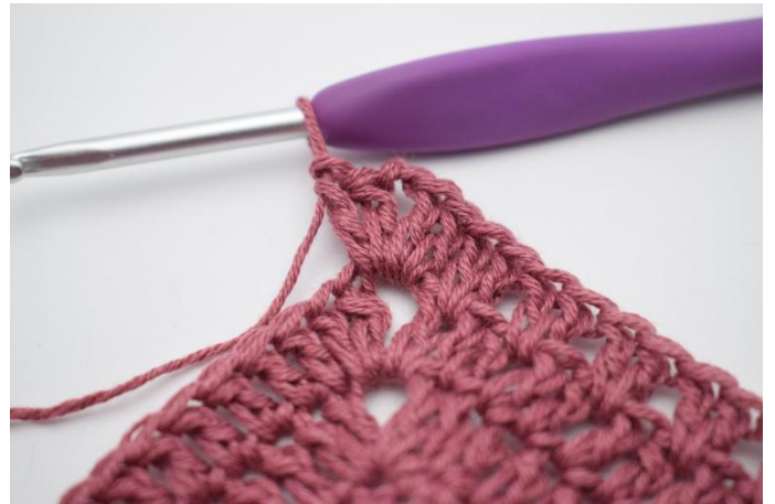
8. "Dc 2, ch 2, dc 2" in the ch sp.