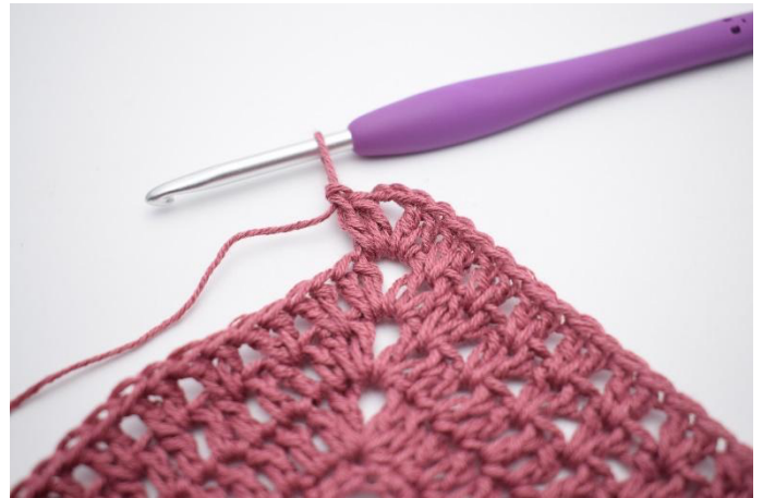
6. Dc 2, ch 2, dc 2 in the ch sp.