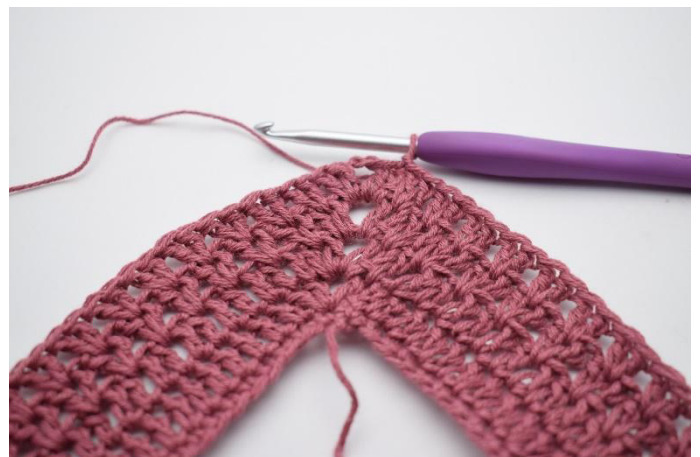
10. Like this.