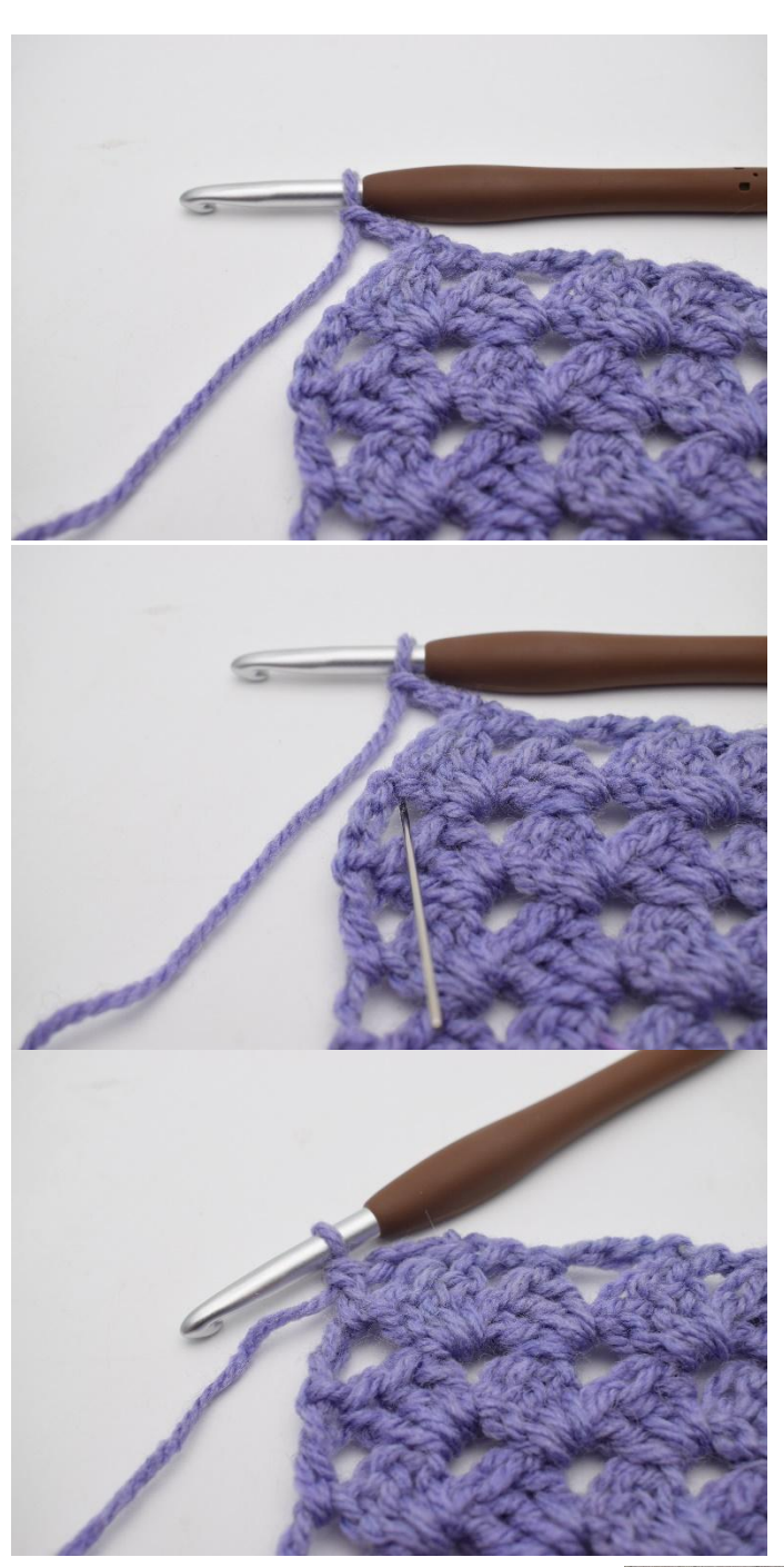
Enjoy ⊚ Best wishes Hobbii.com