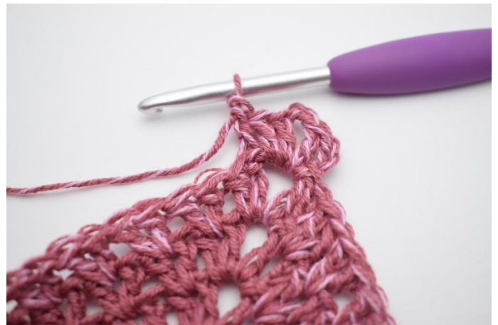
4. Like this.