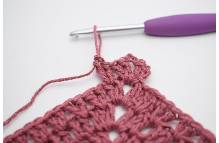
4. Like this.