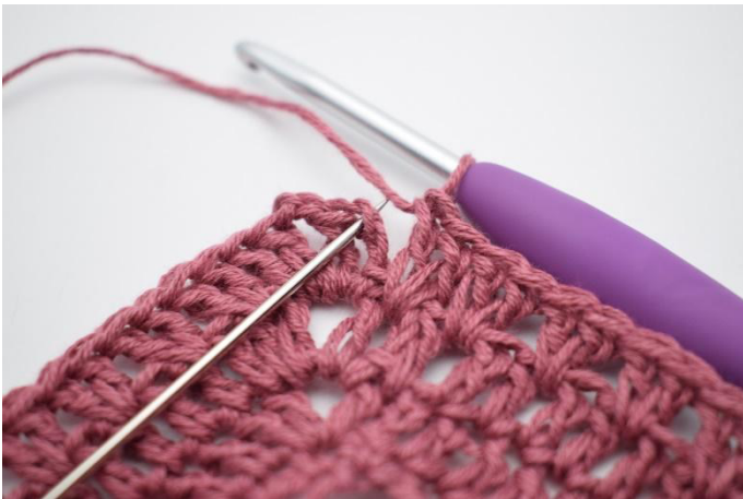
11. Repeat from " to " a total of 35 times. Finish with 1 sl st into the top of the 3 ch you started the round with.