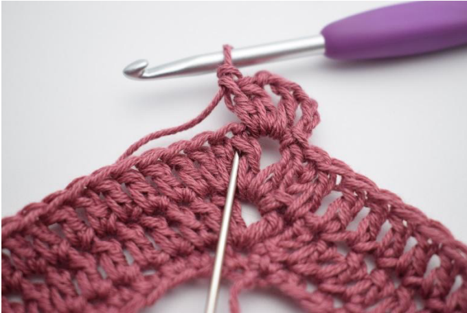
3. Dc 2 in the space between the 2 dc's from below. The needle shows where to crochet the 2 dc.