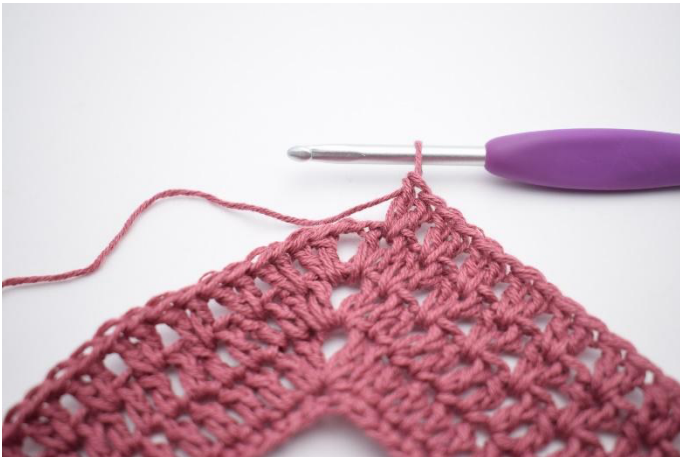
5. Repeat from " to " 37 times.