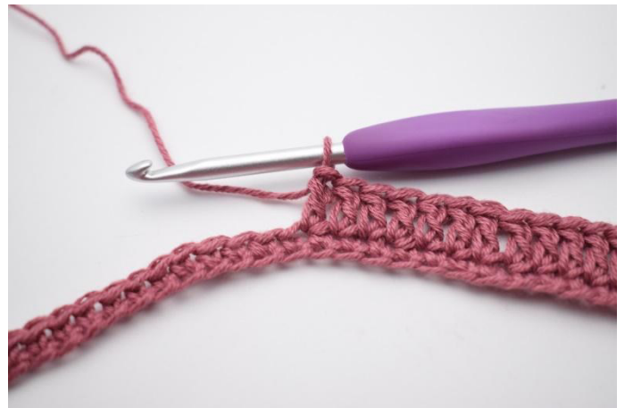
4. Dc 1 in the next 62 st.