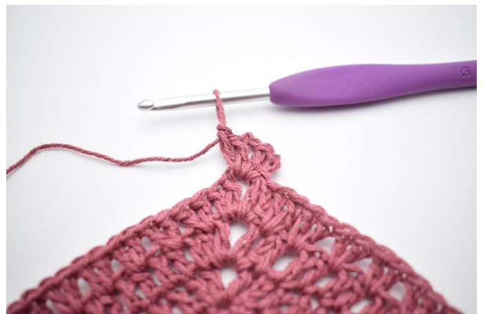
2. Ch 3 (counts as 1 dc). Dc 1, ch 2, dc 2 in the ch sp.