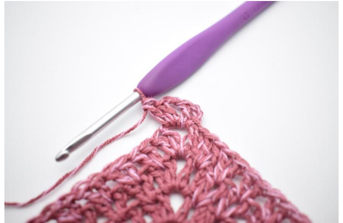
2. Ch 3 (counts as 1 dc). Dc 1, ch 2, dc 2 in the ch sp.