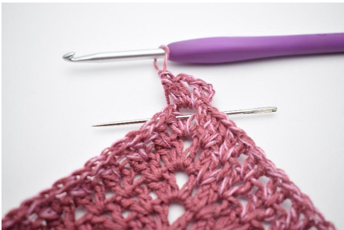
3. Now bpdcc through the next 90 st. The needle marks where you crochet through the back post.