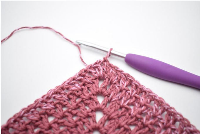
1. Sl st until you reach the ch sp.