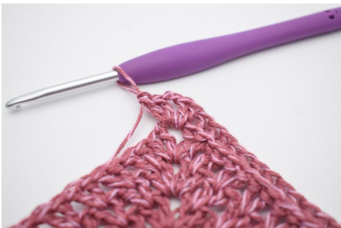
5. Dc 2, ch 2, dc 2 in the ch sp.