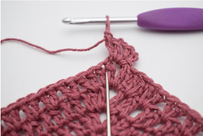
3. "Dc 2 in the space between 2 dc's from previous round".