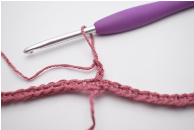
1. Ch 3 (counts as 1 dc).