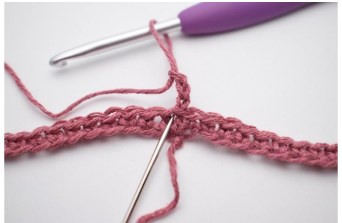
2. In the same stitch dc 1, ch 2, dc 2. The needle marks the stitch.