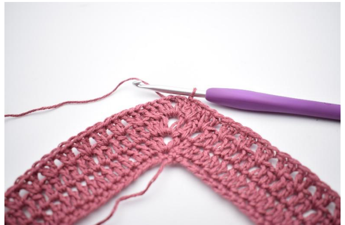
12. Like this.