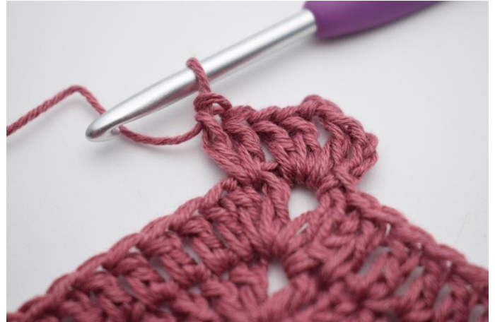
4. Like this.