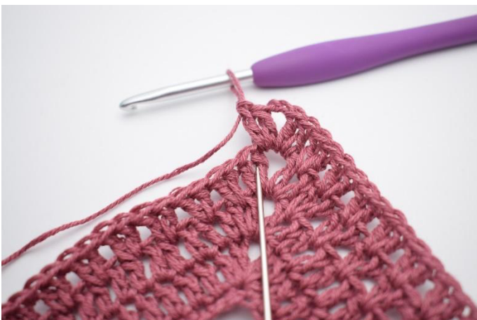
7. "Dc 2 in the space between 2 dc's from previous round".