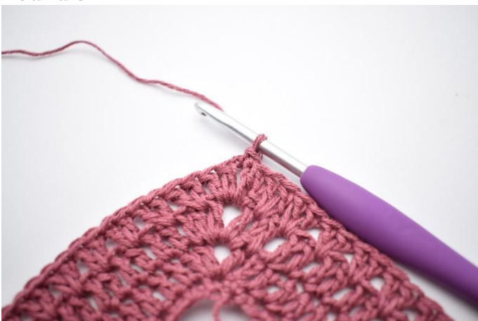
1. Sl st until you reach the ch sp.