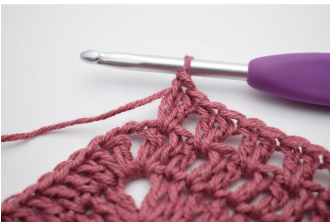
7. Repeat from " to " a total of 35 times.