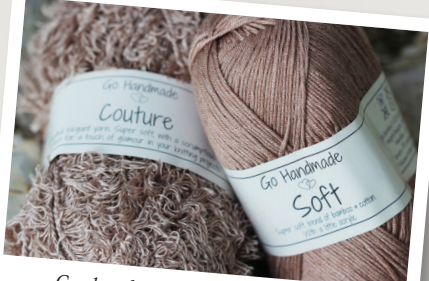
Crocheted in Go handmades Couture: 100% Acrylic, 50 g/50 m and Go handmades Soft: 70% Bamboo/23% Cotton/7% Acrylic, 50 g/180 m.

Materials: Teddy 37 cm Blanket 25 x 20 cm Pillow 15 x 13 cm Couture: 300 g So t: 150 g Hook: 3,0-4,0 mm Eyes: 14 mm Toy stu ing