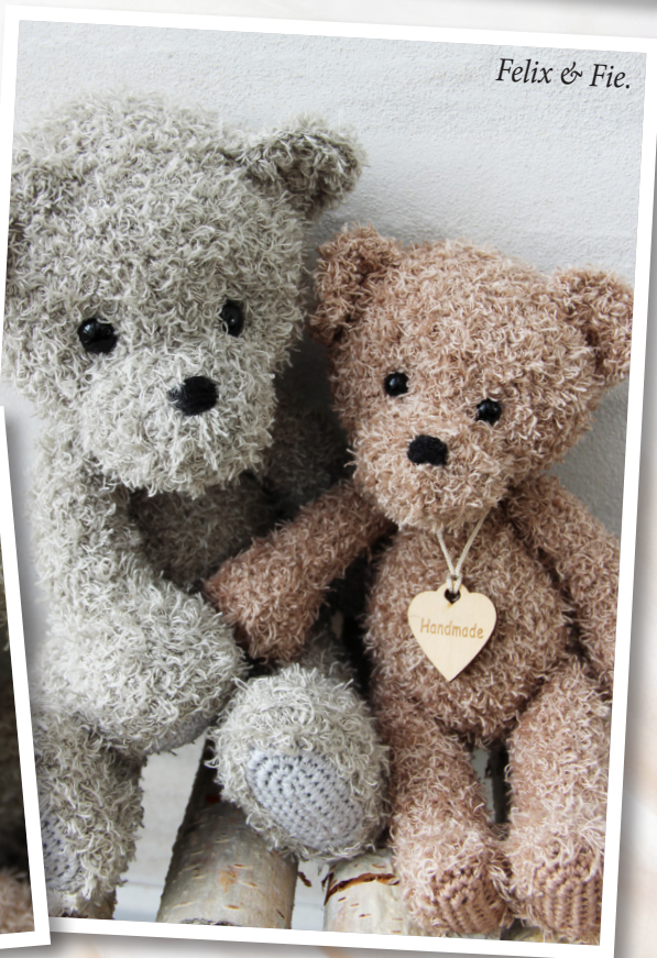
Felix & Fie.

Crocheted in Go handmades Couture: 100% Acrylic, 50 g/50 m and Go handmades Soft: 70% Bamboo/23% Cotton/7% acrylic, 50 g/180 m.