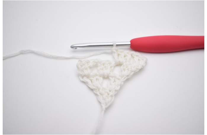
4. Ch 1, in the ch-space from the previous row, work 1 dc group.