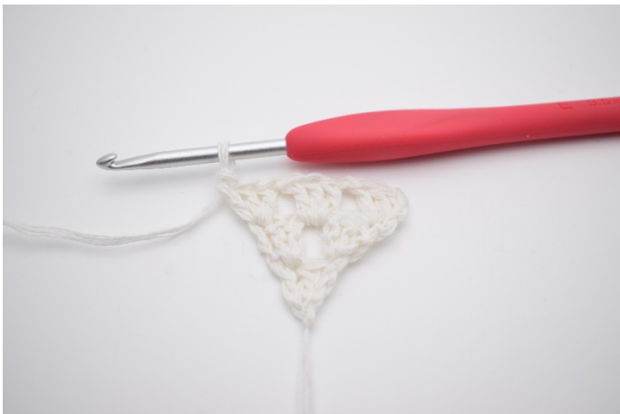
7. Work 1 dc group in the last st.