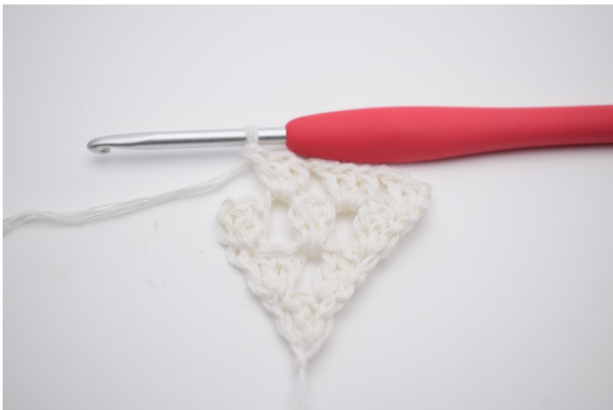
5. Ch 1, and in the next ch-space, work 1 dc group.