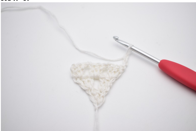
1. Turn work and ch 3 (counts as a dc)