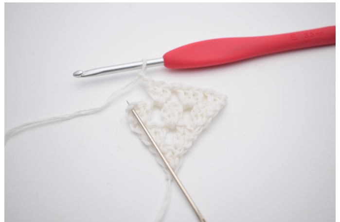
6. Ch 1. Ch 1. In the last st, (where the needle is indicating).