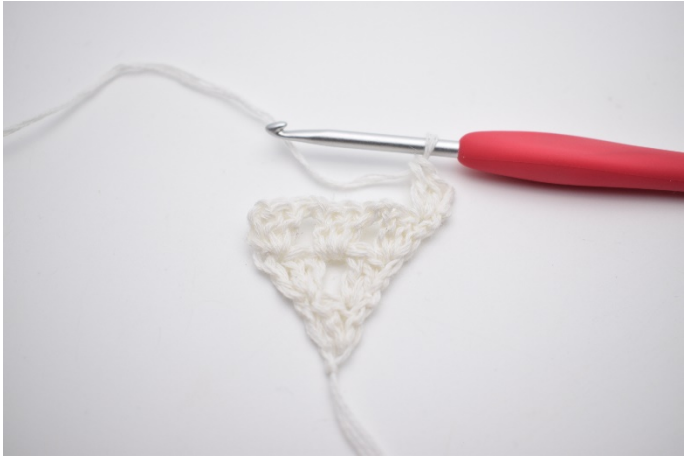
3. work 2 dc. There is now a dc group that consists of 3 dc (the 1st being the ch 3).