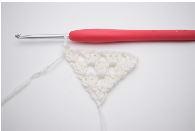
7. Work 1 dc group.