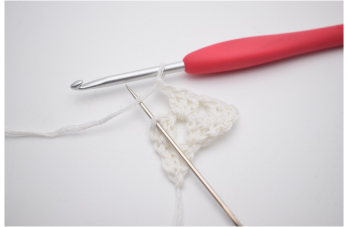
6. Ch 1. In the last st, (where the needle is indicating)