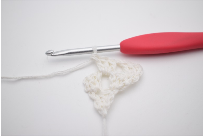
5. Work 1 dc group in the ch-space.