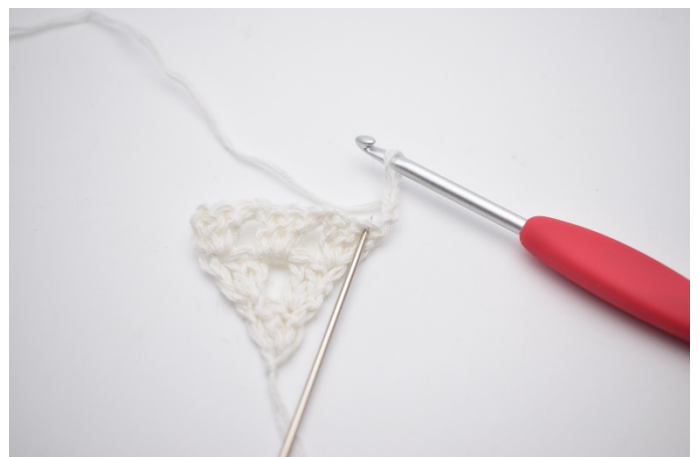
2. In the first st, (where the needle is indicating),