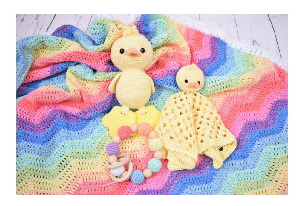
Enjoy! ☺ Best Wishes, Hobbii.com