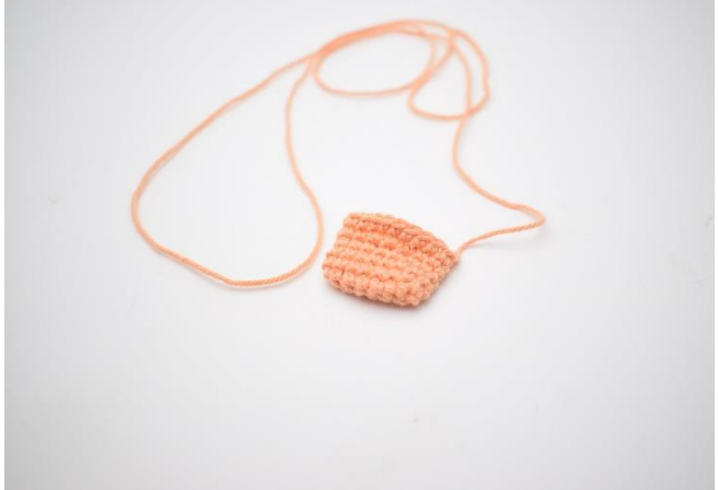
2. Now attach the beak.