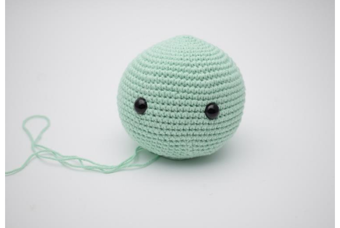
1. Insert safety eyes between rows 16 & 17 with approx. 12 sts between them.