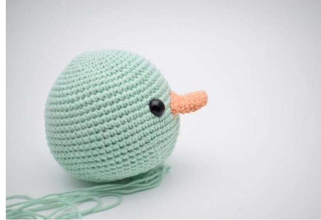
4. Like this.