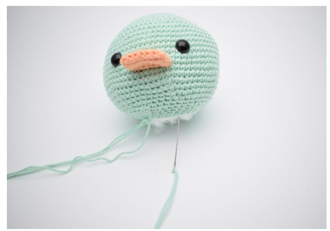
5. If you want to shape the head a bit more around the eyes, do so as follows: With Color A pull the needle up through the head,