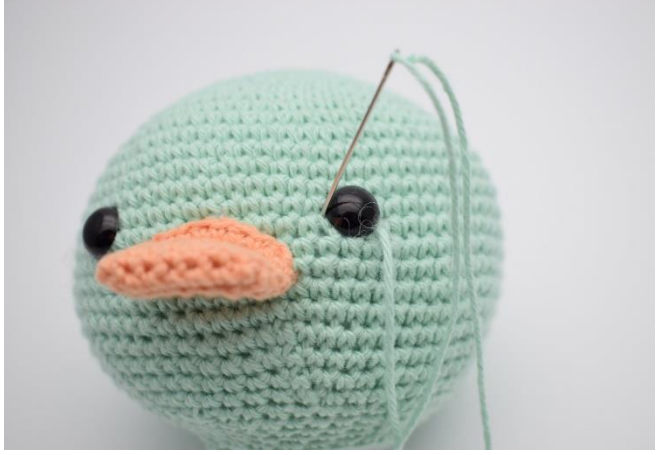
6. and come out next to the right side of one eye. Insert again on the other side of the same eye.