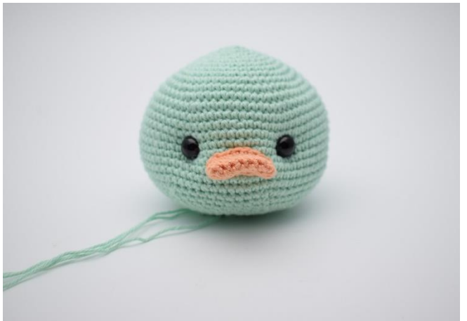
9. Like this.