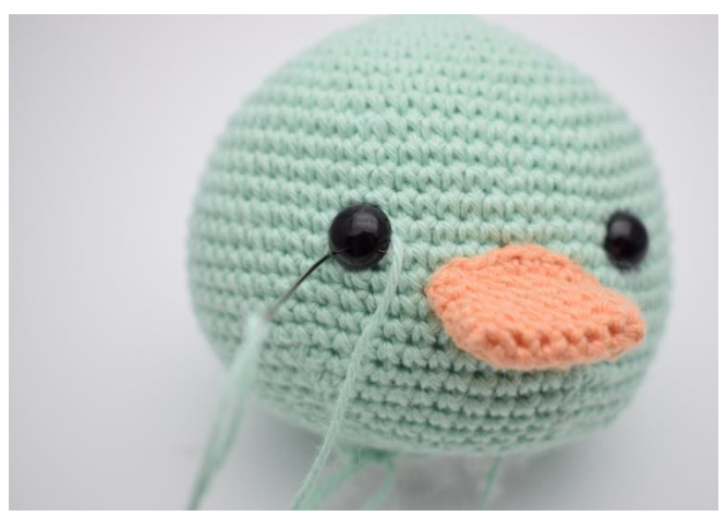
7. Bring the needle out again next to the side of the other eye. And insert it again on the opposite side of this eye.