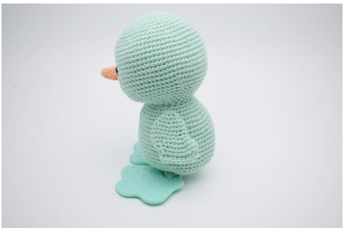
2. Sew the first wing to the body on the side, approx.. 3 rows down on the body section.