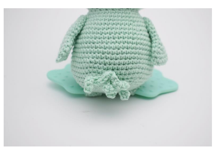
2. Also for the tail.