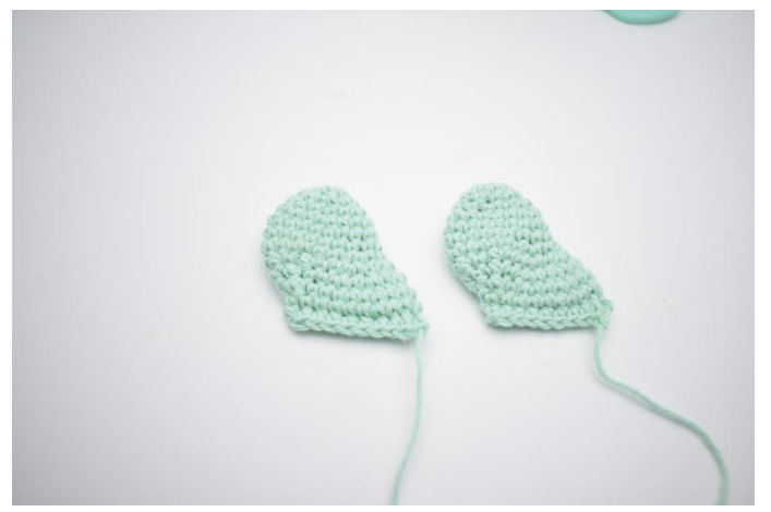
1. The wings are now ready to be attached.

Fold the wings flat and crochet the bottom edge together with sc.