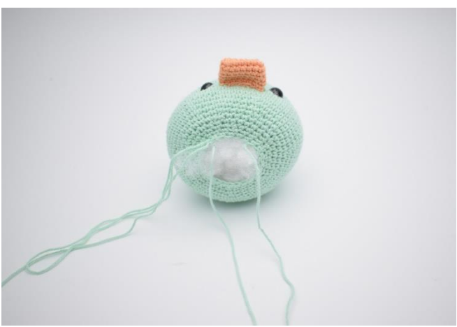
8. Pull the needle through the opening at the bottom of the head. Pull the two ends tightly until you have the shape you would like. Tie in a knot.