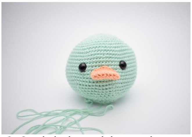
3. Sew the beak securely between the eyes and a couple of rows below.