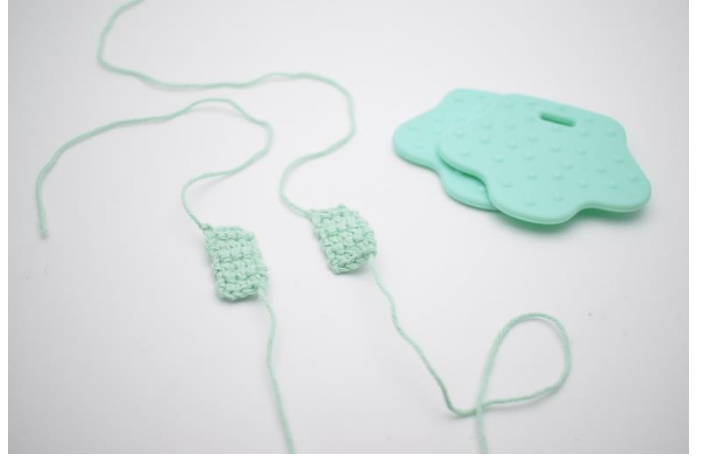
1. The feet are now ready to be attached.