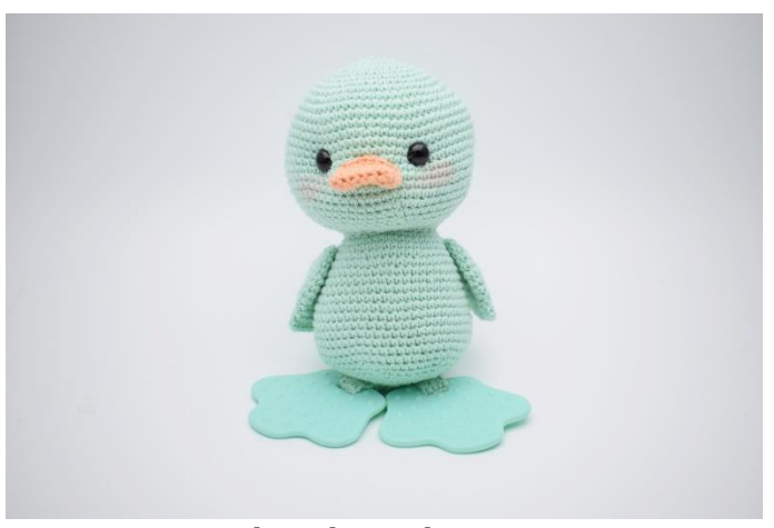
3. Repeat on the other side.