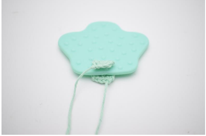
2. Pull the small strap piece through the hole and fold in half as shown in the picture.