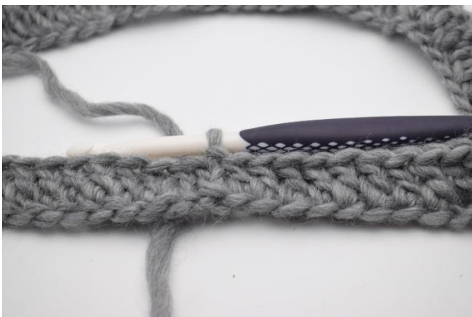
3. dc around and end with a sl st. (76)