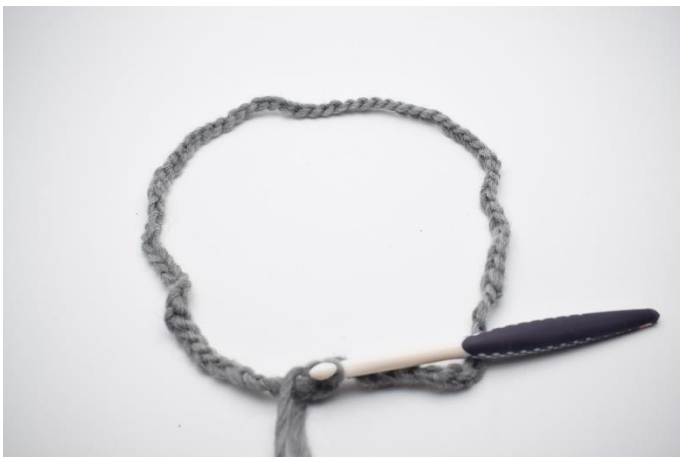
1. Start with Ch76. Join with a sl st.