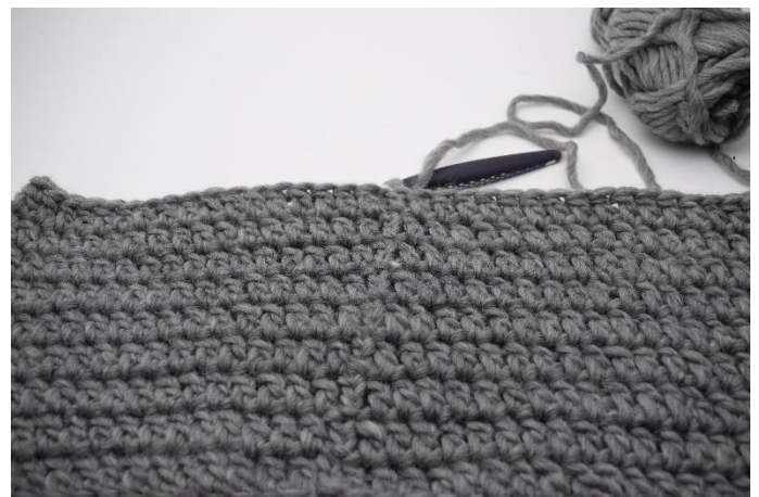
4. Repeat until you have 9 rows of dc.