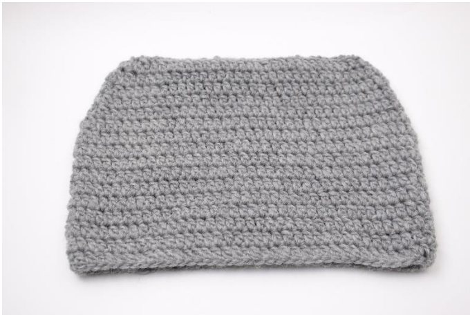
It should look like this before felting Measures approx. 17x12 in