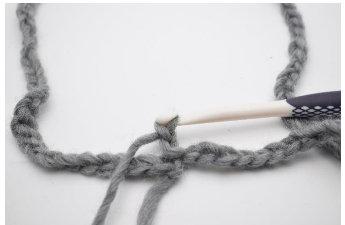
2. Ch3. This counts as one dc.