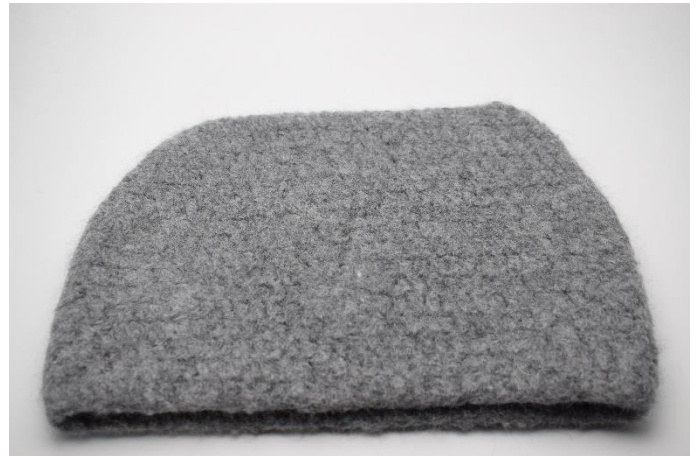
After felting. Measures approx. 13x9½ in