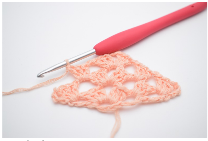
26. Like this.

24. Work 1 dc-cluster, ch 3, 1 dc-cluster.