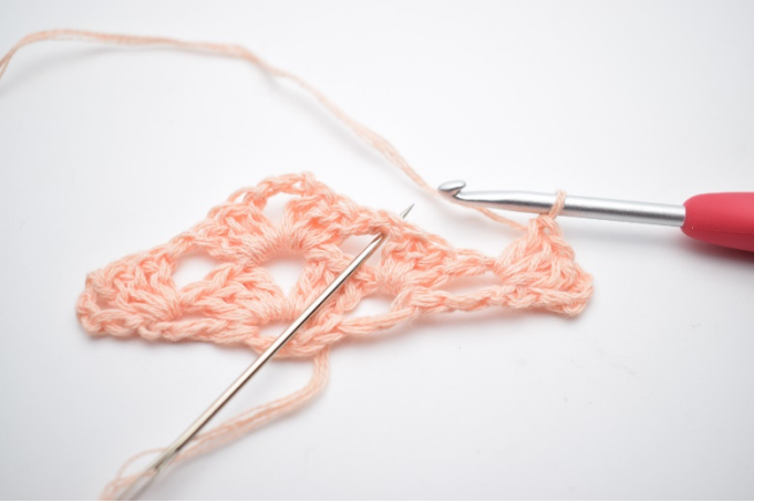
21. Ch 1. Work 1 dc-cluster in the ch-space marked by the needle.