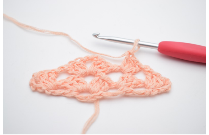
22. Ch 1.