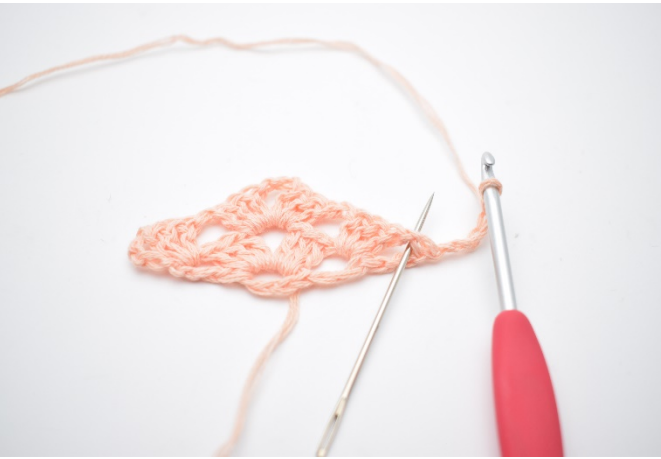
19. In the space marked by the needle in the picture: