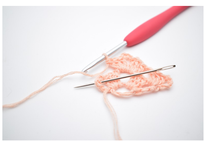
14. Ch 1. Work 1 dc-cluster in the space marked by the needle in the picture.