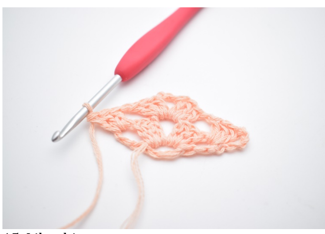
15. Like this.