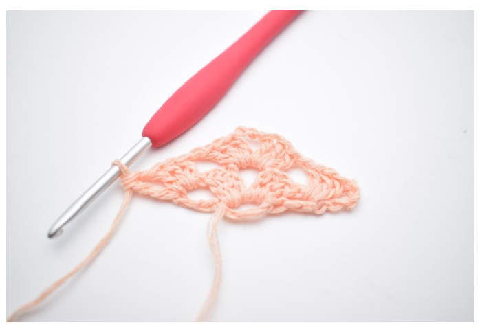
17. Like this.