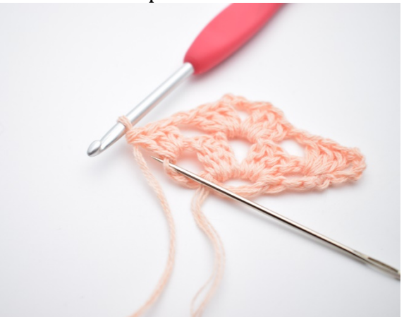
16. Ch 1, work 1 dc in the 4th ch st from the turning chain on the previous row: