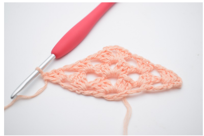
28. Like this.

27. Ch 1. Work the next dc-cluster in the space marked by the needle.