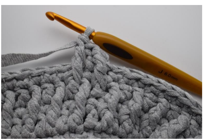
16. Like this.