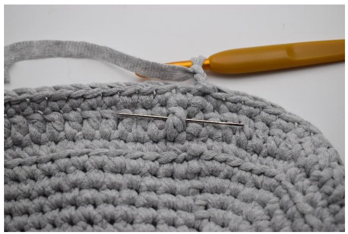
5. Fptc 1 around the next dc under the previous round. The needle here shows how to crochet around the dc from the front.