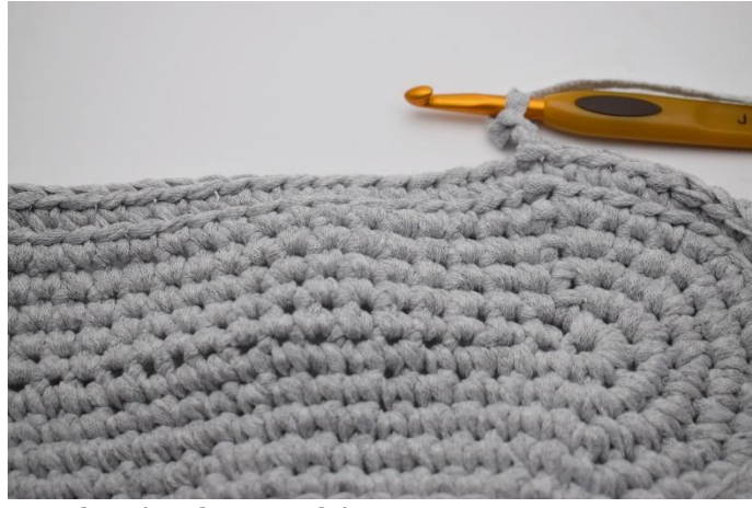
1. Ch 3 (replaces 1 dc).