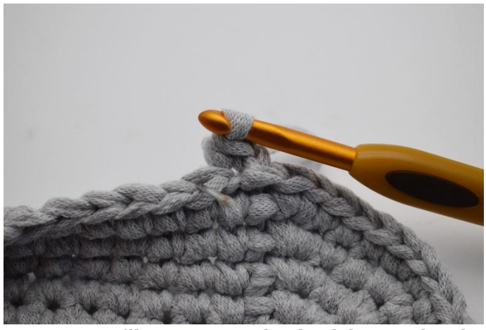
Now you'll sc one round in back loop only. Ch Sc all way round, into the loop marked here by the needle. Finish with a sl st.