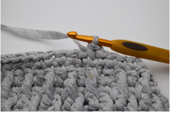
4. Crochet next sc into the following "v". The needle here shows you where to put your sc.