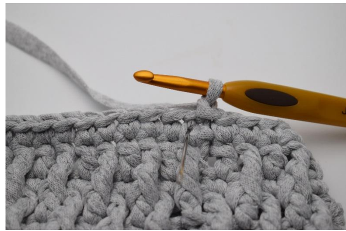
2. Now for the knit stitches. Ch 1. K st 1 into the v of the st below. The needle here shows you where to put your sc.