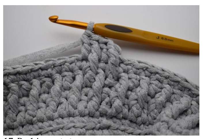
17. Dc 1 in next st.