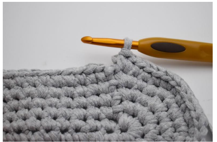
When you finish your round with a sl st, it can look like you're skipping a stitch. However, this stitch is called a fake stitch and you do not crochet into it.