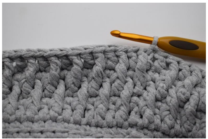
18. "Fptc 1 around the next dc under the previous round, dc 1 in next st". Repeat from " to " the remainder of the round. Finish with a sl st. Repeat these rounds as described in the pattern.

Rim: See further down in the pattern for a picture guide.