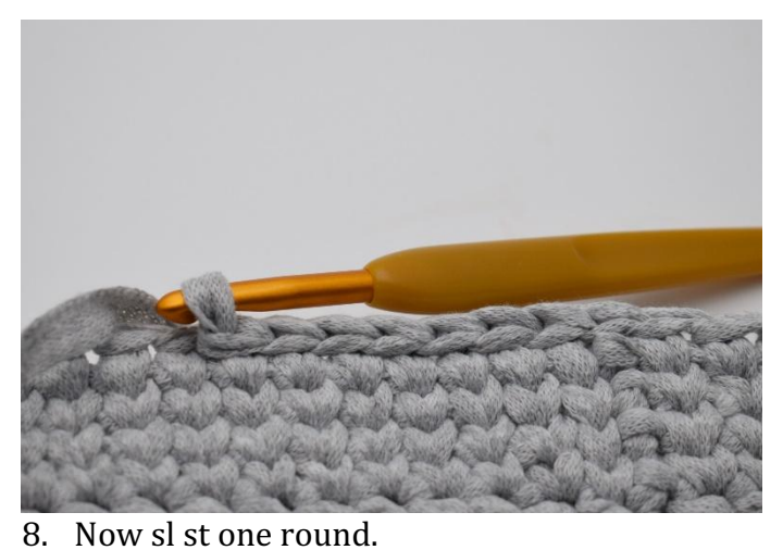
Cut the yarn and weave in the end. Your bag is now ready to have the handles attached.