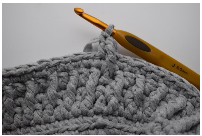
14. Dc1 in next st.