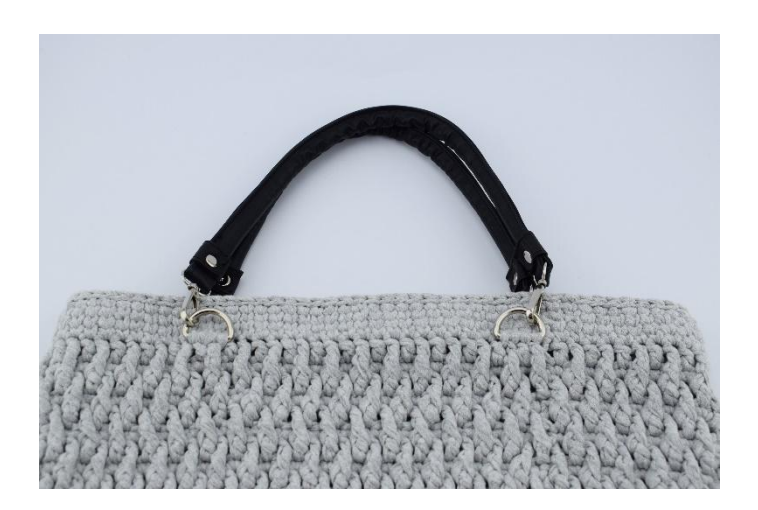
Enjoy© Best wishes Hobbii.com