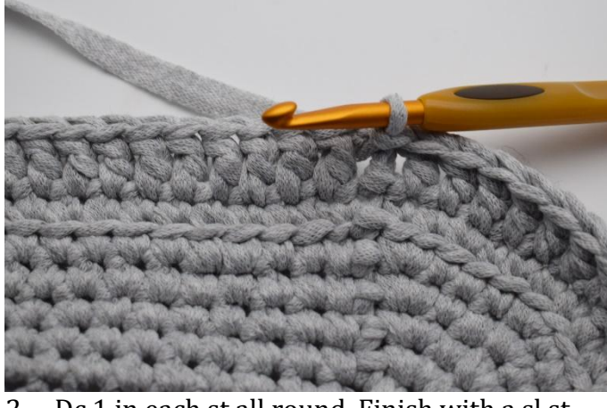
Dc 1 in each st all round. Finish with a sl st.