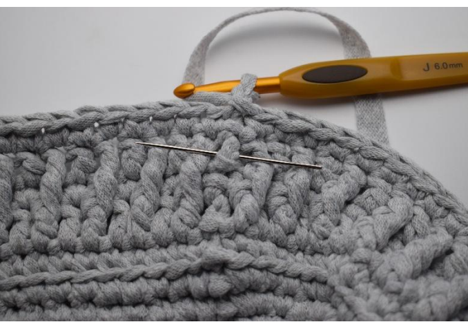
12. Ch 1. Fptc 1 around the next dc under the previous round. The needle here shows how to crochet around the dc from the front.