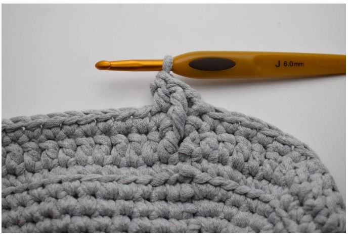
7. Dc 1 in next st.