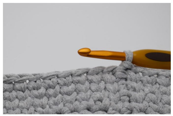
Repeat the round until you have a total of 3 k st rounds.