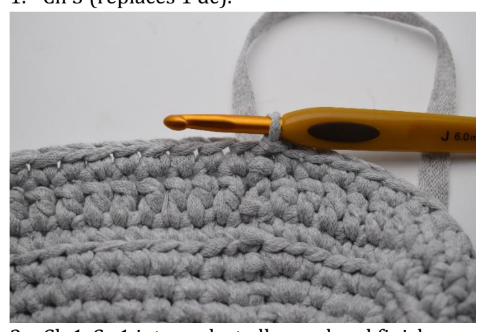
Ch 1. Sc 1 into each st all round and finish with a sl st.