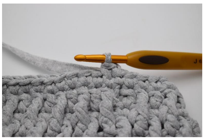
3. We've now made the first knit stitch.