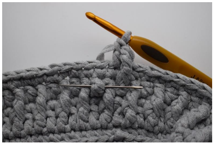
15. Fptc 1 around the next dc under the previous round. The needle here shows how to crochet around the dc from the front.