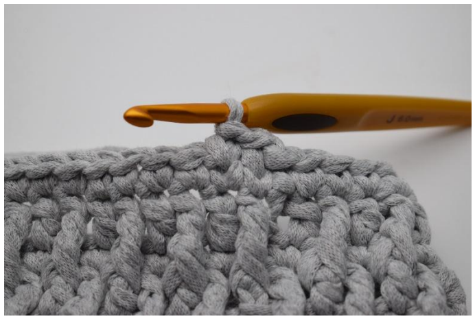
5. We've now crocheted another knit stitch.