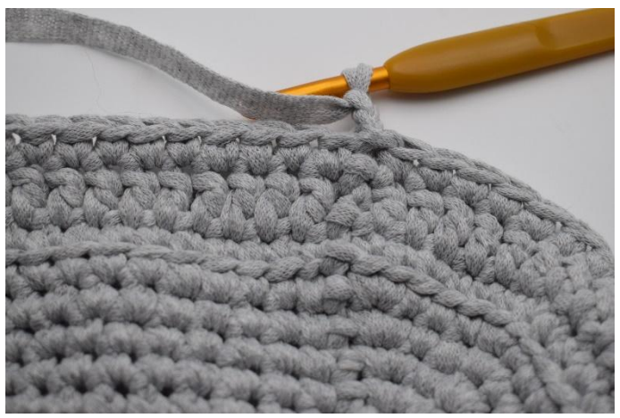
4. Ch 3 (replaces 1 dc).