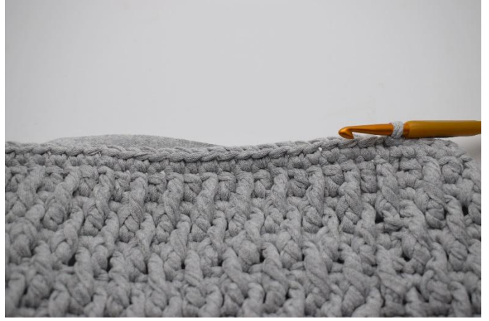
1. Ch 1 (replaces 1 sc). Sc 1 in same st, sc 1 in each st all round and finish with a sl st. (92)