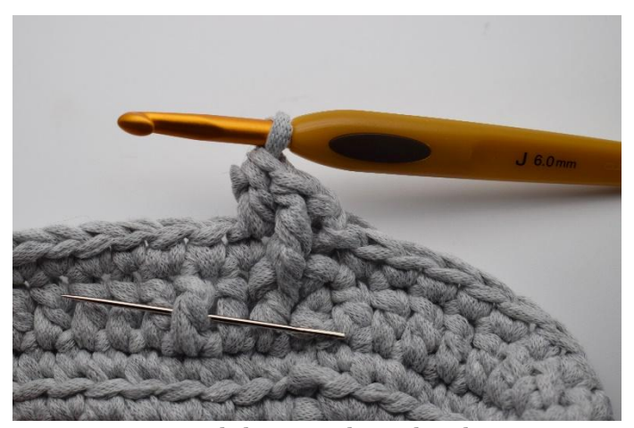
8. Fptc 1 around the next dc under the previous round. The needle here shows how to crochet around the dc from the front.