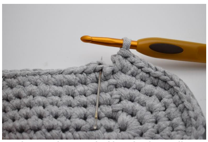
2. Sl st into the st marked here by the needle.