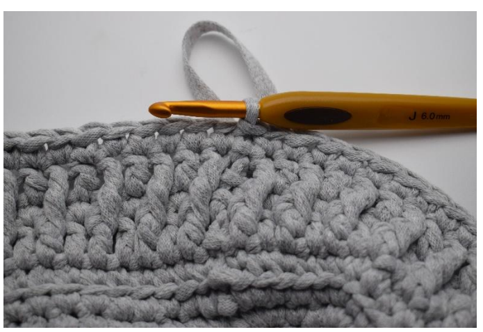
11. Dc 1 in each st all round. Finish with a sl st.