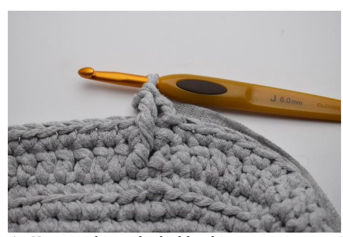
6. Your work now looks like this.