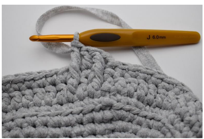
9. Like this.