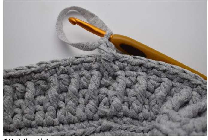
13. Like this