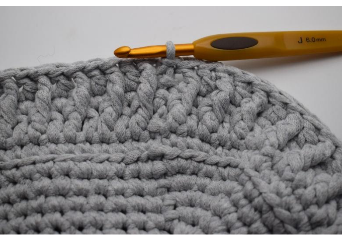
10. "Dc 1 in next st, fptc 1 around the next dc under the previous round". Repeat from " to " the remainder of the round. Finish with a sl st.