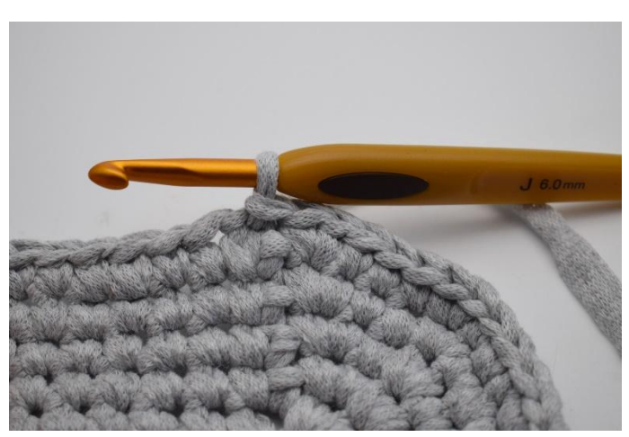
3. Your joint will look like this.