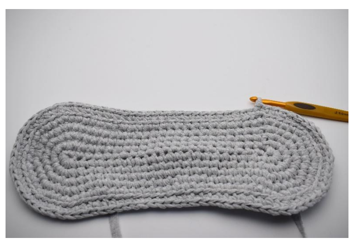
2. Your work will look like this.