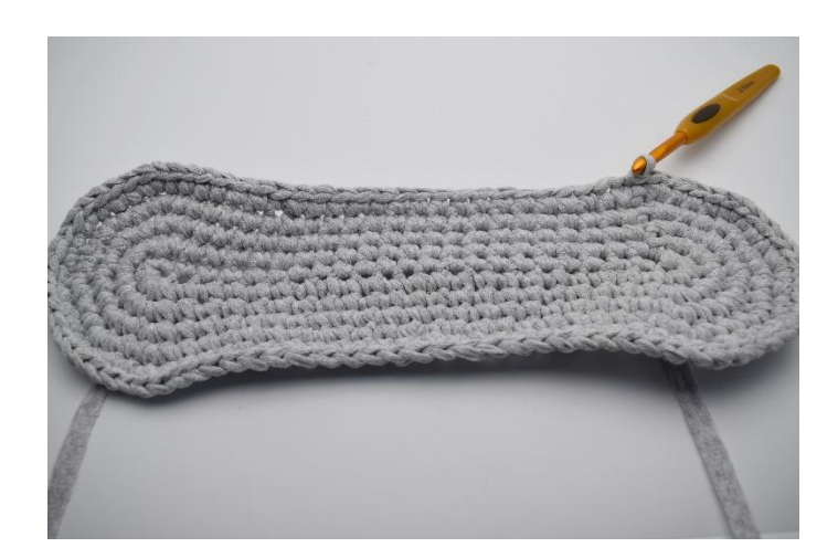
7. Ch 1. Now you'll sc in blo all round, finish with a sl st. (92)