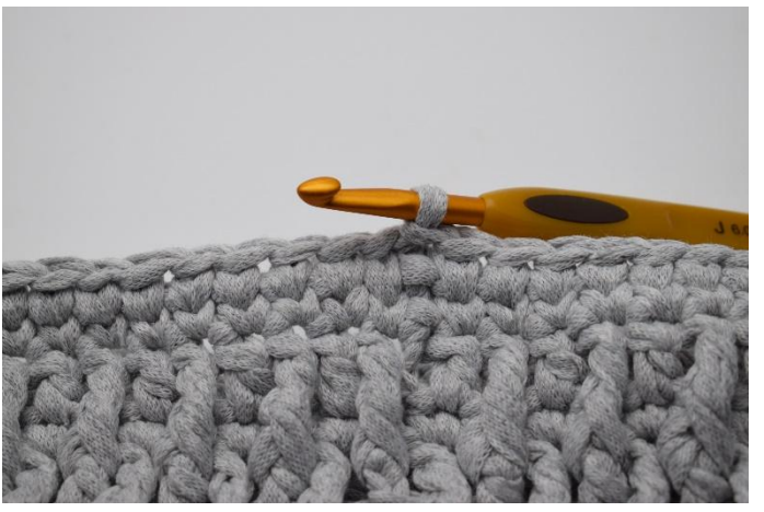
6. Now K st all round and finish with a sl st.