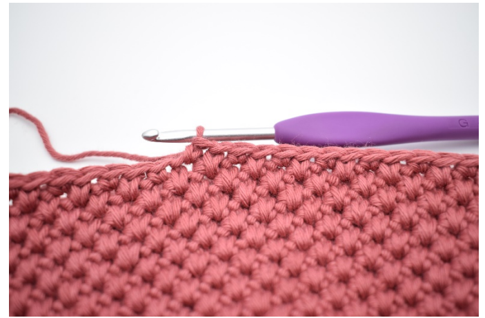
Work alternately 1 lsc and 1 sc in the next 16 2. Work sl sts in the next 18 sts. 1. sts.

1. Work alternately 1 lsc and 1 sc in the next 16 sts. Work sl sts in the next 18 sts. Now work alternately 1 lsc and 1 sc in the next 33 sts (work 1 lsc in last st). Work sl sts in the following 18 sts. Work alternately sc and lsc in the last 16 sts.