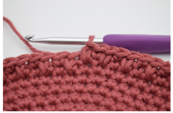
9. Repeat around and finish with 1 lsc.