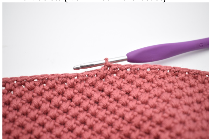
5. Work alternately sc and lsc in the last 16 sts.

2. Work alternately 1 sc and 1 lsc in the next 16 sts. Ch 18 and skip the 18 sl sts. Now work alternately 1 sc and 1 lsc in the next 33 sts (work 1 sc in the last st). Ch 18 and skip the 18 sl sts. Work alternately lsc and sc in the last 16 sts.