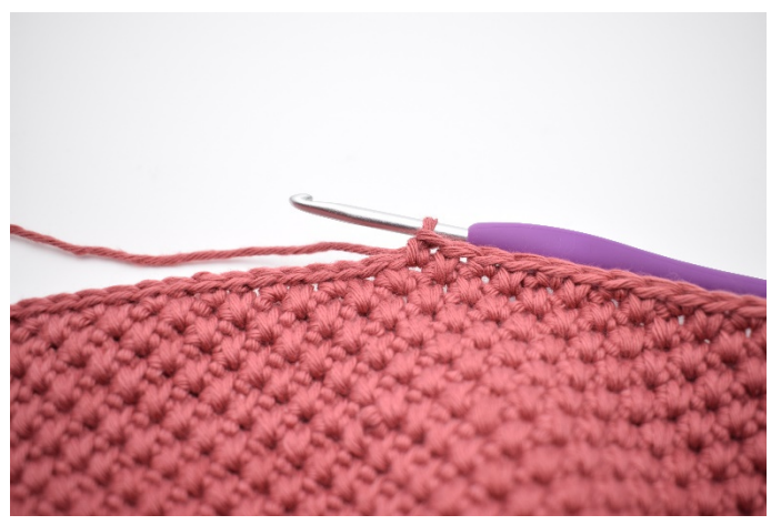
4. Now work alternately 1 sc and 1 lsc in the next 33 sts (Work 1 sc in the last st).