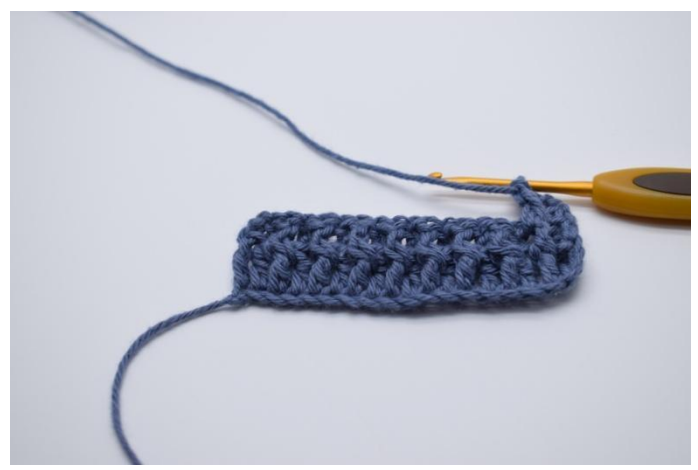
11. Fpdc 1 around the next post.