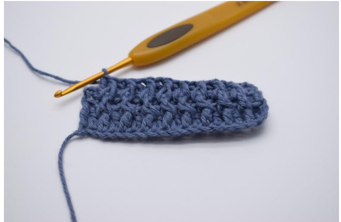
12. Now alternate bpdc 1 and fpdc 1 until the end of the row. In the turning st, dc 1. Repeat these rows until you reach the desired size.