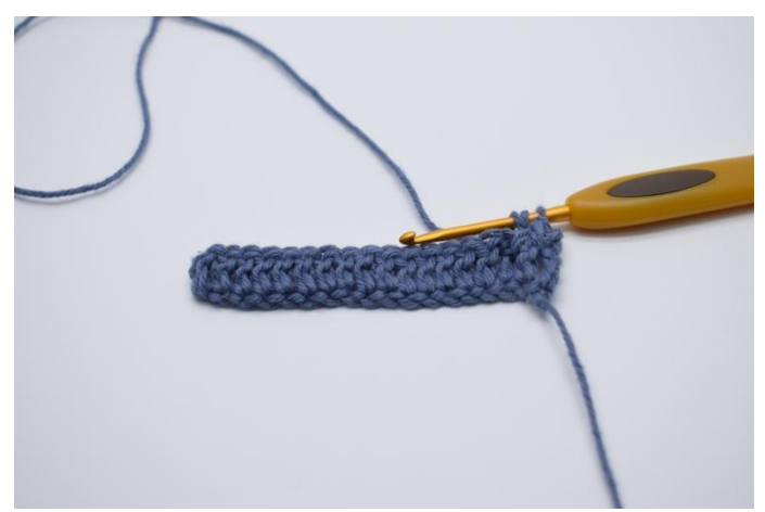
6. Yarn over and insert the hook at the back of the post, yarn over and pull through like a normal dc.