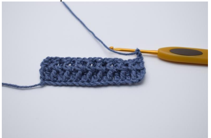
9. Ch 2 and turn. They replace the 1st regular dc.