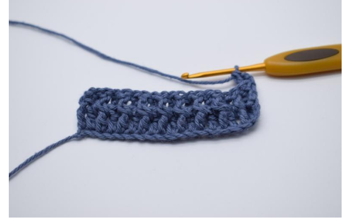
10. Now bpdc 1 in the post from the previous row.