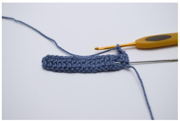
5. Now we'll make a bpdc around the post of the next dc of the previous row. The needle shows how to insert the hook at the back of the post.

3. Yarn over and insert the hook at the front of the post, yarn over and pull through like a normal dc.