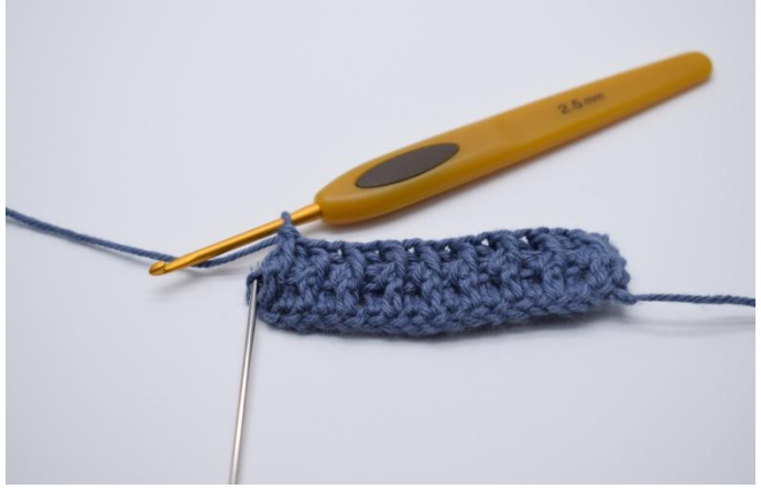
8. Now alternate fpdc 1 and bpdc 1 until the end of the row. In the turning st, dc 1.