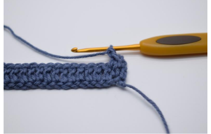
4. Yarn over and finish your dc as normal. You've now made 1 fpdc.