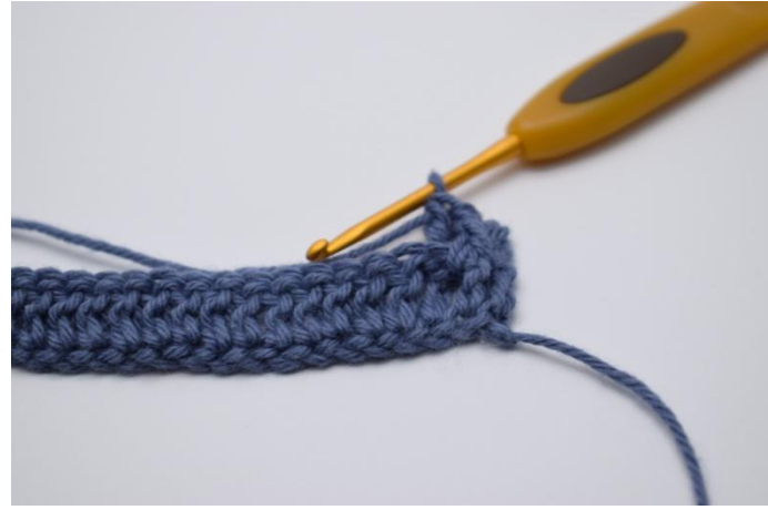
7. Yarn over and finish your dc as normal. You've now made 1 bpdc.