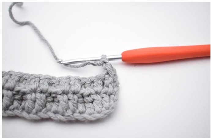
3. You've now worked 1 fpdc.