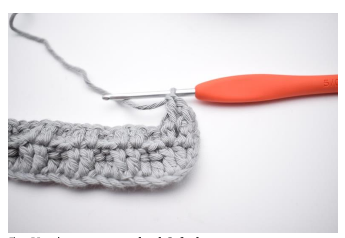
5. You've now worked 2 fpdcs.