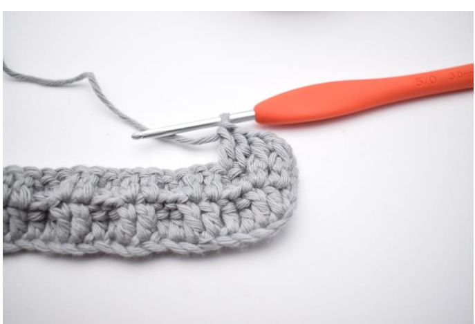
6. Work 1 regular dc in the next 2 sts.