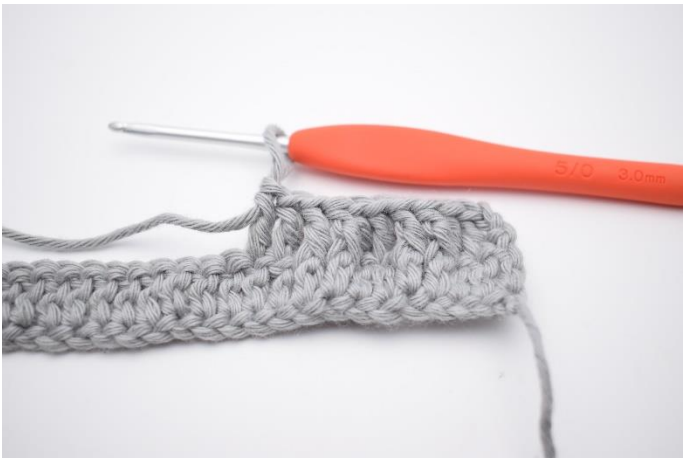
9. Work "2 fpdc, 2 dc".