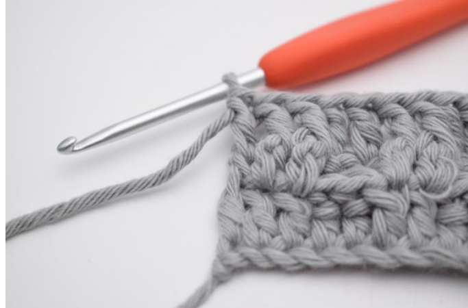
9. Repeat "to" across.