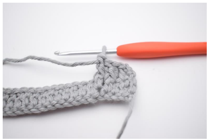
7. You've now worked 2 fpdcs.