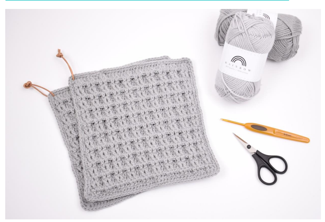
Happy crocheting © Kind regards, Hobbii