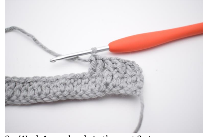
8. Work 1 regular dc in the next 2 sts.