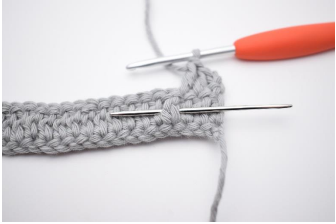
4. Now work 1 fpdc around the next st. The needle marks how your hook goes around the dc post from the front.