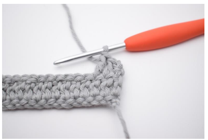
3. Like this.