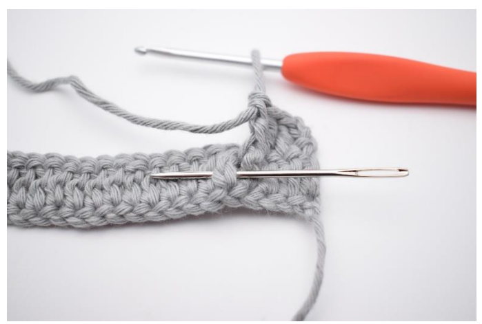
6. Work 1 fpdc around the next st. The needle marks how your hook goes around the dc post from the front.