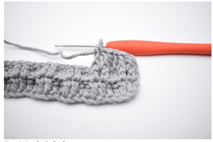
7. Work 2 fpdc.