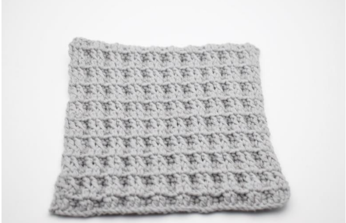
Repeat alternately rows 3 and 4 like this as described in the pattern.