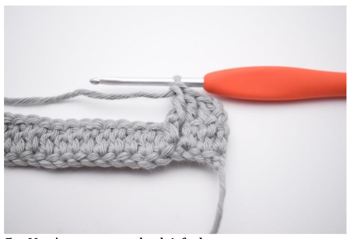
5. You've now worked 1 fpdc.