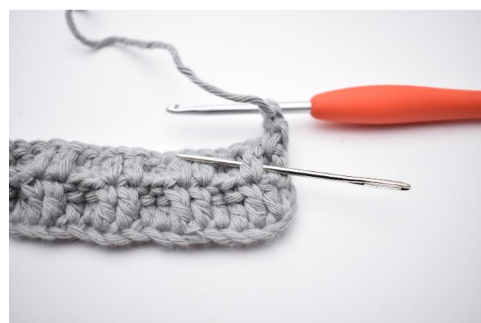
4. Work 1 more fpdc. The needle marks how your hook goes around the dc post from the front.