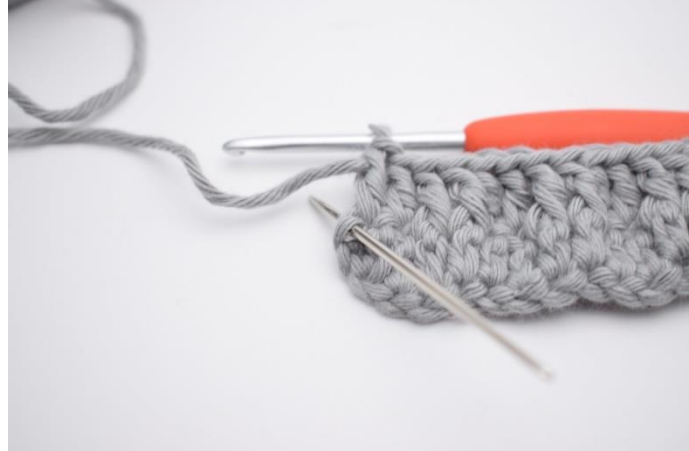
11. Finish the row with 1 dc in the last st.