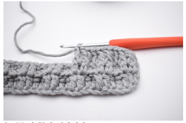
8. Work "2 dc, 2 fpdc".