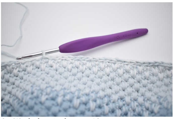
2. Work sl sts in the next 18 sts.