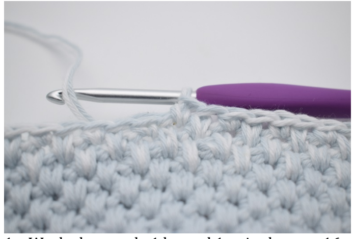
Work alternately 1 lsc and 1 sc in the next 16 sts.