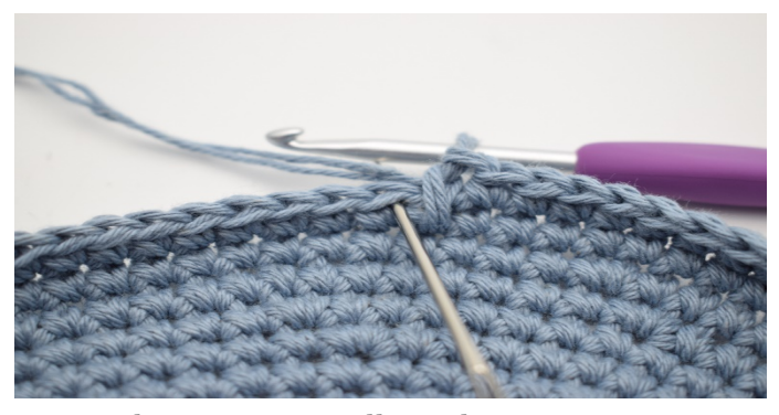
3. Work 1 sc as normally in the next st.