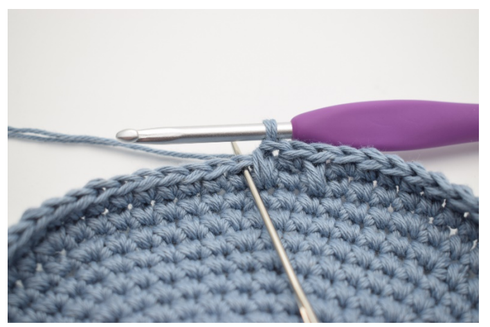
7. Work 1 sc as normally in the next st.