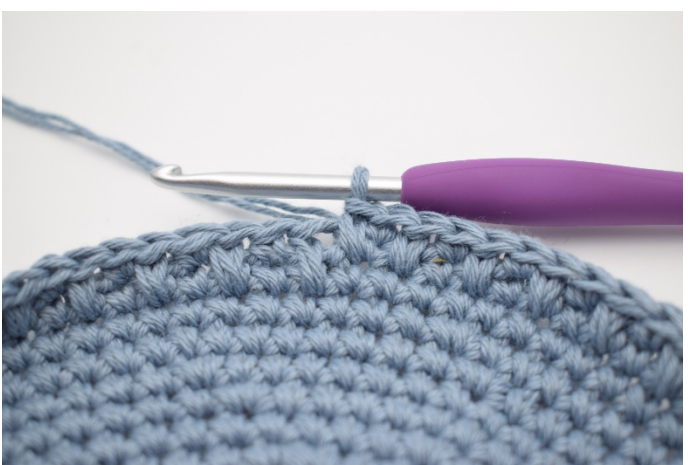
9. Repeat around and finish with 1 lsc.