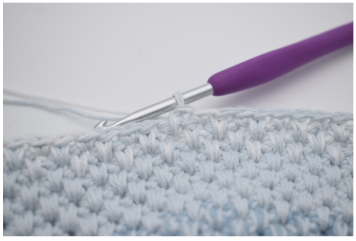
3. Now work alternately 1 lsc and 1 sc in the next 33 sts (Work 1 lsc in last st).