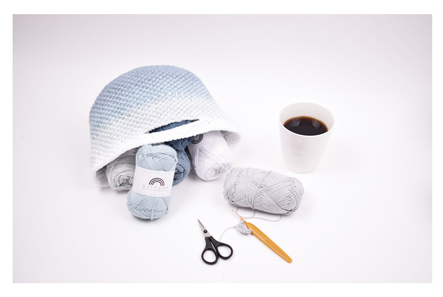
Happy crocheting ©