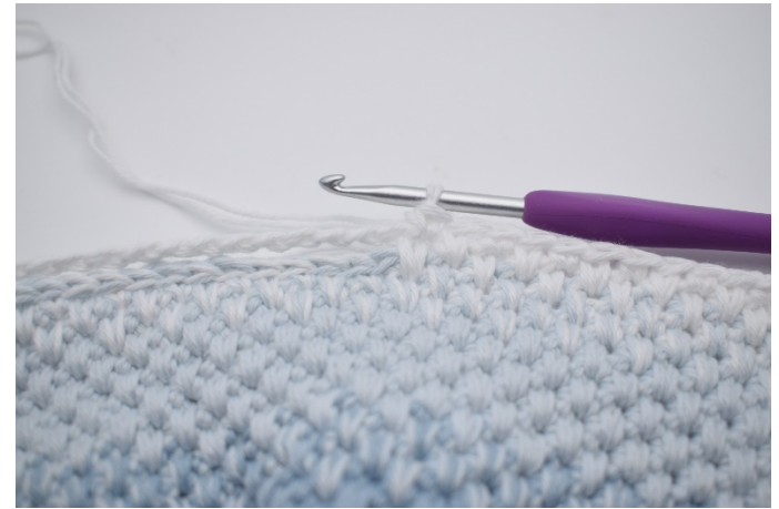
1. Work alternately lsc and sc to the 18 ch.