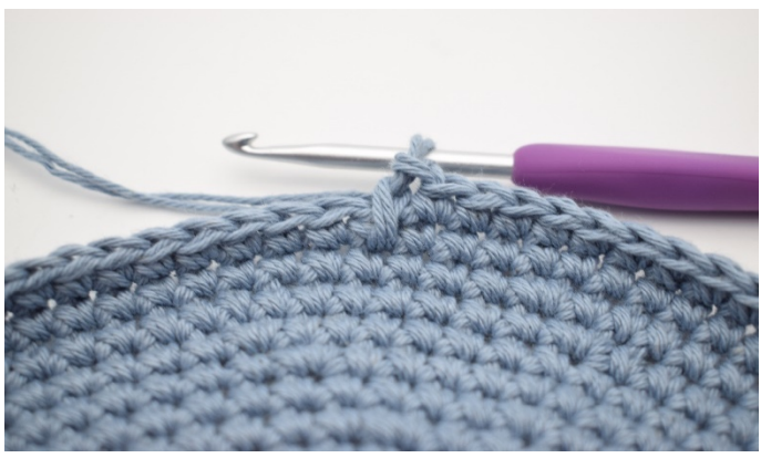
2. Like this. You've now made 1 lsc.