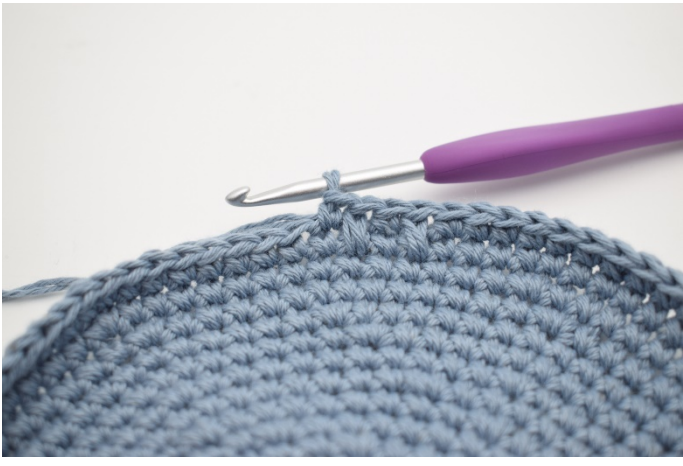
8. Like this. This is repeated around.