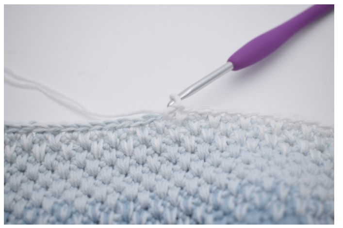
4. Now work alternately 1 sc and 1 lsc in the next 33 sts (work 1 sc in last st).