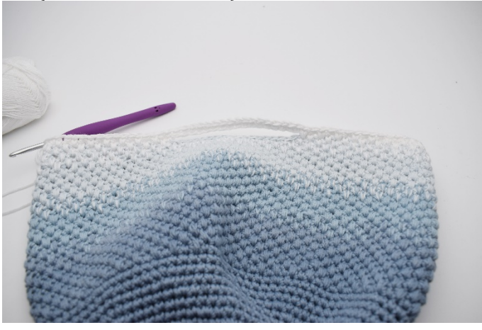
5. Work alternately sc and lsc in the last 16 sts.