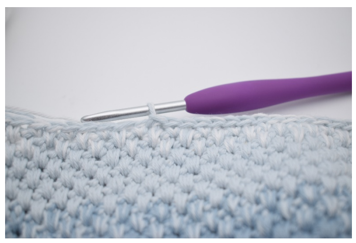
4. Work sl sts in the following 18 sts.