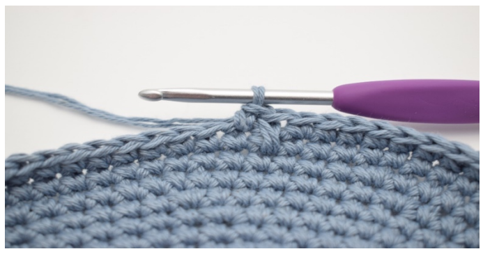
4. Like this.