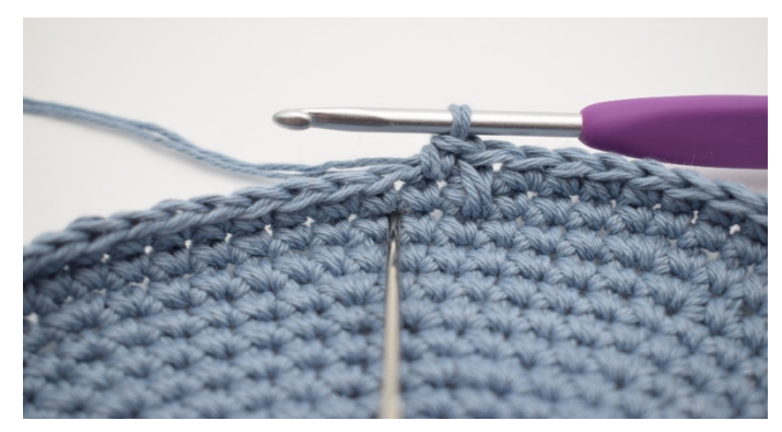
5. Next st is another lsc. It is made like a normal sc but in the st below. (The needle here marks where your lsc should be made)