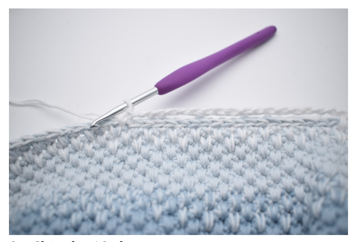
3. Skip the 18 sl sts.