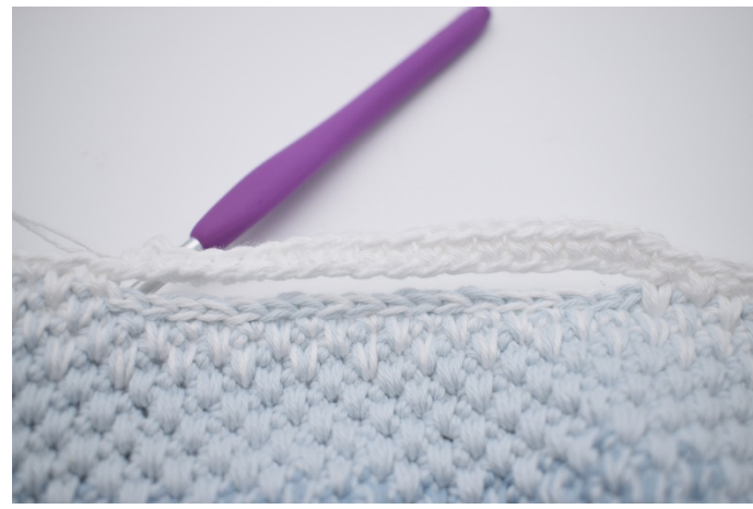
2. Work 1 sc in each ch.