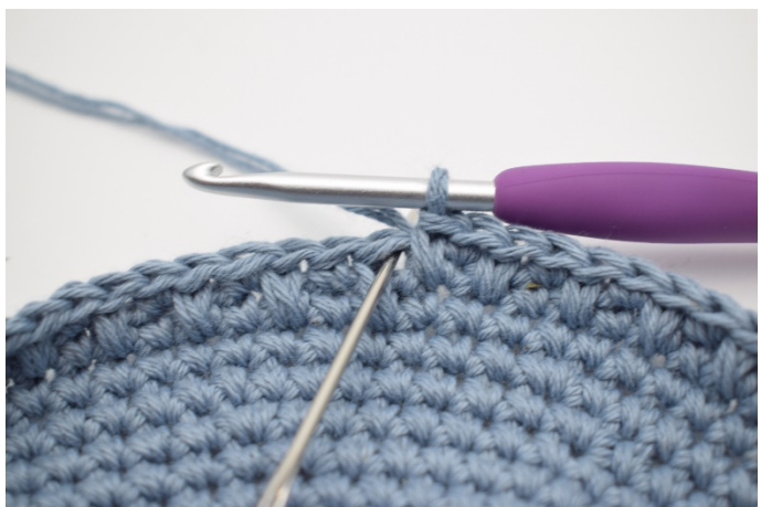
10. When making the next round, work opposite, so you start the round with 1 sc, followed by 1 lsc. Meaning that you work sc in lsc from previous round and lsc in sc from previous round. Repeat the 2 rounds like this as described in the pattern.