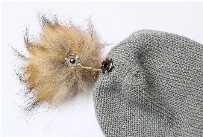
Photo Tutorial - Pompom

3. CO 75 sts. Turn and bind off all sts. Pull the end tight and attach to the hat by the points covering the ears.