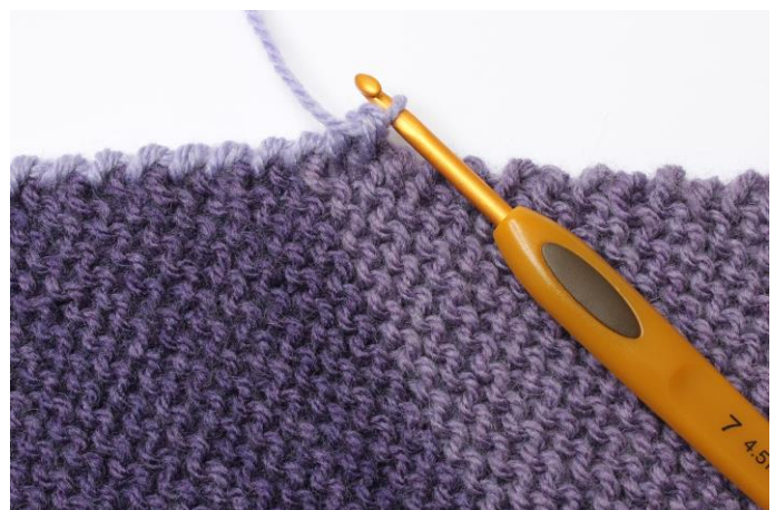
4. one crab stitch completed. Repeat from photo 1.