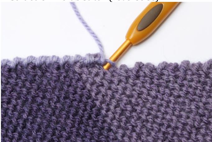
1. Insert hook in edge between 2 ridges,