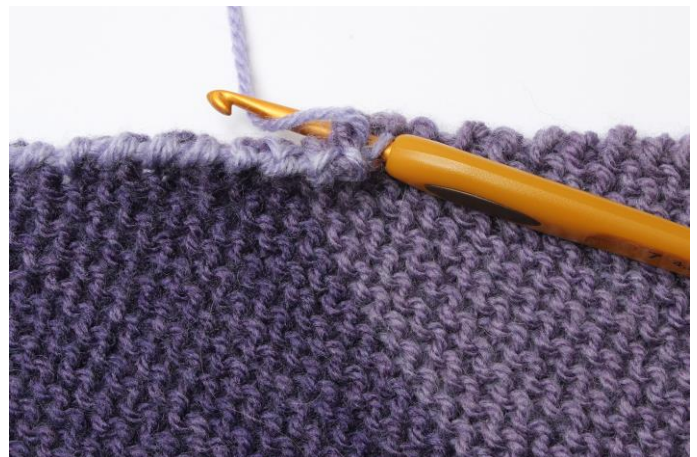
2. yo and pull yarn through stitch = 2 loops on hook