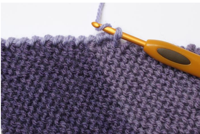
3. yo and pull yarn through both loops on hook,