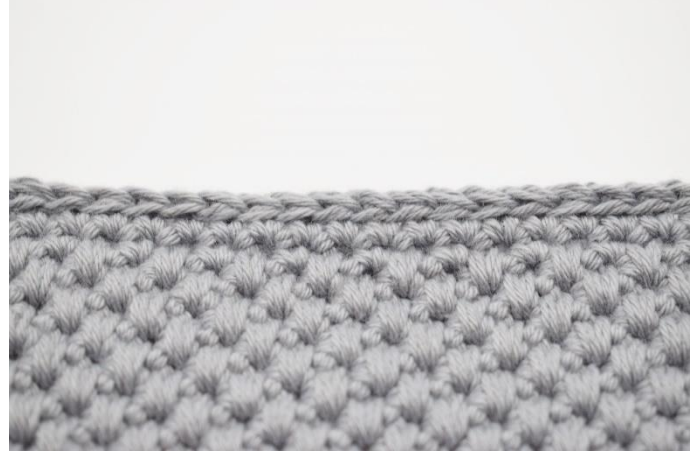
Finish with a round of sc's and here after a round Cut the yarn and weave in ends. of sl sts.