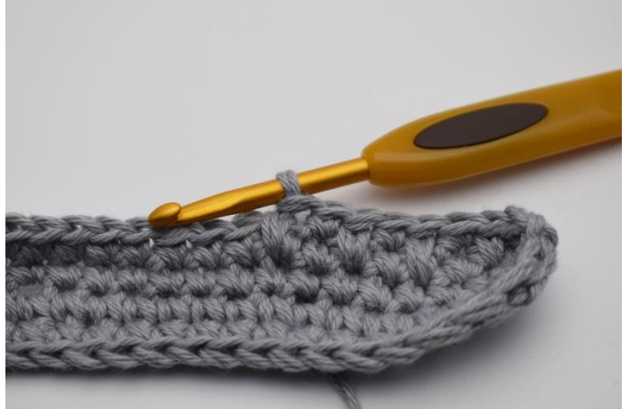
6. Like this.

5. Work a lsc again in the next st. You work this like a normal sc, but in the st from the previous round. (The needle shows where to work your lsc)