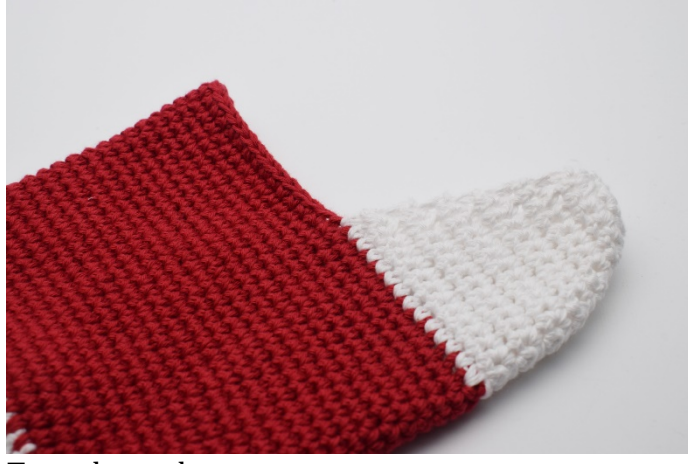
Turn the sock.

1. Turn the sock and attach the yarn as shown in the picture below. Work 1 sc in 32 st to where the heel starts and now work 14 st along one side of the heel and 14 st along the other side of the heel (60).