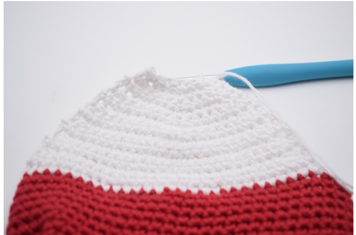
The heel now looks like this.