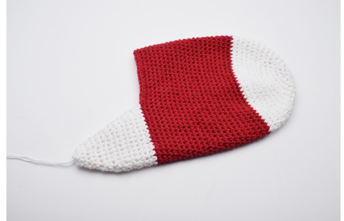
Sew up the end on the wrong side. Your heel is now done.