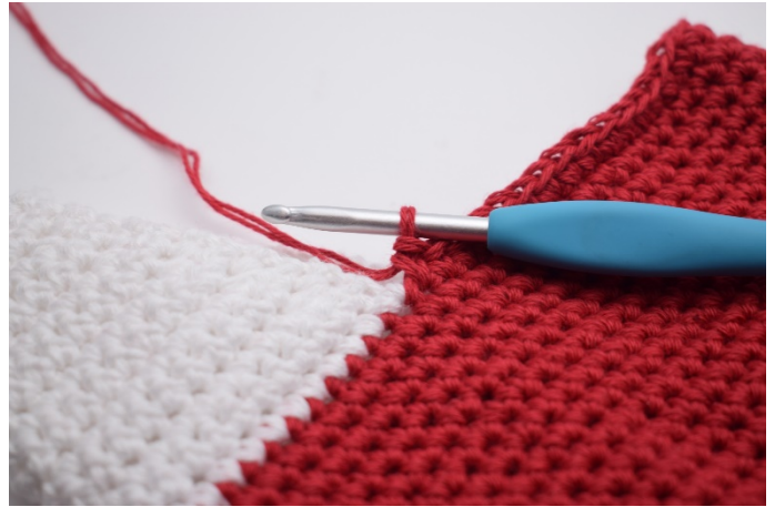
Work 1 sc in 32 st to where the heel starts.