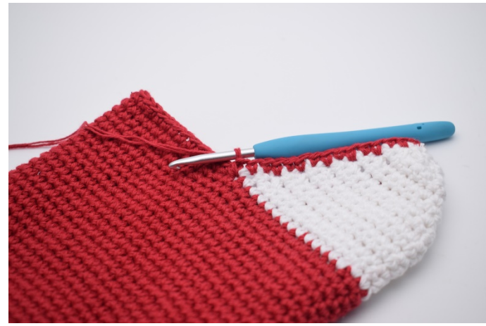
And 14 sc along the other side of the heel.