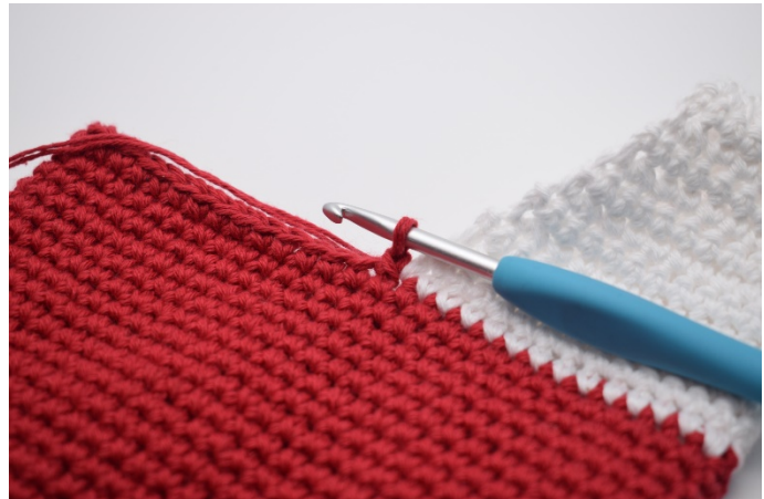
Attach the red yarn.