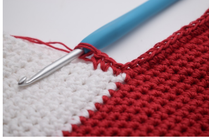
Now work 14 sc along one side of the heel.