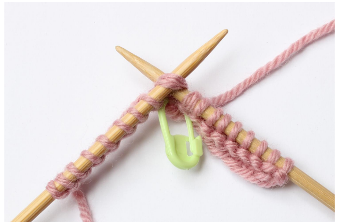
4. Insert the needle into 2 sts, from left to right