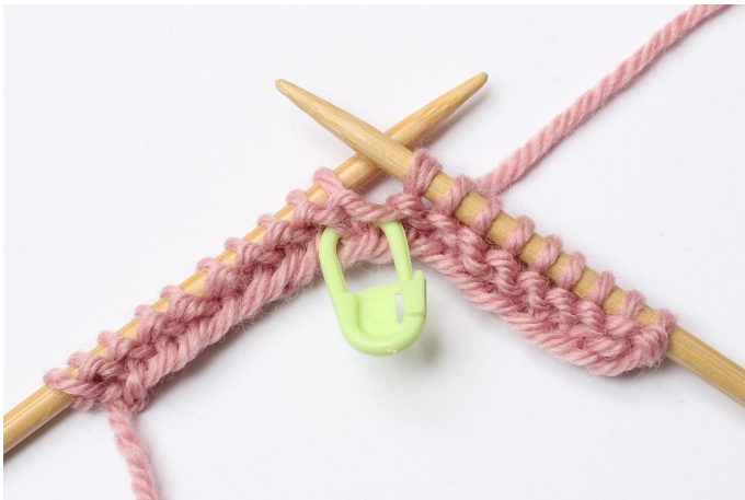
3. Move it on to the right needle