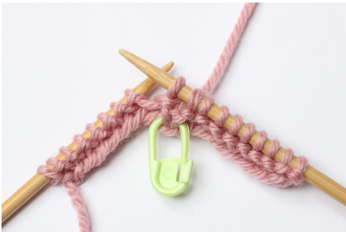
5. knit these sts together knitwise