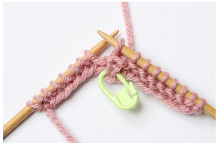
6. Pull or lift the slipped s over the knitted sts.