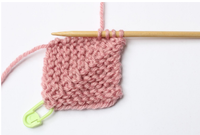
1. Insert needle through the piece between 2 ridges, pull yarn through to create a stitch