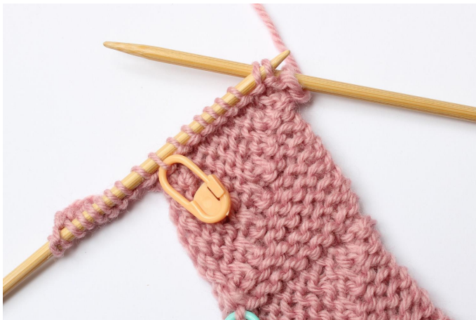
Photo Tutorial – Half domino with decreases on both sides and middle

Next row (RS): sl 1, k2tog, pass the sl st over = 1 st remaining.