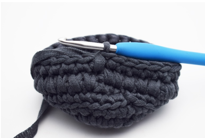
7. Like this.