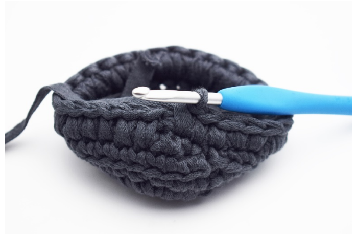
4. Repeat like this around using lsc.