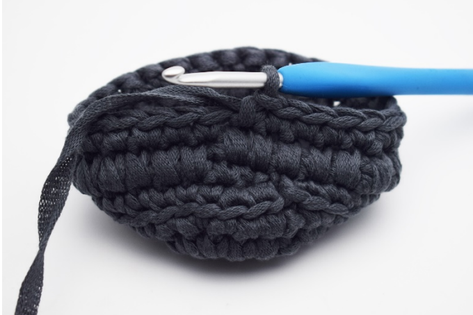
5. Work 1 round of sc as usual.