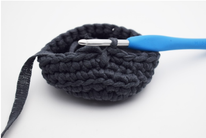
3. There. Now you've made your first lsc.