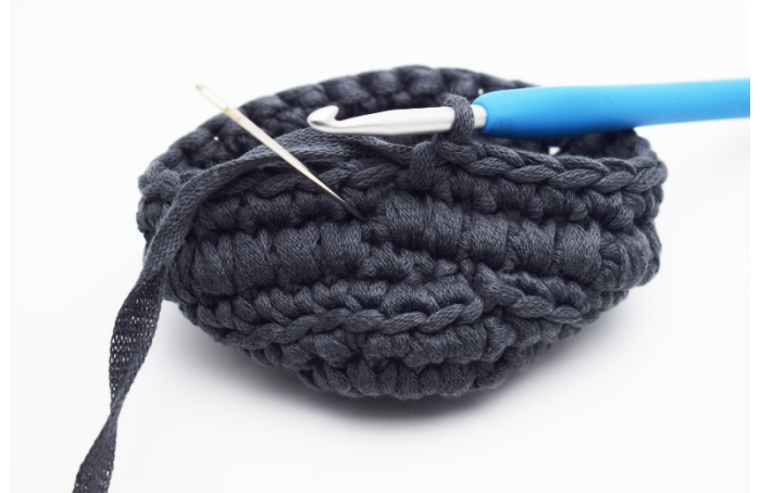
6. Now work one round of lsc again. Here the needle marks where to work your next lsc.