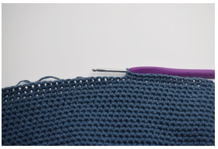
Rnd 1: Work 16 sc, 18 sl st, 33 sc, 18 sl st, 17 sc.