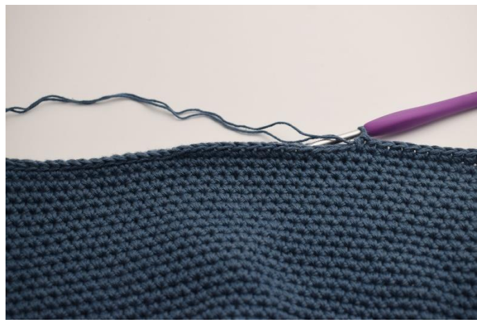
4. 18 sl st.