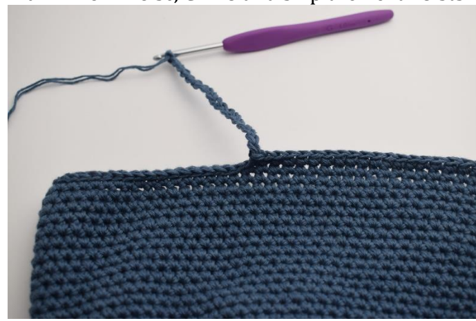
Rnd 2: Work 16 sc, Ch 18 and skip the next 18 sts. 33 sc, Ch 18 and skip the next 18 sts, 17 sc.