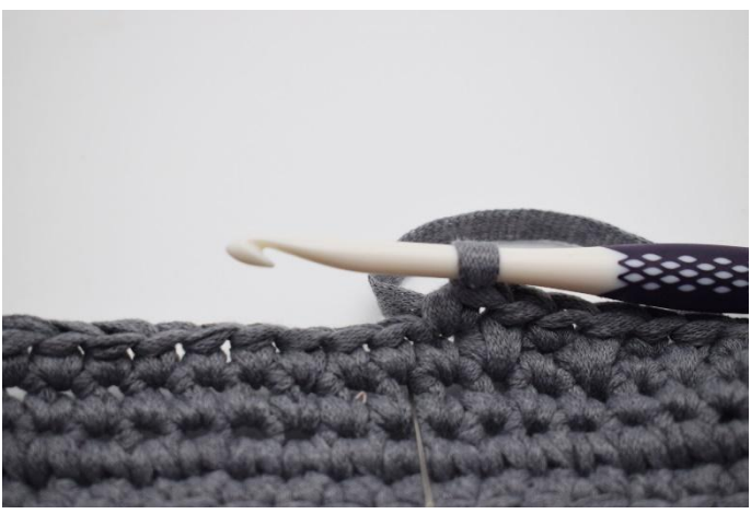
2. Now, work 1 lsc. This is done in the s under the one you would normally work the next sc. The needle marks where you should work your sc, so it becomes a long sc.