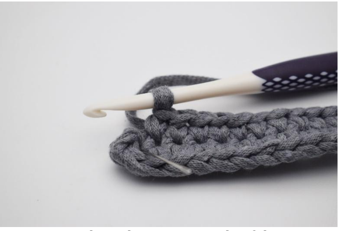
6. Now, work on the opposite side of the foundation ch. Work 1 sc in the next 32 ch. I sc in the last ch. (here, marked by the needle).