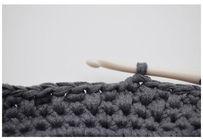
8. The next round is worked by alternating between "1lsc, 1 sc."