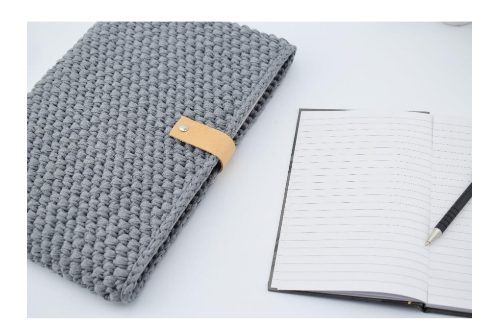
Happy crocheting ⊚ Love Hobbii