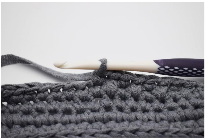
5. Like this.