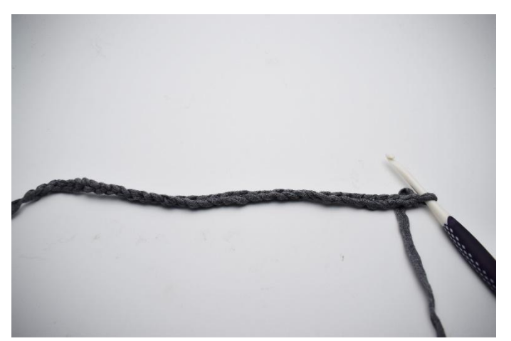
1. Start by chaining a foundation chain.