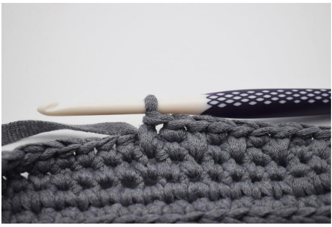
7. Continue like this till the end of the round, and finish with 1 sc.