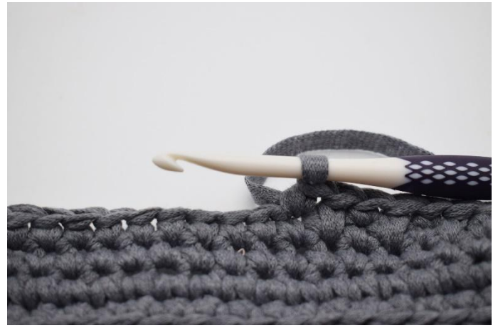
1. Now, alternate between "1sc, 1lsc". 1 sc has just been crocheted.