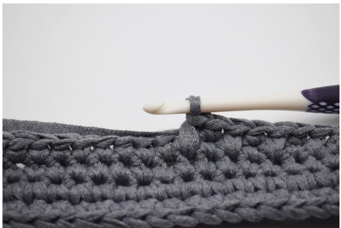
3. Like this. Now, you have worked1 sc, and 1 lsc.