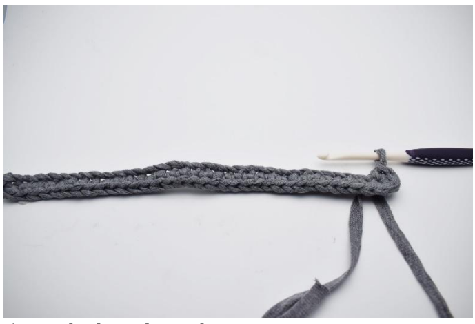
5. In the last ch work 4 sc.