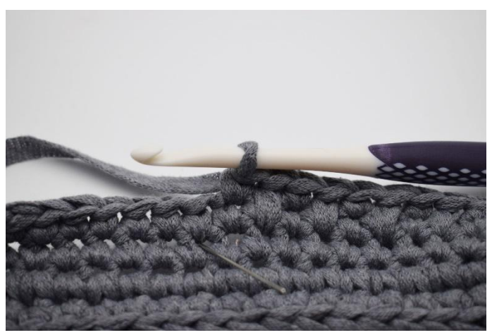
6. Now, work one more lsc. The needle shows where you should work your next s to make it a lsc.