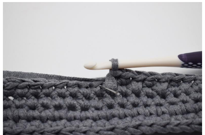
4. The next sc is worked as you normally would in the next s.