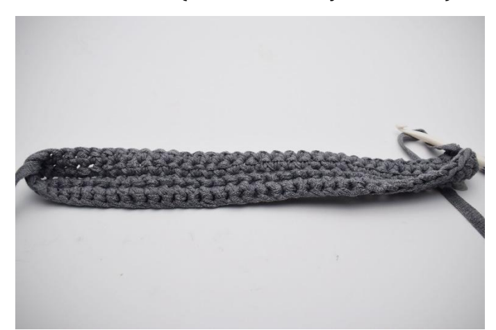
8. Work 1 rnd of sc. (71)