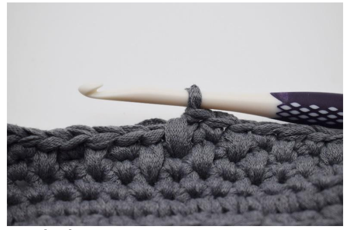
10. Like this.