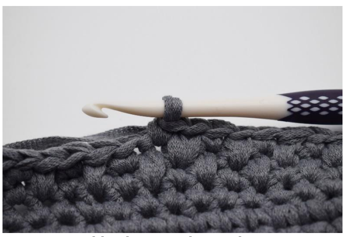
12. Continue like this in each round.