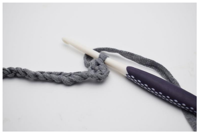
3. Work 2 sc.