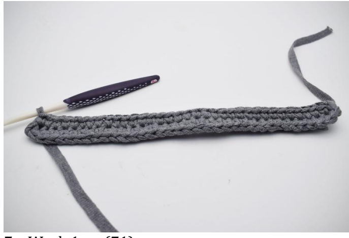
7. Work 1 sc. (71)