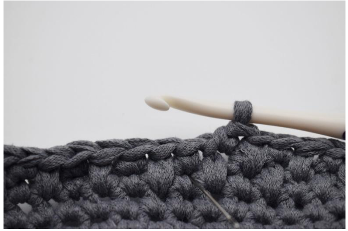
9. Here, the needle marks where your next s should be worked so it becomes a lsc.