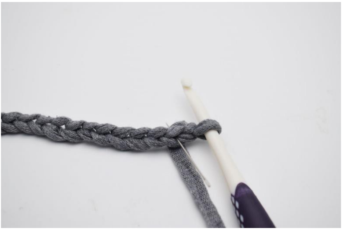
2. In the 2. ch from the hook (here, marked by the needle).