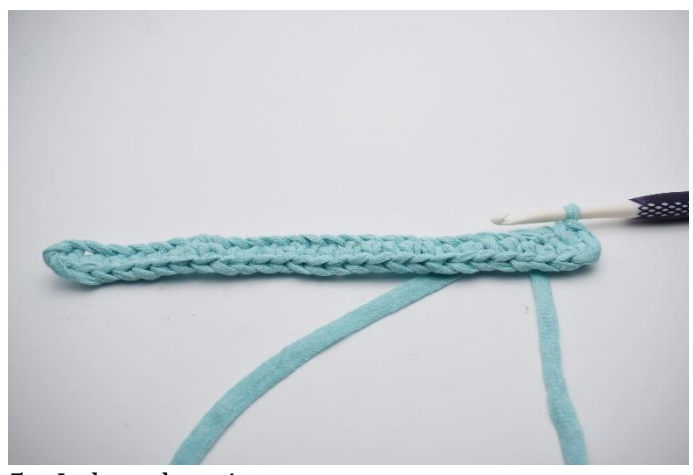
5. In last ch sc 4.