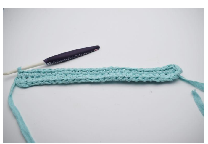
8. Sc 1. (55)