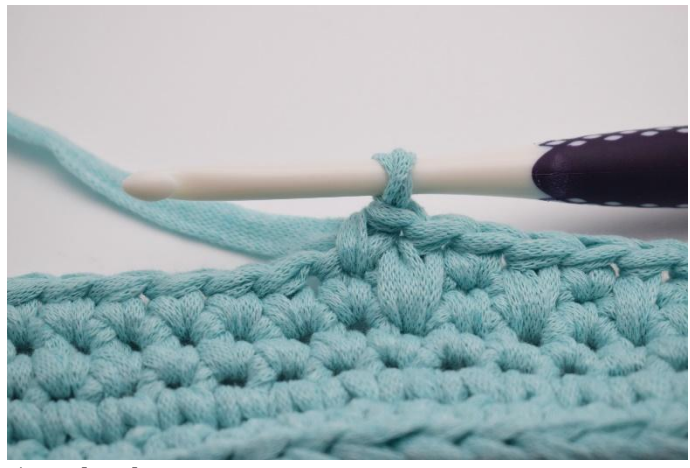
5. Like this.