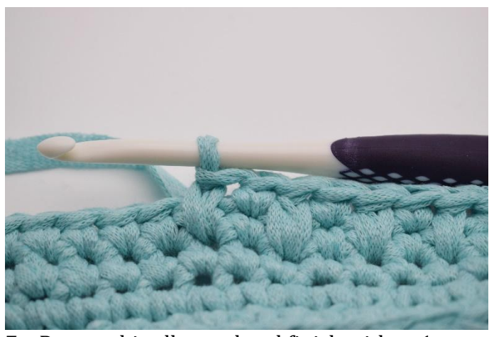
7. Repeat this all round and finish with sc 1.