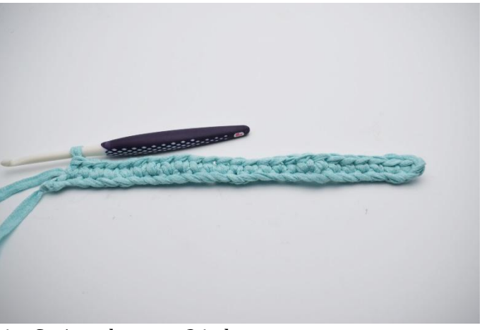
4. Sc 1 in the next 24 ch.