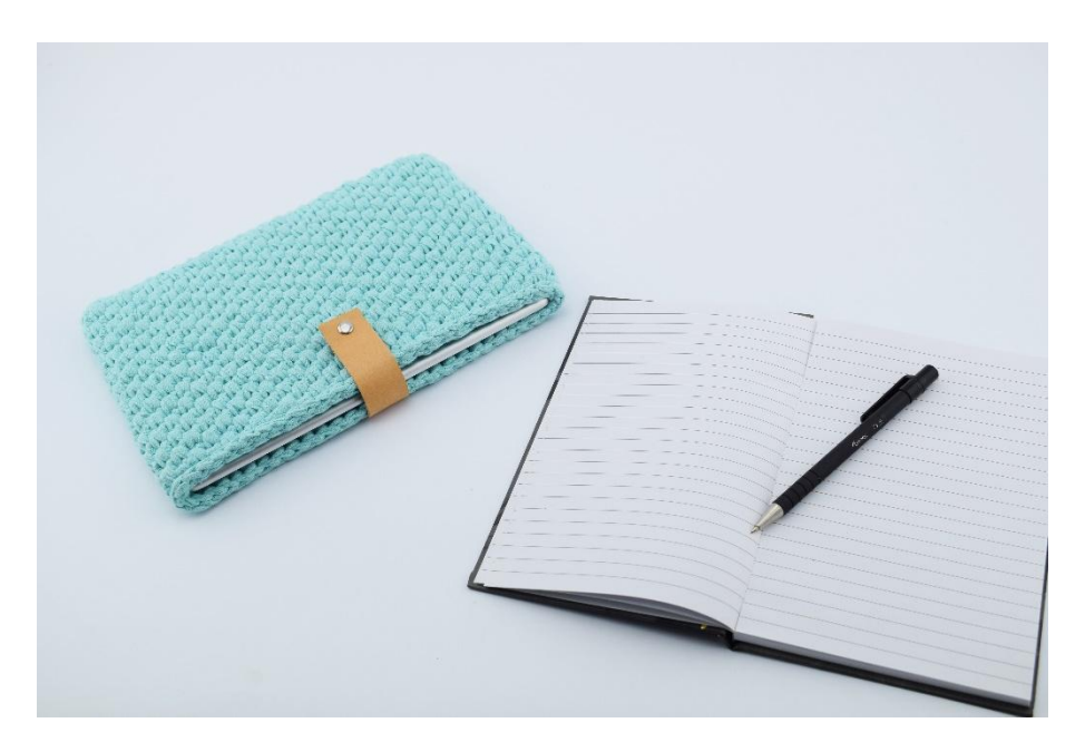
Enjoy ☺ Best wishes Hobbii.com