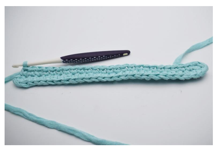
6. Now crochet into the other side of your ch row. Sc in the next 24 ch.