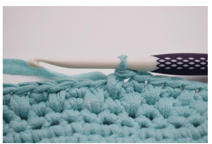
10. Like this.