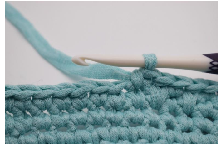
1. Now repeat "sc 1, lsc 1" all round. Last stitch made in picture above is sc 1.