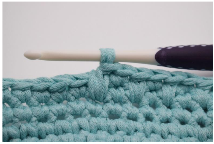
3. Like this - You've now made 1 sc and 1 lsc.