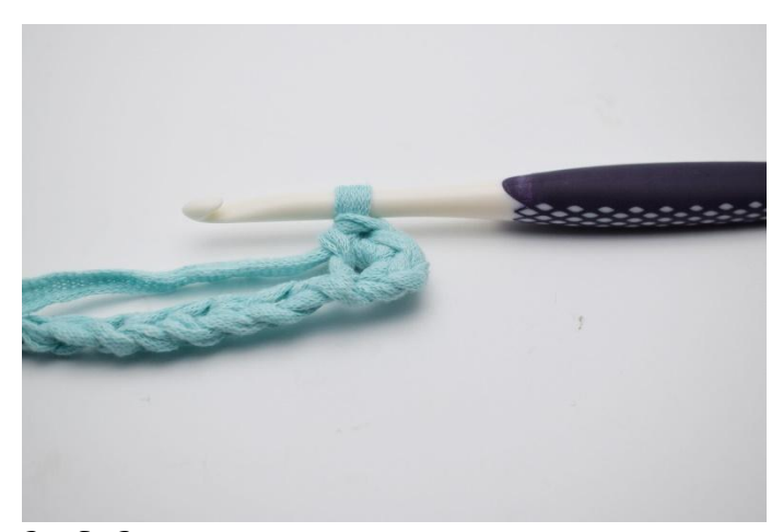
3. Sc 2.