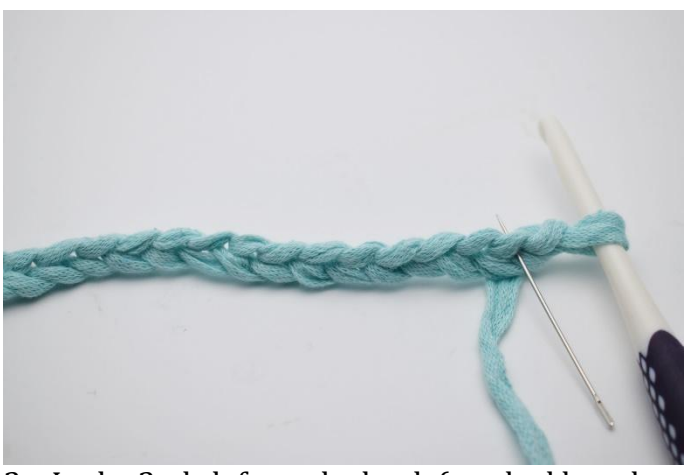
2. In the 2nd ch from the hook (marked here by the needle)