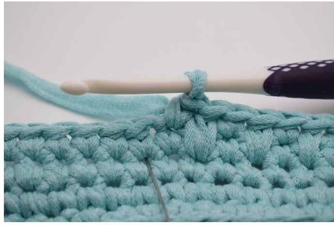
6. Now make another lsc. The needle here shows where to put your sc to make it a long sc.