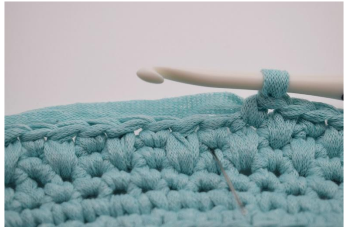
9. The needle here shows where to put your next sc to make it a long sc.