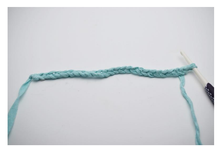
1. Start with your chain.