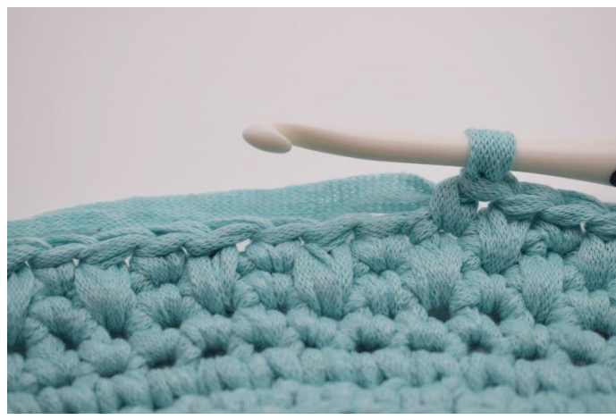
8. Next round repeat "lsc1, sc 1".