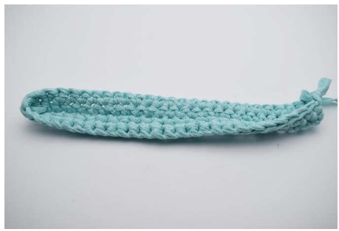
9. Sc 1 round.