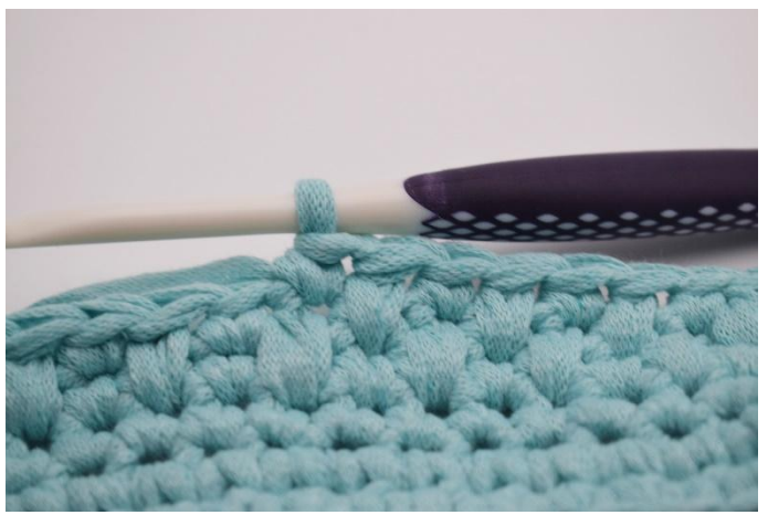
12. Repeat all rounds like this.