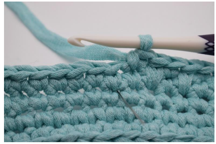
2. Now it's time for lsc 1. You make this stitch below where you would normally put your sc. The needle here shows where to put your sc to make it a long sc.