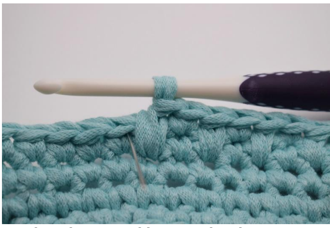
4. Place the next sc like normal in the next st.