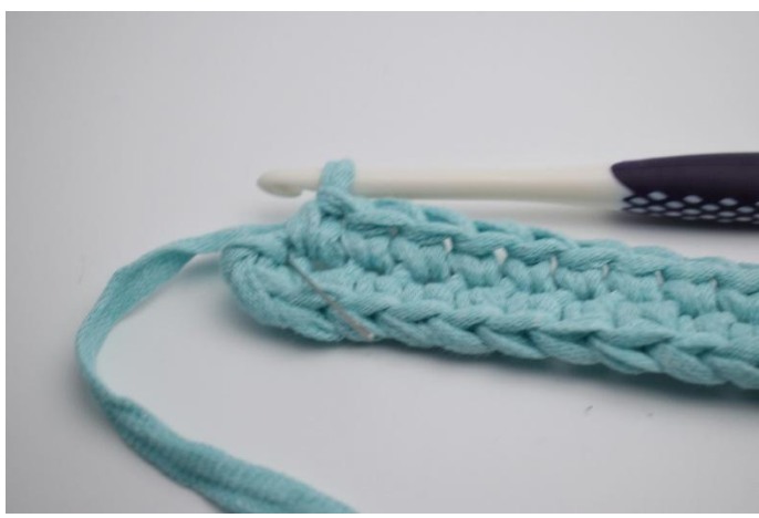
7. In last ch (as marked here by the needle)