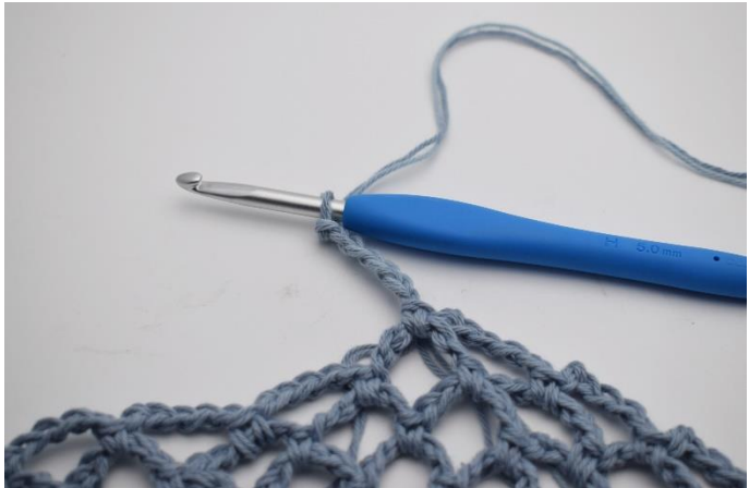
18. Change 1 strand to Color 2, so you are now working with 1 strand of color 1 and one strand of color 2. Ch 5 with the new color.