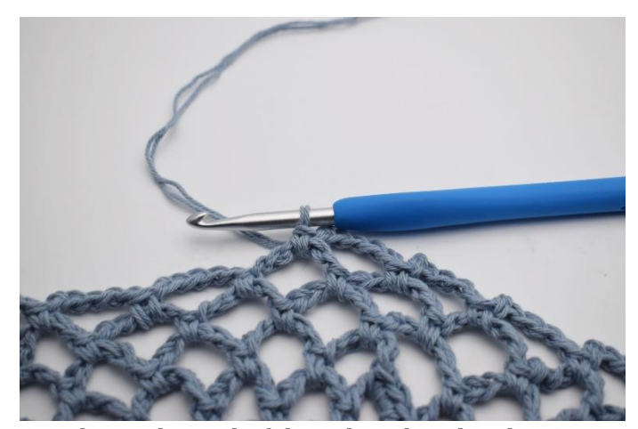
17. This is the end of the 4th rnd with color 1.