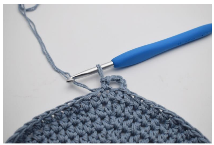
3. skip 1 st, and work 1 sc in the next st.