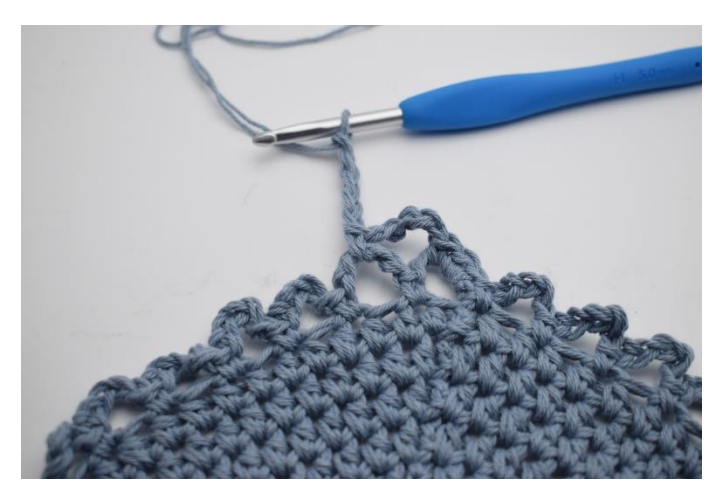
11. Ch 5.