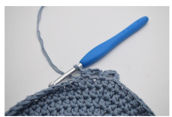
5. skip 1 st, and work 1 sc in the next st.