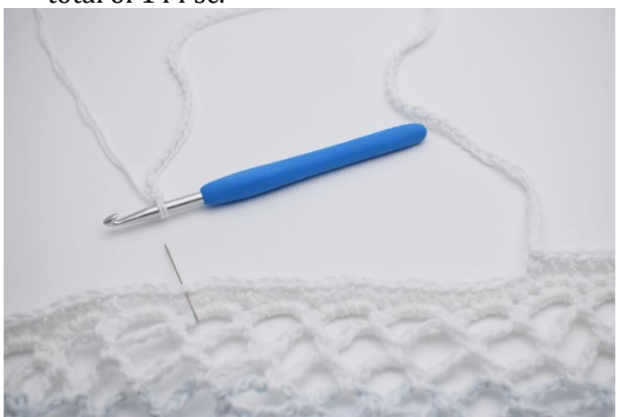
5. Now work the rnd with the handle. Ch 1 and work 1 sc in the next 52 sts. Ch 75. Skip the next 20 sts