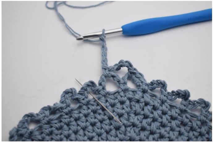
12. In the next ch loop. (Where the needle is pointing)