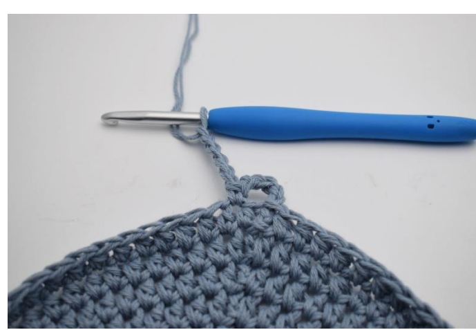
4. Ch 5.