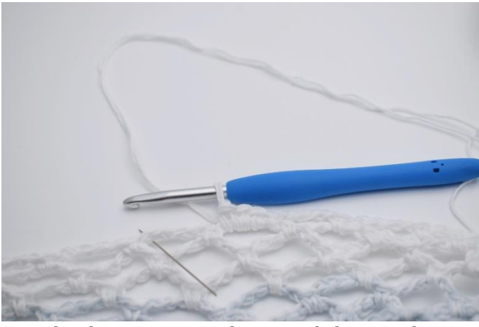
2. Like this. Repeat in the next ch-loop and continue to the end of the rnd.