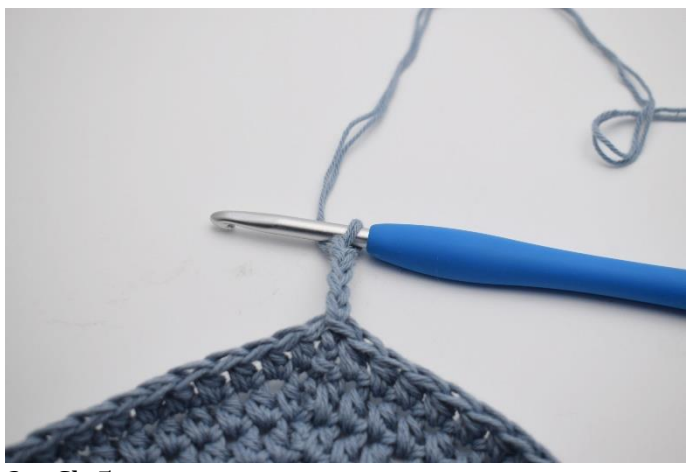
2. Ch 5.