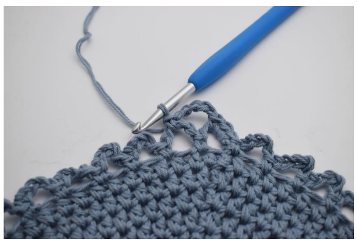
10. Work 1 sc.