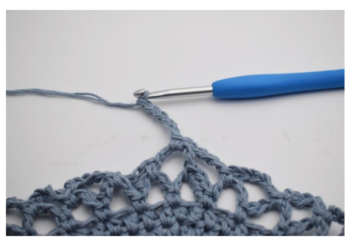
15. Now you are ready for the next rnd. Ch 5.