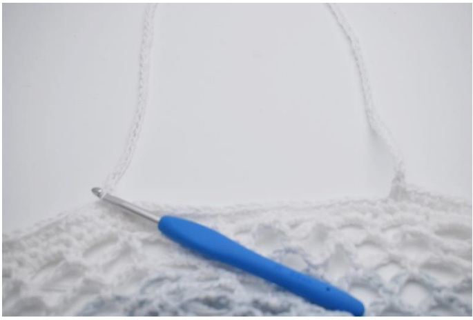
8. End with a sl st.