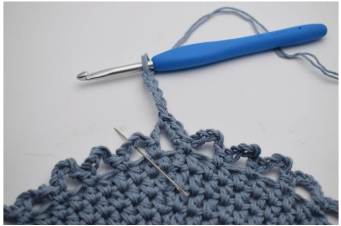
9. In the next ch loop. (Where the needle is pointing)