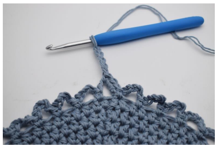
8. Ch 5.