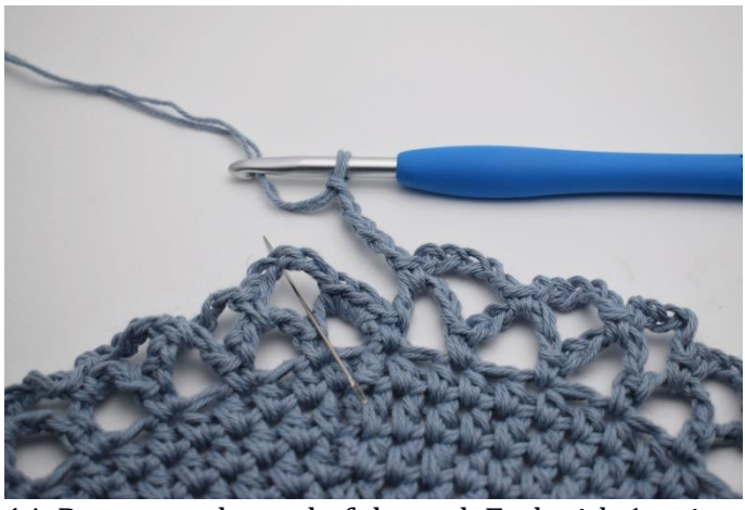
14. Repeat to the end of the rnd. End with 1 sc in the first ch-loop that you started the row with.