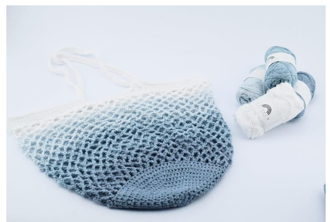
10. Weave in the ends and now your beach bag is ready to use! (3)