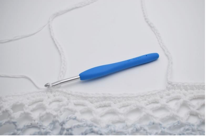
6. Work 1 sc in the next st.