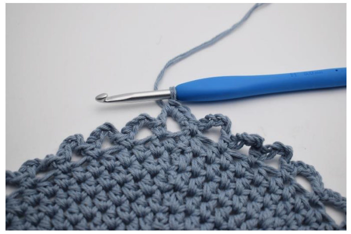
7. Work 3 sl st along the first ch-loop, so you are starting in the middle of it.