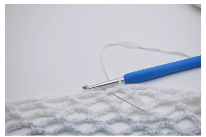
1. In each ch-loop, work 4 sc.