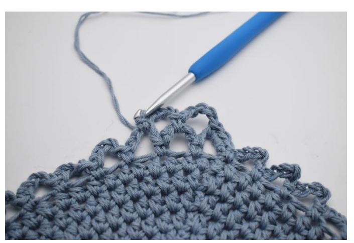
13. Work 1 sc.