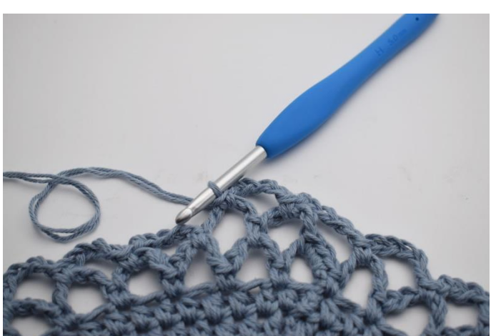
16. Work 1 sc into the next ch-loop. Repeat to the end of the rnd and continue until you have a total of 4 rnds with Color 1.