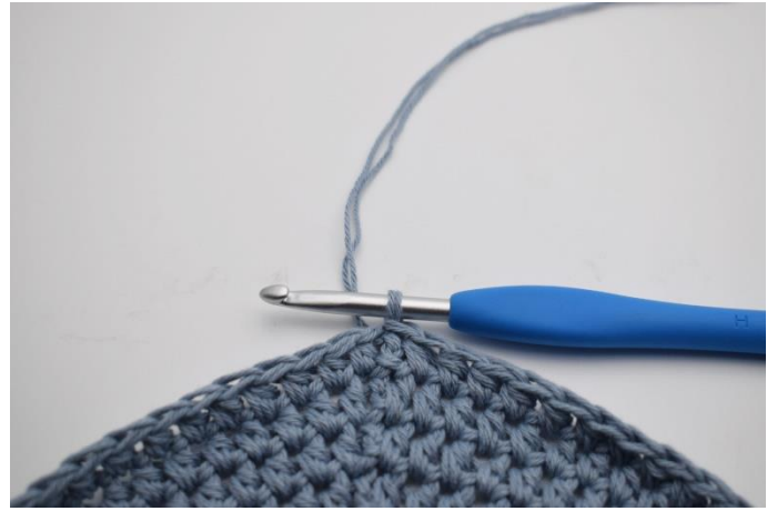
1. This is the end of the base with the final sl st.