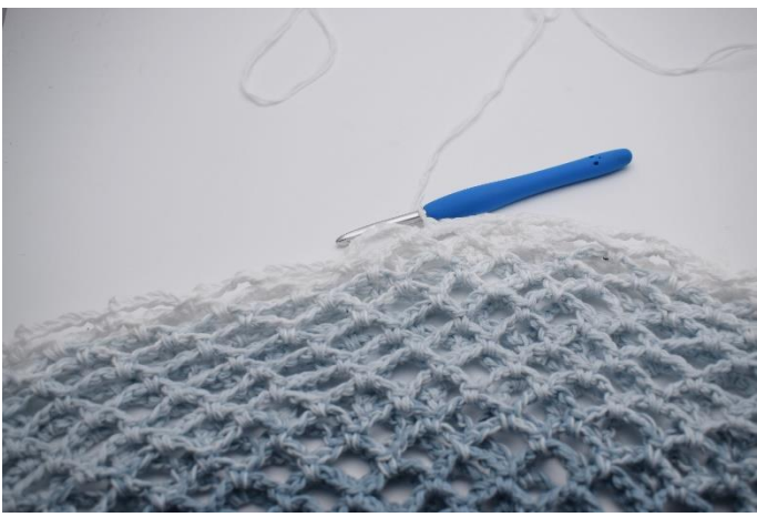
20. Now you have worked a total of 20 rnds and the last 2 rnds are with Color 4.