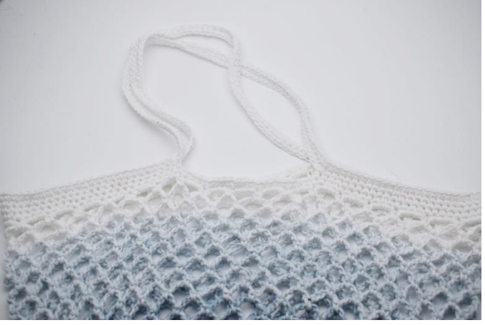
9. Ch 1 and work 1 rnd of sc in the sides and handle. Repeat 2 times or until you reach the desired width of your handles..