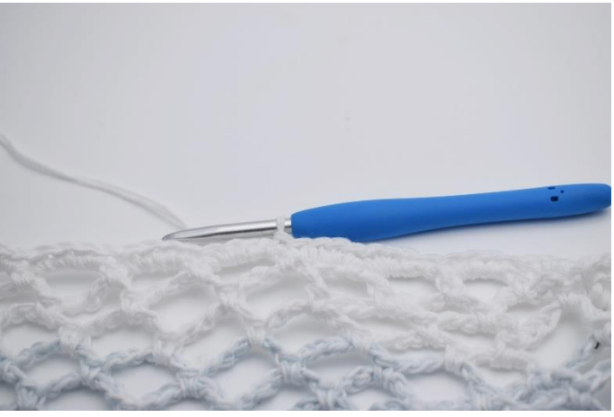
3. End with a sl st in the first sc. Now you have a 4. Ch 1, and work 1 rnd of sc. End with a sl st. total of 144 sc.