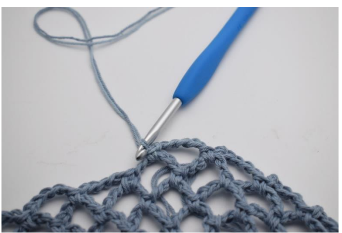
19. Work 1 sc into the next ch-loop. Repeat to the end of the rnd and continue until you have a total of 2 rnds with Color 1& 2. Then change to color 2 and work 4 rnds with it. Continue in this manner as described in the ombre effect section.