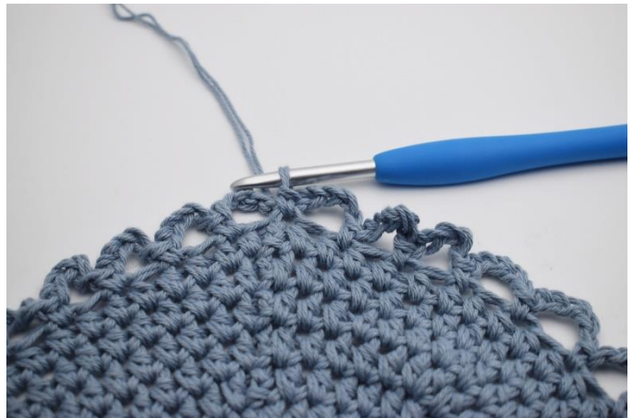
6. Repeat to the end of the rnd, so now you have 36 ch-loops around your base.